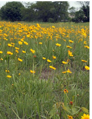
View of the campus, and sand coreopsis blooming, a few months after mowing stopped