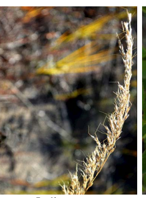
Indiangrass Sorghastrum nutans