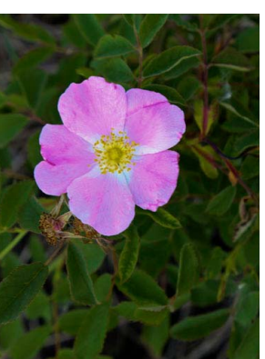
Smooth Rose Rosa blanda