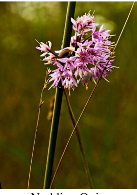
Nodding Onion Allium cernuum

Museum ecologists noted the site's unique topography, undisturbed sandy soils, and a few native plants growing in the rougher areas of the site. These were all clues that something very special lay beneath the mowed field. These suspicions were confirmed when mowing of the area ceased and thousands of native plants emerged. A plant inventory in 2015 already documented over 75 species of plants, including one state-endangered species, Mountain Blue-eved Grass, and two state-threatened species, Golden and Prairie Hummock Sedge. An ecological contractor has also been hired to control invasive species and weeds within the dune and swale habitat. A new walking trail around the site and interpretive signage invite visitors to explore and watch this beautiful piece of Indiana's heritage come back to life.