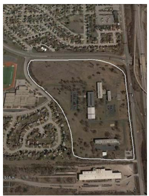
Research and Development Center Dune and Swale Trail Map