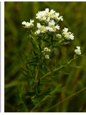
Virginia Mountain mint Pycnanthemum virginianum