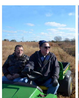
Arcelor staff check on the progress Contractors conduct the first ever of and watch the prescribed fire November 2016