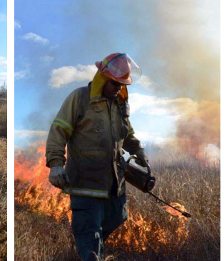
prescription burn of the site