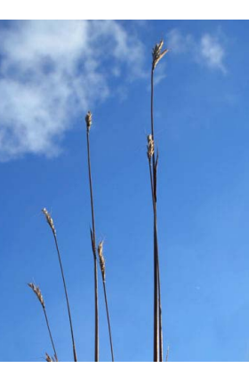
Big Bluestem Andropogon gerardi