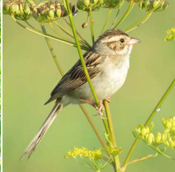
3 Clay-colored Sparrow Spizella pallida EMBERIZIDAE Preferred Habitat: Lawn front parks, in shrubs, thickets, brush in and near fields. Seasonal: Late-April to late-May and mid-September to mid-October Field Marks: Strong dark "mustache", gray nape and bright buffy breast