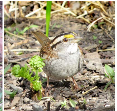
20 White-throated Sparrow Zonotrichia albicollis EMBERIZIDAE

Preferred Habitat: Fields with scattered thickets, bushes or tangles. Also, woodland edges. Seasonal: Mid-April to mid-May and mid-September to late-October Field Marks: Pinkish-orange bill, black and white "bike helmet" crown, plain gray underside and broad white "eyebrow"