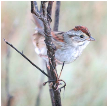
17 Swamp Sparrow Melospiza georgiana EMBERIZIDAE

Preferred Habitat: Wood edges, thickets and in bushes that are open or semi-open. Seasonal: Year-round resident Field Marks: Throat stripes radiate from central breast blotch, brown & gray crown stripes and coarse broad brown streaks on breast