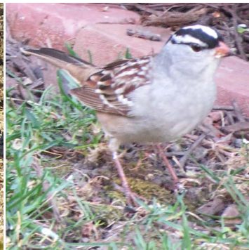
19 White-crowned Sparrow Zonotrichia leucophrys EMBERIZIDAE

Preferred Habitat: Grassy and weedy fields, fallow or cultivated fields. Prefer drier areas with bushes or hedgegroves. Seasonal: Early-April to late-August Field Marks: White eye-ring, uniformly streaked back, pale white jaw line and off-white belly