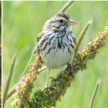
15 Savannah Sparrow Passerculus sandwichensis EMBERIZIDAE

Preferred Habitat: Inland grassy fresh water marshes and wet prairies. Seasonal: Mid to late-May and mid-September to late-October Field Marks: Bluish bill and bright orange face and breast. White belly with gray collar