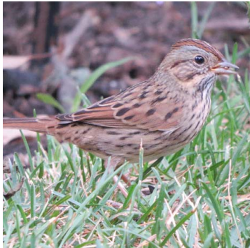
13 Lincoln's Sparrow Melospiza lincolnii EMBERIZIDAE

Rapid Color Guide # 881 version 2 8/2017