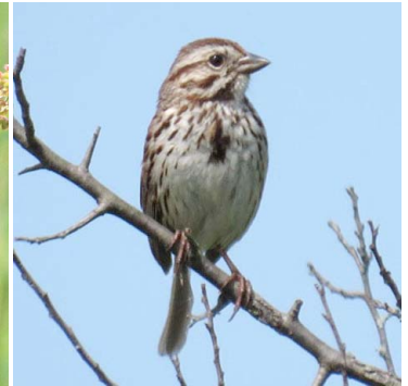
16 Song Sparrow Melospiza melodia EMBERIZIDAE

Preferred Habitat: Grassy fields and meadows with short grass. Seasonal: Early-April to late-October Field Marks: Pointed pink bill, streaked breast, yellow spot between bill & eye, strong eye-line and "mustache"