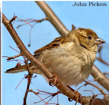
9 House Sparrow (male) Passer domesticus PASSERIDAE Comment: Invasive species and actually a Finch not a sparrow despite the name. Preferred Habitat: Areas with human habitation. Seasonal: Year-round resident Field Marks: Stout yellowish-gray bill, black bib on throat & chest, gray head & belly and rufous neck