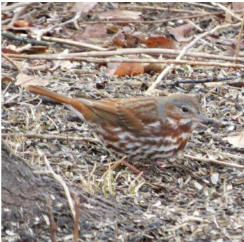
5 Fox Sparrow Passerella iliaca EMBERIZIDAE Preferred Habitat: Woodland thickets, wood edges, & in brushy or weedy fields. Seasonal: Mid-March to mid-April and early-October to mid-November Field Marks: Bright rufous streaks radiate from central breast blotch, rufous & gray head and bright rufous wings & tail