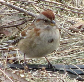
1 American Tree Sparrow Spizella arborea EMBERIZIDAE Preferred Habitat: Weedy edges of woods, weedy fields, sometimes yard feeders. Seasonal: Late-October to mid-April Field Marks: Dark central spot on breast, bi-colored bill and mostly rufous crown

Rapid Color Guide # 881 version 2 08/2017