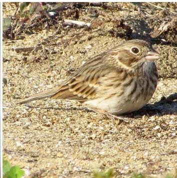
18 Vesper Sparrow Poecetes gramineus EMBERIZIDAE

Preferred Habitat: Marshy areas bordered with thickets and tangles. Woody edges during migration. Seasonal: Mid-March to late-October Field Marks: Small slender bill with yellow base, clean gray breast, rufous crown and buffy-rufous flanks