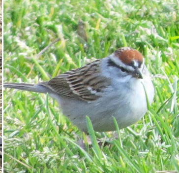
2 Chipping Sparrow Spizella passerina EMBERIZIDAE Preferred Habitat: Lawn-like areas with trees or thickets. Golf courses, cemeteries, rural yards and edges of woods. Seasonal: Mid-April to late-September Field Marks: Dark eye-line, rufous crown and unstreaked whitish gray breast