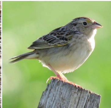
6 Grasshopper Sparrow Ammodramus savannarum EMBERIZIDAE Preferred Habitat: Fallow or grassy fields, lake front parks during migration. Seasonal: Mid-April to late-August Field Marks: Large bill, buffy breast & throat, complete eye-ring and rufous, black & gray back