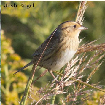
Josh Engel 14 Nelson's Sparrow Ammodramus nelsoni EMBERIZIDAE

Preferred Habitat: Wood edges, thickets, shrubs and wet bushy areas. Lake front parks during migration. Seasonal: May and mid-September to mid-October Field Marks: Small slender bill, buffy eye-ring, white belly, buffy breast with dark streaks and crisp dark streaks on flanks and breast