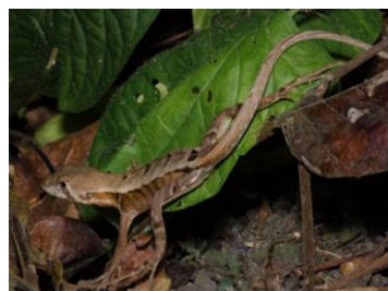
78 Stenocercus iridescens IGUANIDAE