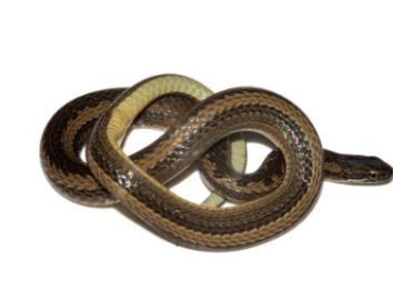
15 Coniophanes dromiciformis COLUBRIDAE