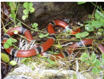
5 Micrurus dumerilii ELAPIDAE - Venenosa