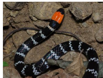
7 Micrurus mipartitus ELAPIDAE - Venenosa