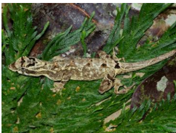
69 Anolis lyra IGUANIDAE