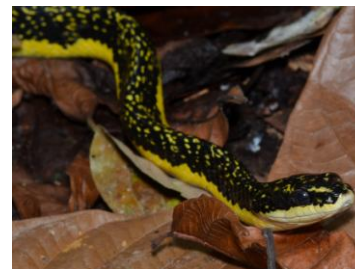
39 Phrynonax shropshirei COLUBRIDAE