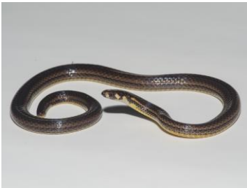
49 Tantilla melanocephala COLUBRIDAE