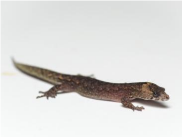
81 Lepidoblepharis buchwaldi SPHAERODACTYLIDAE