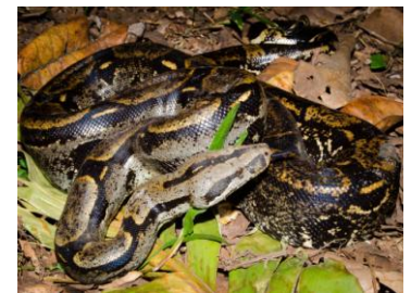
8 Boa constrictor BOIDAE