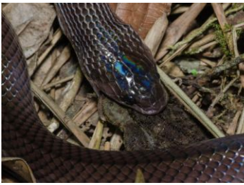
10 Clelia clelia COLUBRIDAE