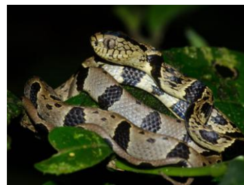
19 Dipsas andiana COLUBRIDAE