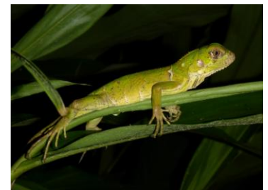
72 Iguana iguana IGUANIDAE (DV)