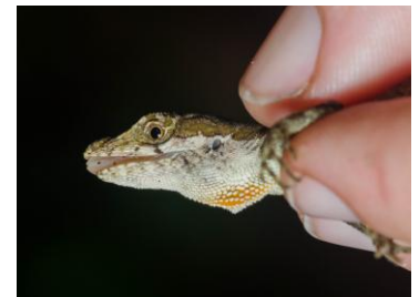
68 Anolis binotatus IGUANIDAE