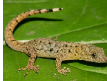
83 Gonatodes caudiscutatus SPHAERODACTYLIDAE