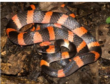
29 Oxyrhopus petola COLUBRIDAE