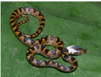
25 Leptodeira septentrionalis COLUBRIDAE