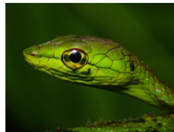
31 Oxybelis brevirostris COLUBRIDAE