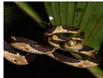
35 Imantodes cenchoa COLUBRIDAE