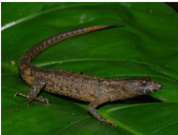
53 Echinosaura horrida GYMNOPHTHALMIDAE