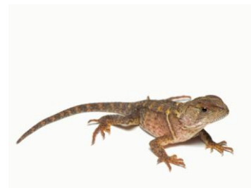
75 Enyalioides heterolepis IGUANIDAE