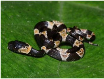
21 Dipsas gracilis COLUBRIDAE