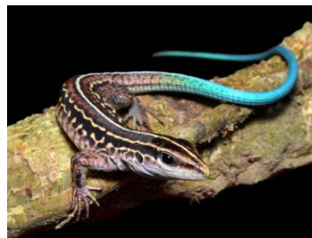
59 Ameiva septemlineata IGUANIDAE