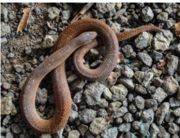
45 Stenorrhina degenhardtii COLUBRIDAE