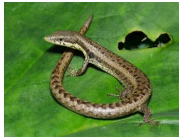
55 Anadia rhombifera GYMNOPHTHALMIDAE