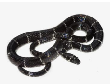
33 Pliocercus euryzonus COLUBRIDAE