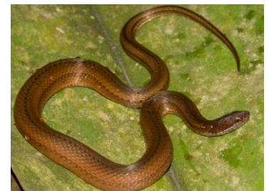
16 Coniophanes fissidens COLUBRIDAE