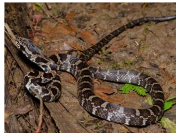
26 Mastigodryas pulchriceps COLUBRIDAE