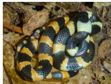
30 Oxyrhopus petola COLUBRIDAE (MM)