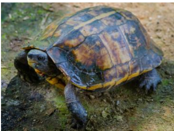
85 Rhinoclemmys annulata GEOEMYDIDAE