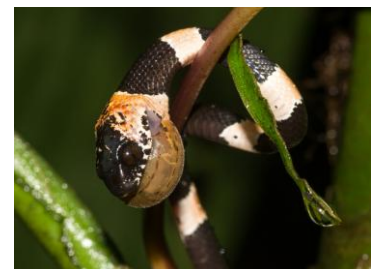
20 Dipsas gracilis COLUBRIDAE