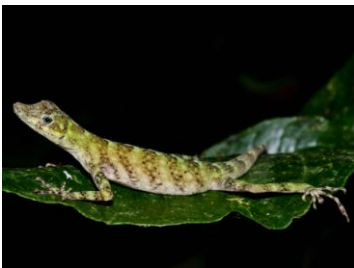
65 Anolis peraccae IGUANIDAE