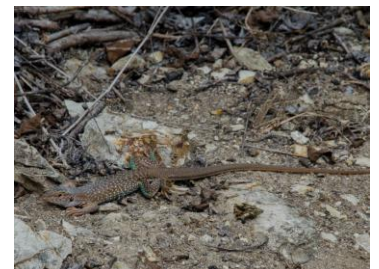
60 Ameiva septemlineata IGUANIDAE