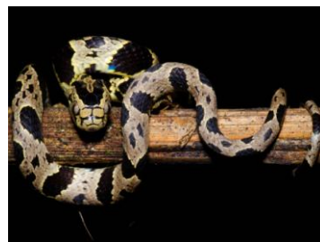
18 Dipsas andiana COLUBRIDAE