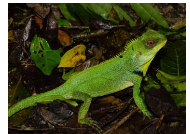
76 Enyalioides oshaughnessyi IGUANIDAE