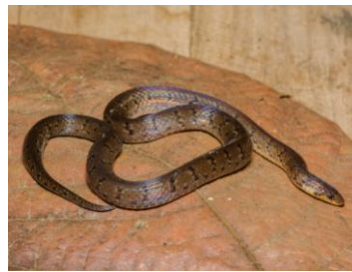
47 Atractus cf. occidentalis COLUBRIDAE