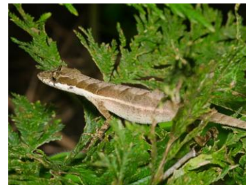
67 Anolis binotatus IGUANIDAE