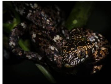
22 Sibon nebulatus COLUBRIDAE