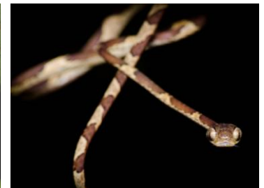
36 Imantodes cenchoa COLUBRIDAE