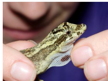
70 Anolis lyra IGUANIDAE