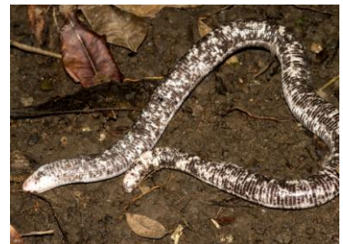
88 Amphisbaena varia AMPHISBAENIDAE