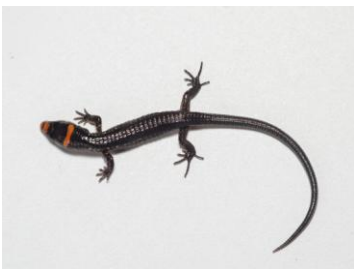
57 Ptychoglossus cf. gorgonae GYMNOPHTHALMIDAE