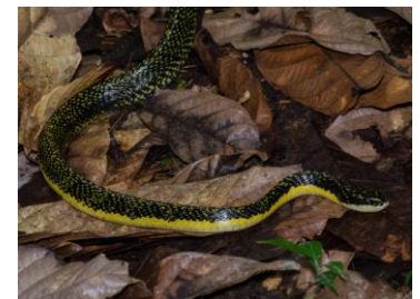
40 Phrynonax shropshirei COLUBRIDAE