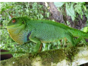
77 Enyalioides oshaughnessyi IGUANIDAE