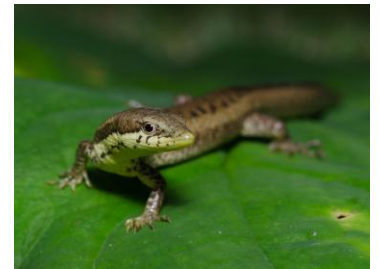
56 Anadia rhombifera GYMNOPHTHALMIDAE