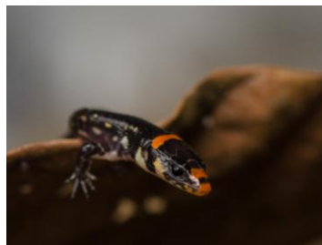
58 Ptychoglossus cf. gorgonae GYMNOPHTHALMIDAE