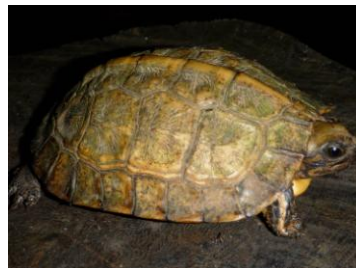
86 Rhinoclemmys annulata GEOEMYDIDAE