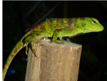
62 Anolis biporcatus IGUANIDAE (JV)