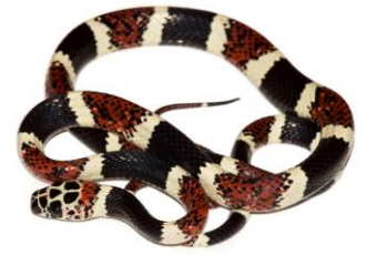
44 Rhinobothryum bovallii COLUBRIDAE