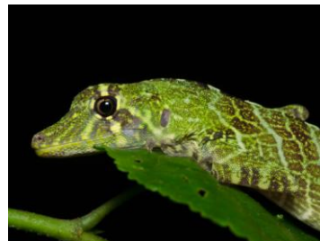
66 Anolis princeps IGUANIDAE