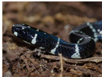
34 Pliocercus euryzonus COLUBRIDAE