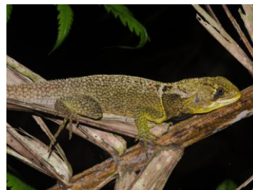
74 Enyalioides heterolepis IGUANIDAE