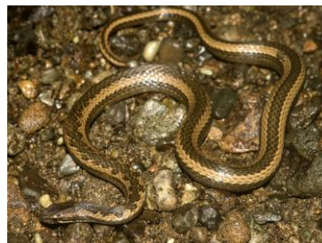
14 Coniophanes dromiciformis COLUBRIDAE