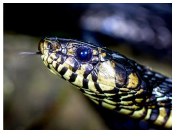
38 Spilotes cf pullatus COLUBRIDAE