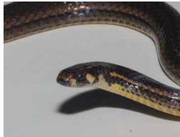
50 Tantilla melanocephala COLUBRIDAE