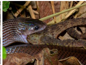
11 Clelia clelia COLUBRIDAE