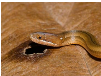
17 Coniophanes fissidens COLUBRIDAE