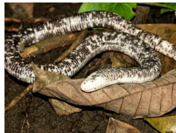
87 Amphisbaena varia AMPHISBAENIDAE