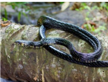
37 Spilotes cf pullatus COLUBRIDAE