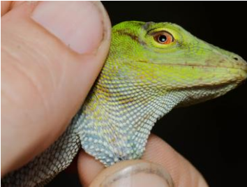
61 Anolis biporcatus IGUANIDAE