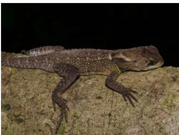
73 Enyalioides heterolepis IGUANIDAE