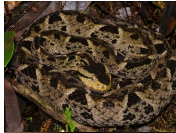
2 Bothrops asper VIPERIDAE - Venenosa