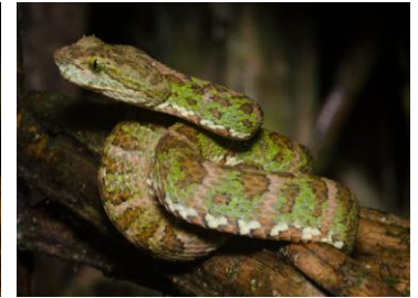
4 Bothriechis schlegelii VIPERIDAE - Venenosa