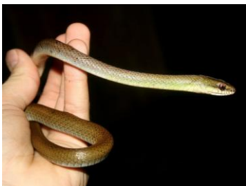
13 Mastigodryas reticulatus COLUBRIDAE