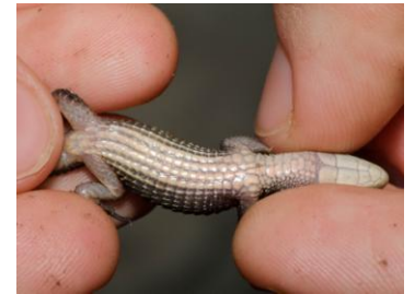
52 Alopoglossus festae GYMNOPHTHALMIDAE