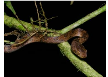
24 Leptodeira septentrionalis COLUBRIDAE