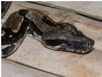
9 Boa constrictor BOIDAE