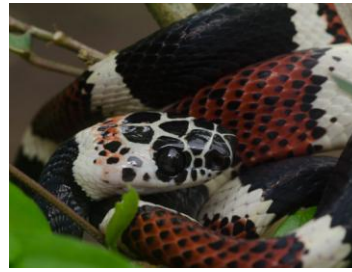
43 Rhinobothryum bovallii COLUBRIDAE