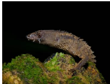
54 Echinosaura horrida GYMNOPHTHALMIDAE