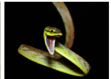
32 Oxybelis brevirostris COLUBRIDAE