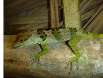
63 Anolis fraseri IGUANIDAE (UV)