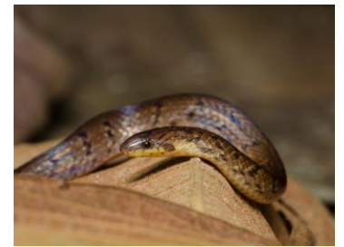
48 Atractus cf. occidentalis COLUBRIDAE