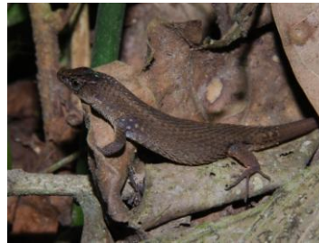
51 Alopoglossus festae GYMNOPHTHALMIDAE