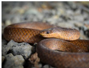
46 Stenorrhina degenhardtii COLUBRIDAE