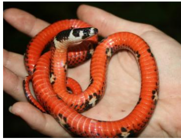
42 Tantilla supracincta COLUBRIDAE