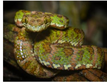
3 Bothriechis schlegelii VIPERIDAE - Venenosa