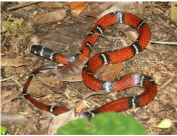
41 Tantilla supracincta COLUBRIDAE