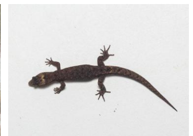
80 Lepidoblepharis buchwaldi SPHAERODACTYLIDAE