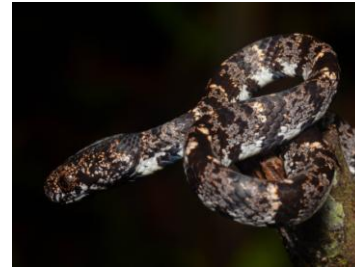
23 Sibon nebulatus COLUBRIDAE