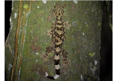
84 Thecadactylus rapicauda PHYLLODACTYLIDAE