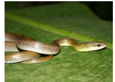
12 Mastigodryas reticulatus COLUBRIDAE