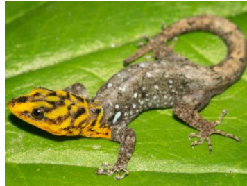
82 Gonatodes caudiscutatus SPHAERODACTYLIDAE