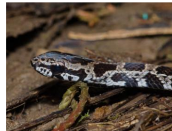
27 Mastigodryas pulchriceps COLUBRIDAE