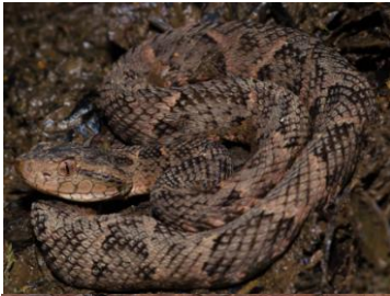
1 Bothrops asper VIPERIDAE - Venenosa