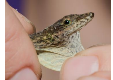
64 Anolis peraccae IGUANIDAE