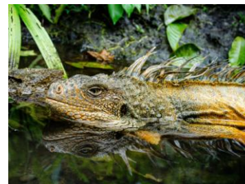
71 Iguana iguana IGUANIDAE