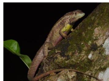
79 Stenocercus iridescens IGUANIDAE