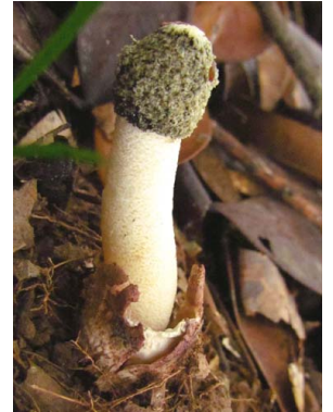
5 Itajahya galericulata PHALLACEAE