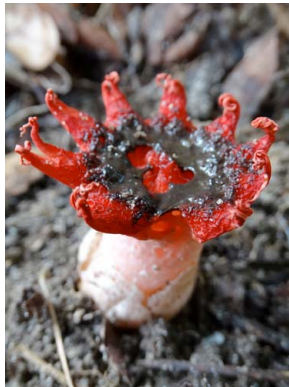
12 Aseroë rubra CLATHRACEAE