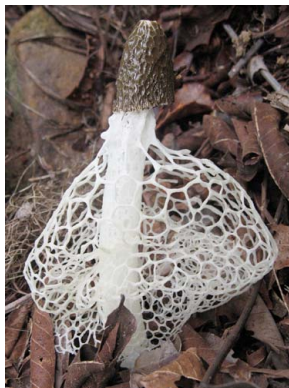
7 Phallus indusiatus PHALLACEAE