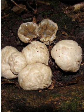
1 Protuberera maracuja PROTOPHALLACEAE

[LT_pereira@yahoo.com.br]. PhD in Botany, Federal University of Rio Grande do Sul, Brazil. Thanks to CAPES and many colleagues who collaborated sending photos. [fieldguides.fieldmuseum.org] [716] version 1 11/2015