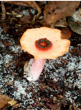
11 Abrachium floriforme CLATHRACEAE