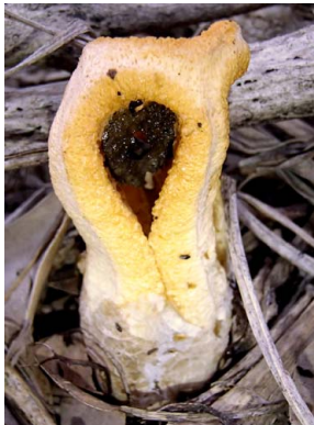
13 Clathrus columnatus CLATHRACEAE