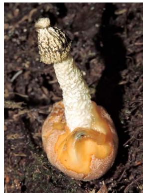
9 Phallus glutinolens PHALLACEAE