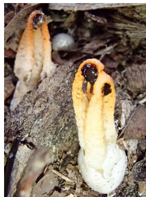
19 Laternea dringii CLATHRACEAE