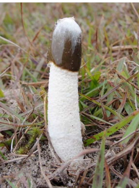
6 Phallus campanulatus PHALLACEAE