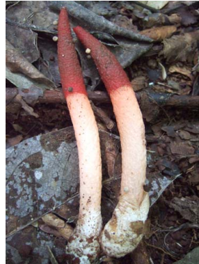
3 Mutinus argentinus PHALLACEAE