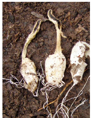
20 Pseudocolus garciae CLATHRACEAE