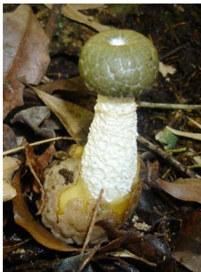
8 Phallus glutinolens PHALLACEAE