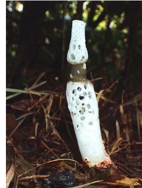
4 Staheliomyces cinctus PHALLACEAE