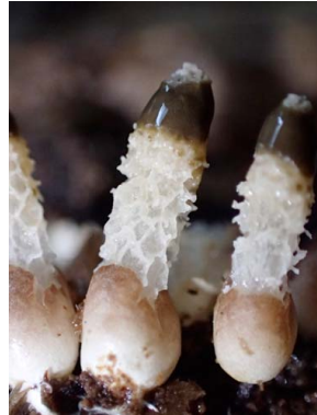
2 Xylophallus xylogenus PHALLACEAE