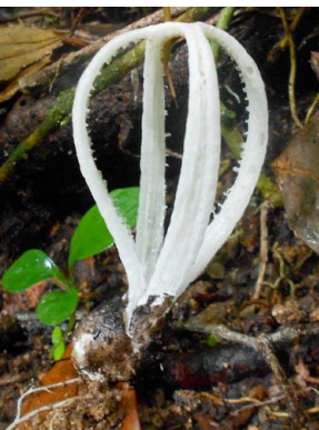
16 Blumenavia angolensis CLATHRACEAE