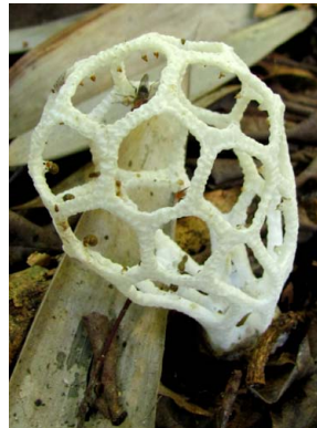
14 Clathrus chrysomycelinus CLATHRACEAE