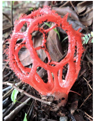
15 Clathrus aff. cristatus CLATHRACEAE