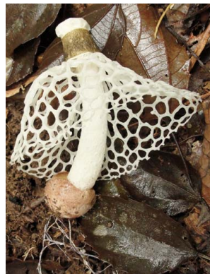
10 Phallus aff. merulinus PHALLACEAE