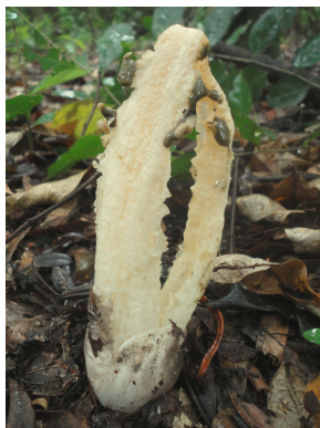
17 Blumenavia rhacodes CLATHRACEAE