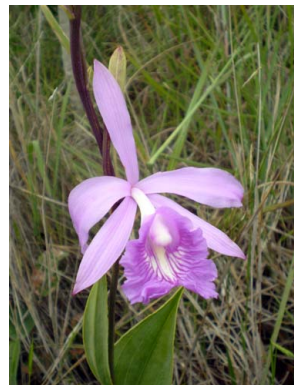
19 Epistephium sclerophyllum