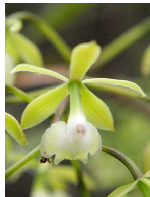
14 Epidendrum densiflorum