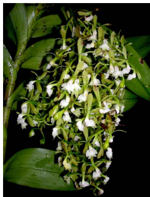
13 Epidendrum densiflorum