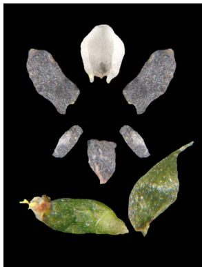
37 Prescottia oligantha