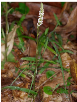
35 Prescottia oligantha