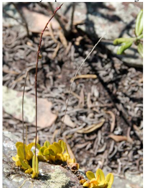
1 Bulbophyllum exaltatum