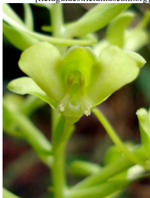
24 Habenaria petalodes