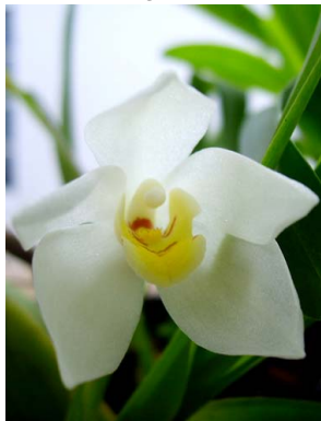
3 Camaridium ochroleucum