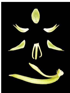
27 Habenaria secundiflora