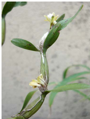
38 Scaphyglottis prolifera