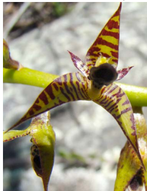
2 Bulbophyllum exaltatum