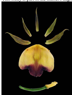
21 Galeandra montana