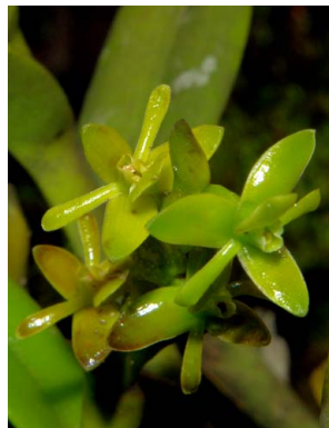
17 Epidendrum rigidum