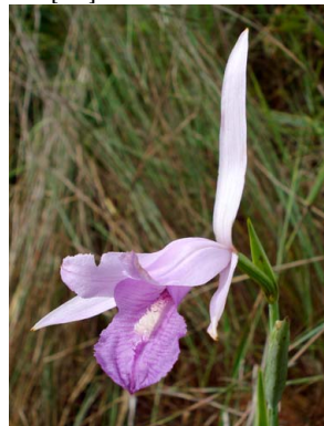
5 Cleistes paranaensis