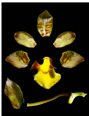
8 Cyrtopodium eugenii