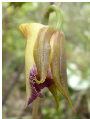
20 Galeandra montana