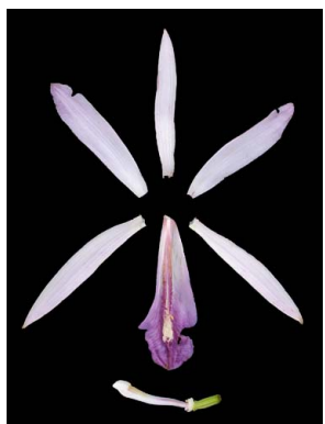
6 Cleistes paranaensis