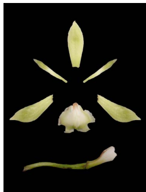
15 Epidendrum densiflorum