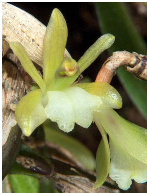
39 Scaphyglottis prolifera