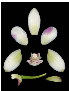
30 Koellensteinia tricolor