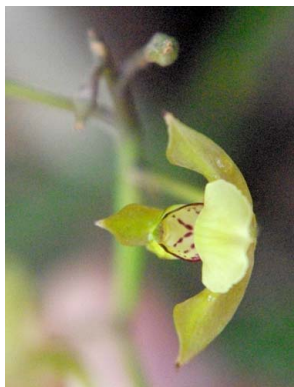
34 Orleanesia mineirosensis