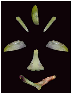
40 Scaphyglottis prolifera