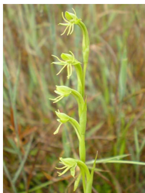
26 Habenaria secundiflora