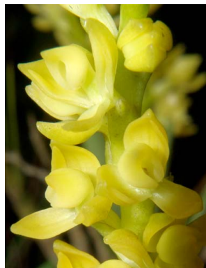
12 Epidendrum dendrobitoides