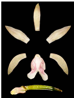
33 Oeceoclades maculata