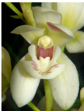
29 Koellensteinia tricolor