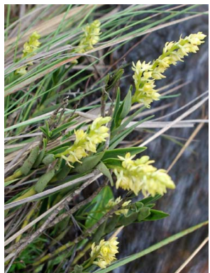
11 Epidendrum dendrobitoides