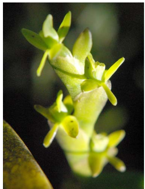
16 Epidendrum rigidum