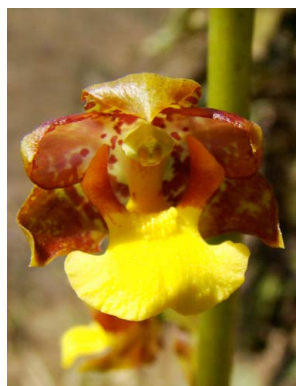
7 Cyrtopodium eugenii