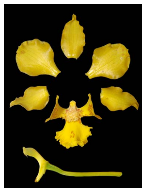
10 Cyrtopodium paludicolum