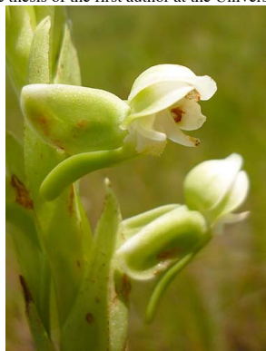
22 Habenaria obtusa