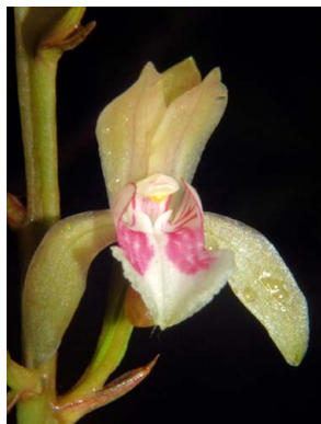
32 Oeceoclades maculata