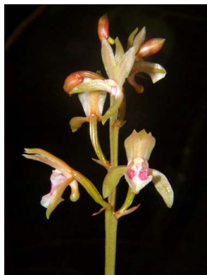
31 Oeceoclades maculata