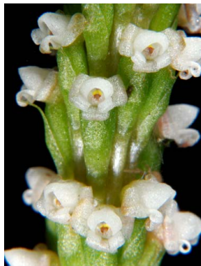
36 Prescottia oligantha