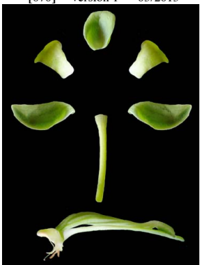
25 Habenaria petalodes