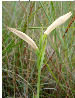
4 Cleistes mantiqueirae