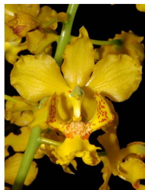
9 Cyrtopodium paludicolum