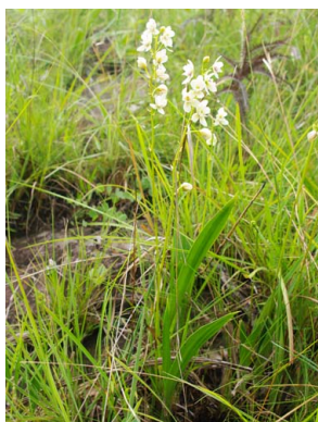
28 Koellensteinia tricolor