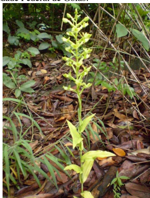
23 Habenaria petalodes