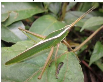
Prionolopha serrata Romaleidae: Romaleinae