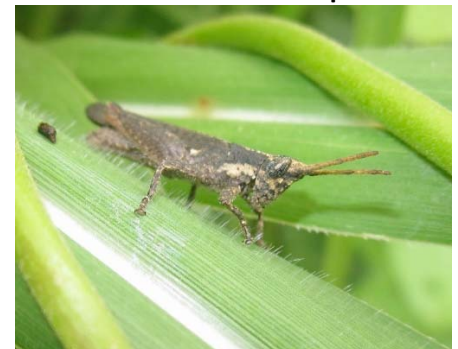
Vilerna rugulosa Acrididae: Ommatolampidinae