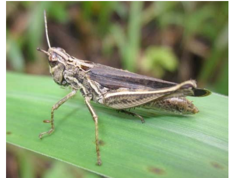
Orphulella concinnula (female) Acrididae: Gomphocerinae