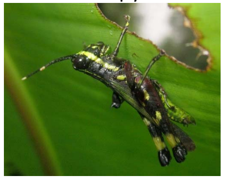
Tetrataenia surinama (male) Acrididae: Leptysminae