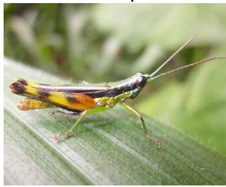
Stenopola puncticeps cf. amazonica Acrididae: Leptysminae