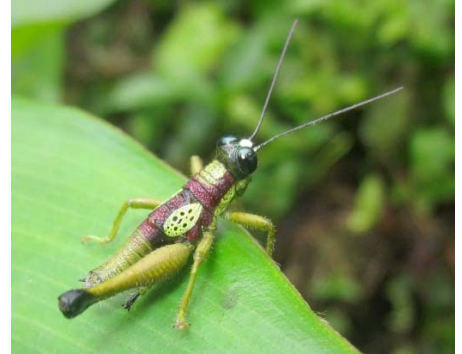
Hippariacris sp. Acrididae: Ommatolampidinae