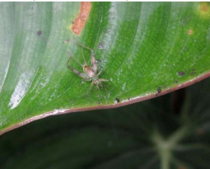
Cyrtoxipha sp. 1.