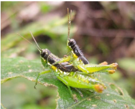
Liebermannacris dorsualis (couple) Acrididae: Ommatolampidinae