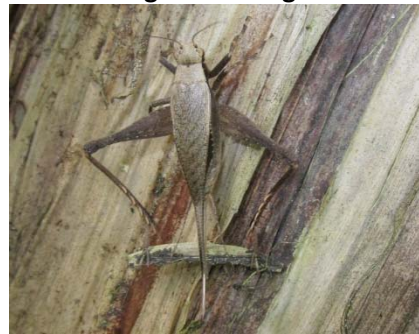
Eneoptera surinamensis (female)