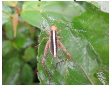
Eneoptera surinamensis (nymph)