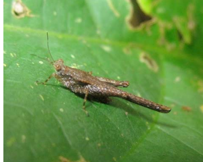
Stenodorus sp. (male)