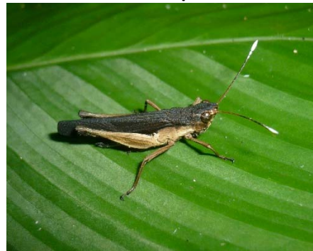
Peruvia nigromarginata Acrididae: Gomphocerinae