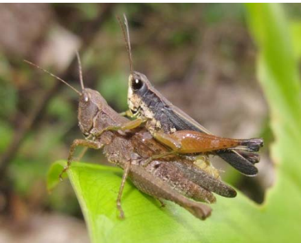
Orphulella punctata (couple) Acrididae: Gomphocerinae