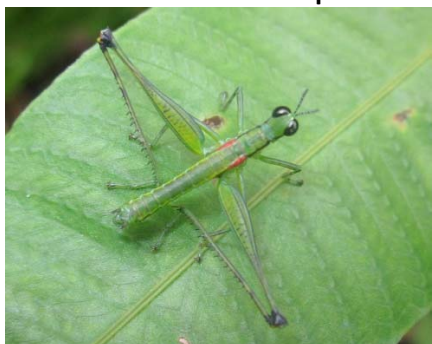
Beomastax equatoriana Eumastacidae: Eumastacinae