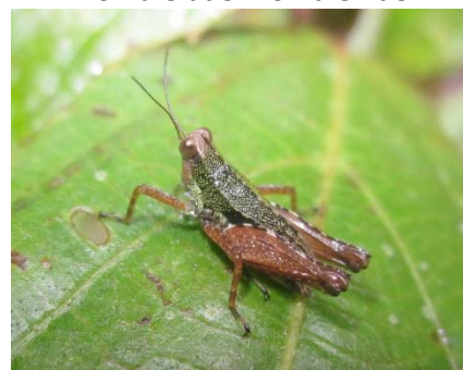
Scaria cf. hamata (brachypronotal form) Tetrigidae: Batrachideinae