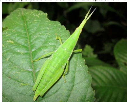
Omura congrua (female) Pyrgomorphidae : Pyrgomorphinae