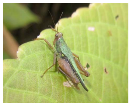
Scaria cf. hamata (macropronotal form) Tetrigidae: Batrachideinae