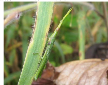
Omura congrua (female) Pyrgomorphidae : Pyrgomorphinae