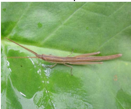
Cylindrotettix sp. Acrididae: Leptysminae