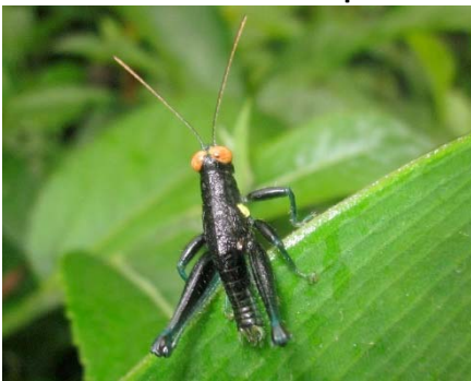
Psiloscirtus flavipes Acrididae: Ommatolampidinae