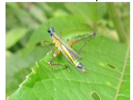
Eumastax zumuniana Eumastacidae: Eumastacinae