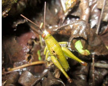
Hippariacris latona Acrididae: Ommatolampidinae