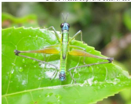
Eumastax equatoriana Eumastacidae: Eumastacinae