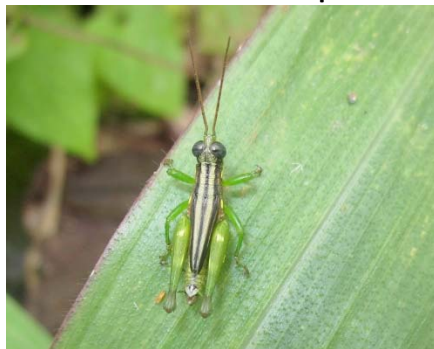
Syntomacris trivittata Acrididae: Ommatolampidinae