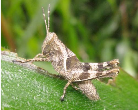
Abracris flavolineata (nyphm) Acrididae: Ommatolampidinae