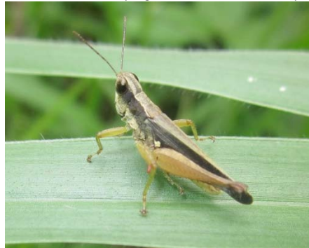
Orphulella concinnula (male) Acrididae: Gomphocerinae