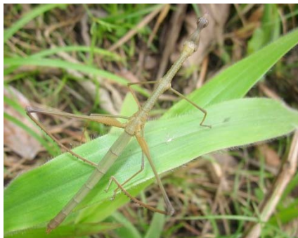
Apioscelis cf. bulbosa Proscopiidae: Proscopiinae