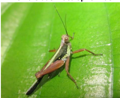
Scaria lineata Tetrigidae: Batrachideinae