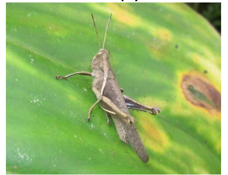
Abracris flavolineata (male) Acrididae: Ommatolampidinae