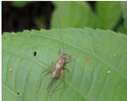
Cyrtoxipha sp. 2.