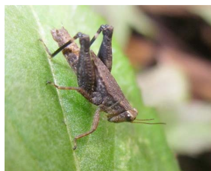
Batrachidea mucronata Tetrigidae: Batrachideinae