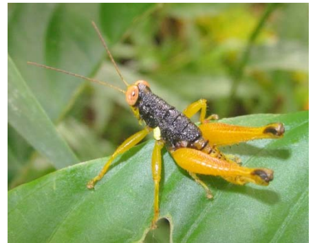
Psiloscirtus apterus (male) Acrididae: Ommatolampidinae