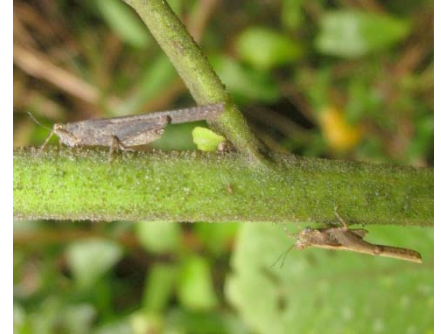
Stenodorus sp. (couple)