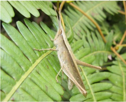
Metaleptea adspersa Acrididae: Acridinae