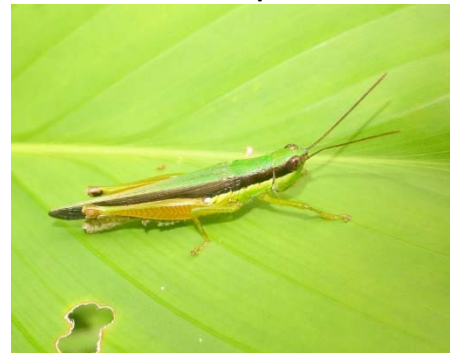
Cornops frenatum frenatum Acrididae: Leptysminae