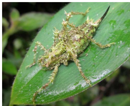
Adeclus cf. spiculatus