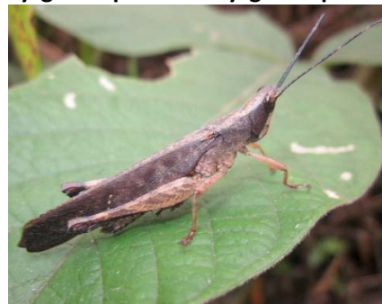
Phaeoparia lineaalba lineaalba Romaleidae: Romaleinae