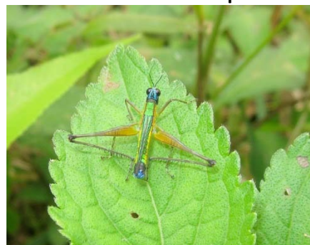
Eumastax zumuniana Eumastacidae: Eumastacinae