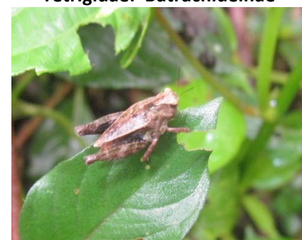
Halmatettix sp. Tetrigidae: Batrachideinae