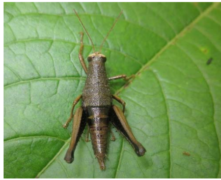
Psiloscirtus apterus (female) Acrididae: Ommatolampidinae