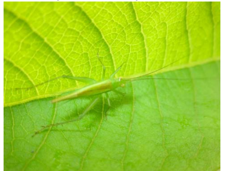
Cyrtoxipha sp. 3.