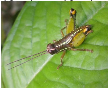
Helolampis coloniana Romaleidae: Bactrophorinae