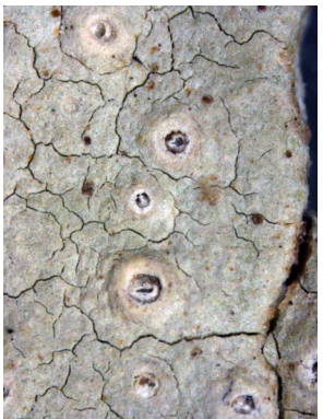
11 Thelotrema butsatronii