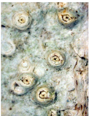
16 Thelotrema porinoides