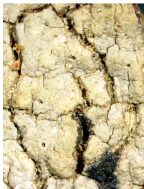
18 Thelotrema rugatulum