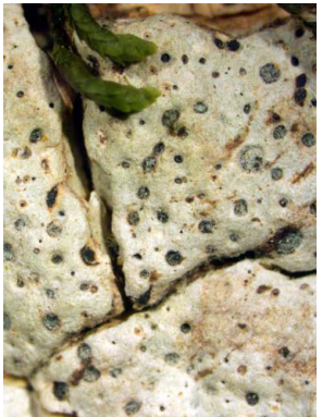
6 Melanotrema platystomum