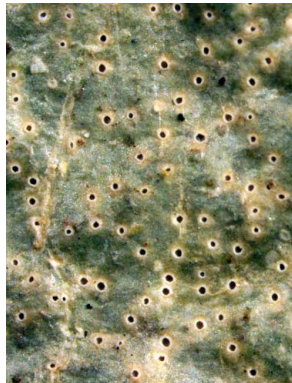
8 Myriotrema clandestinum