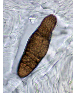
5 Leucodecton compunctum Muriform ascospore