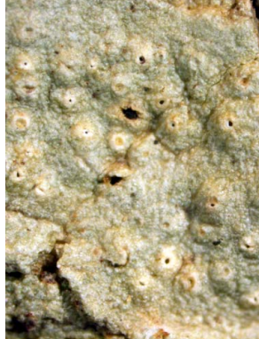
3 Leucodecton compunctum