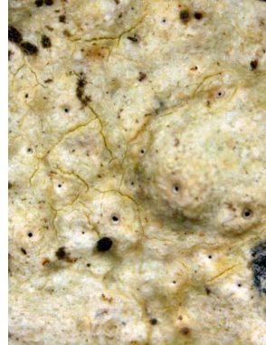
4 Leucodecton compunctum