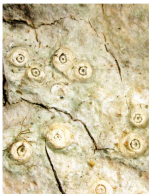
17 Thelotrema porinoides