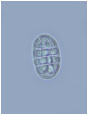
12 Thelotrema butsatronii Muriform ascospore