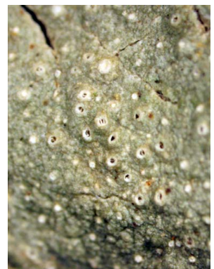
20 Thelotrema triseptatum