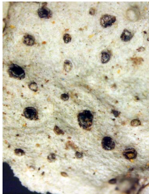
7 Melanotrema platystomum