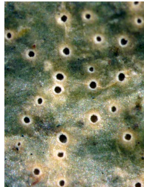
9 Myriotrema clandestinum