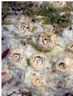
13 Thelotrema defossum