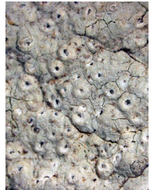
10 Thelotrema butsatronii