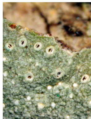
19 Thelotrema triseptatum