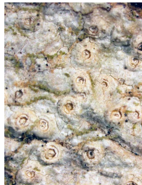
14 Thelotrema defossum