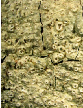
2 Glaucotrema glaucophaenum