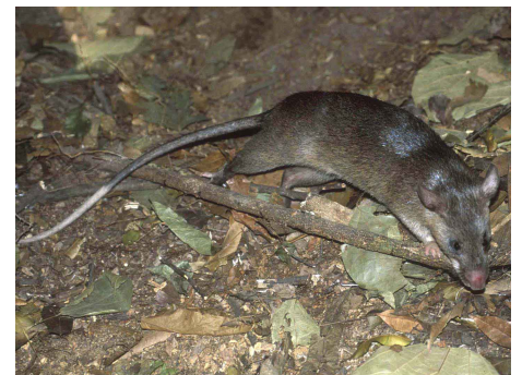
Cricetomys ansorgei Southern Giant Pouched Rat