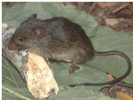
Oenomys hypoxanthus Common Oenomys