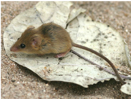
Dendromus mystacalis Chestnut African Climbing Mouse