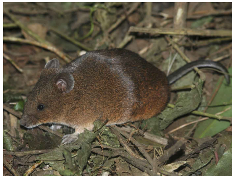
Lophuromys aquilus Dark-colored Brush-furred Rat