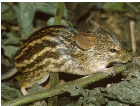
Lemniscomys striatus Typical Lemniscomys