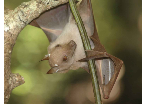
Epomophorus wahlbergi Wahlberg's Epauletted Fruit Bat