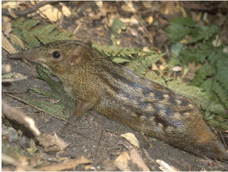
Rhynchocyon cirnei Checked Sengi