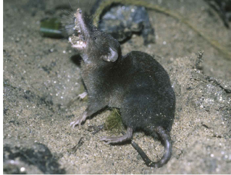
Crocidura olivieri African Giant Shrew