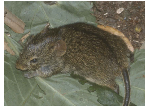
Lemniscomys rosalia Single-striped Lemniscomys