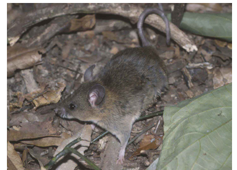
Praomys jacksoni Jackson's Praomys