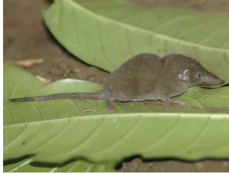
Crocidura hirta Lesser Red Musk Shrew