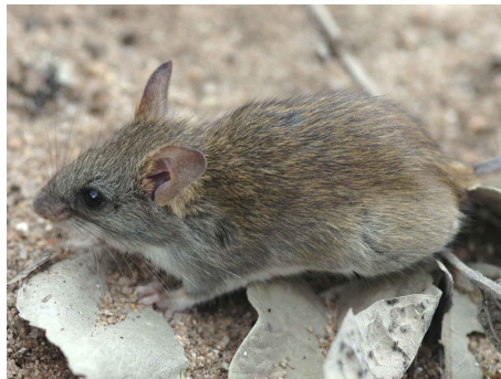
Grammomys dolichurus Common Grammomys