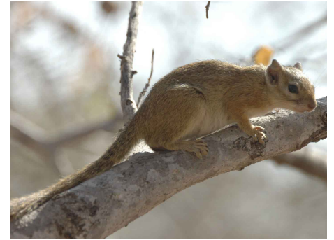
Paraxerus ochraceus Ochre Bush Squirrel