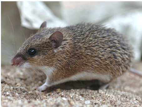
Acomys wilsoni Wilson's Spiny Mouse