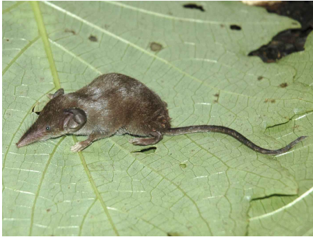
Crocidura hildegardeae Hildegarde's Shrew