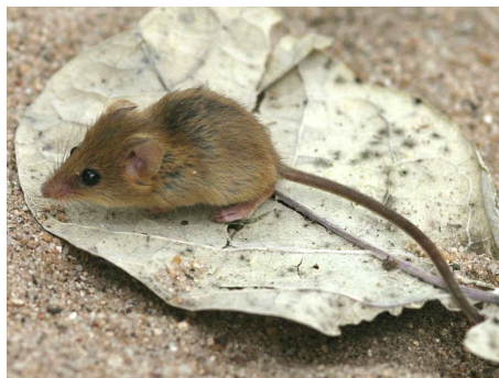
Dendromus mystacalis Chestnut African Climbing Mouse