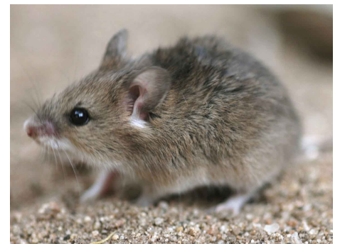
Steatomys parvus Tiny African Fat Mouse