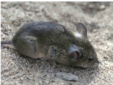
Mastomys pernanus Dwarf Mastomys