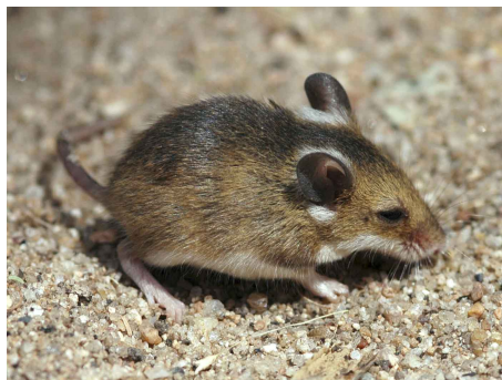
Mus tenellus Delicate Mouse