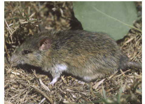
Mastomys natalensis Natal Mastomys