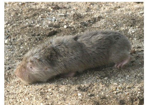
Cryptomys sp. Mole-rat