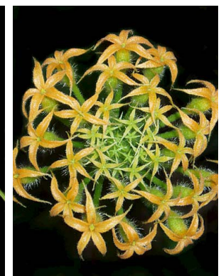
20 Gurania subumbellata staminate flowers