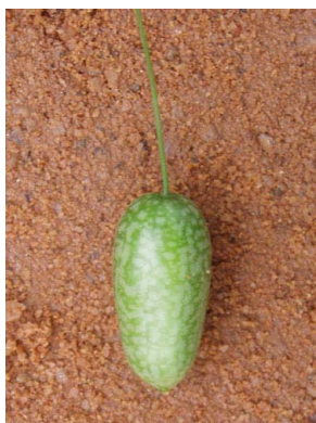
28 Melothria pendula fruit