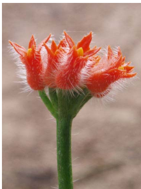
7 Gurania bignoniacea staminate flowers