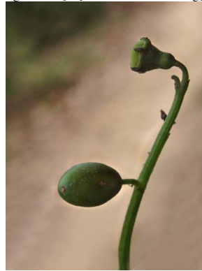
3 Cayaponia tayuya staminate bud and young fruit