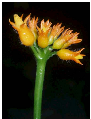
6 Gurania bignoniacea staminate flowers