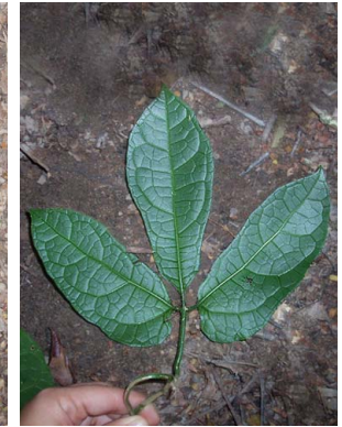
5 Gurania bignoniacea leaf