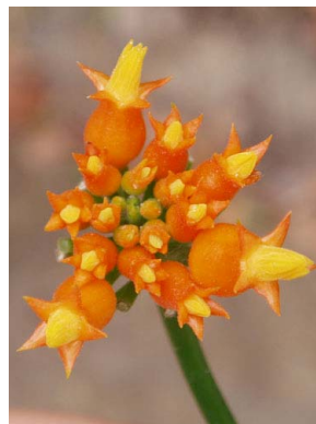
8 Gurania bignoniacea staminate flowers