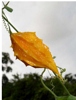
31 Momordica charantia young fruit