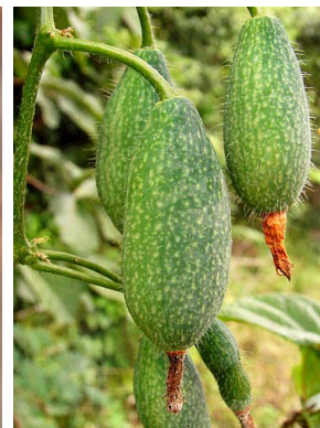
9 Gurania bignoniacea fruits