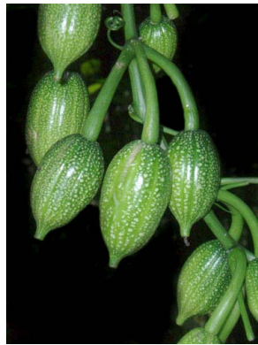
39 Psiguria triphylla fruits