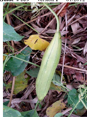
25 Luffa cylindrica fruit