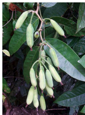
18 Gurania lobata fruits