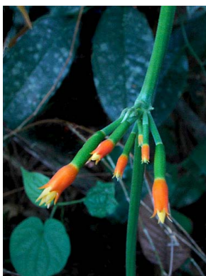
17 Gurania lobata pistillate flowers