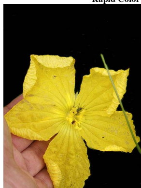
24 Luffa cylindrica staminate flower