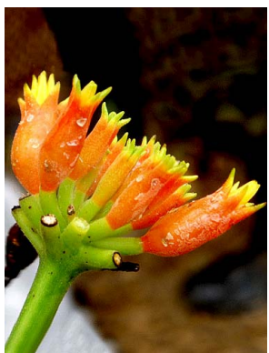
16 Gurania lobata staminate flowers