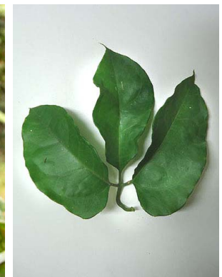
10 Gurania aff. bignoniacea leaf