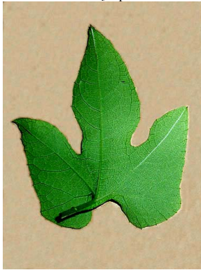
2 Cayaponia tayuya leaf