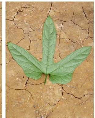
15 Gurania lobata leaf