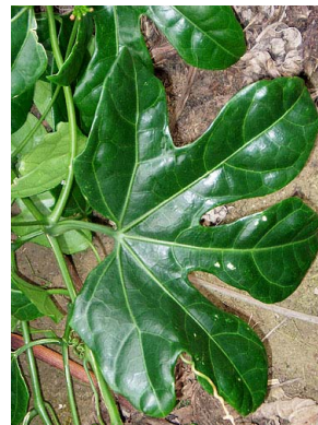
35 Psiguria triphylla leaf