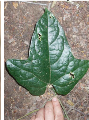
4 Gurania bignoniacea leaf