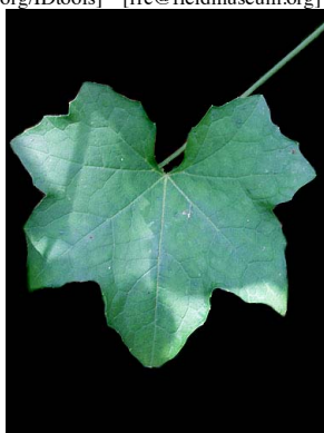
23 Luffa cylindrica leaf