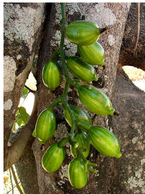
34 Psiguria ternata fruit