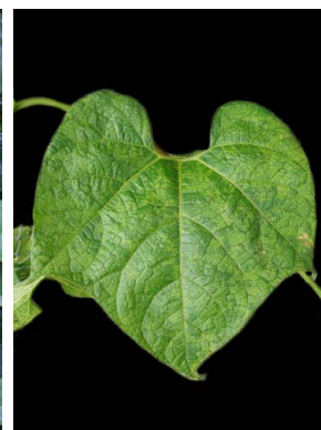
19 Gurania subumbellata leaf