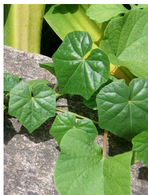
26 Melothria pendula habit