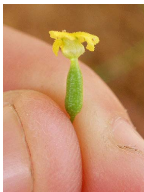
27 Melothria pendula pistillate flower