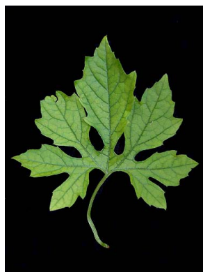
29 Momordica charantia leaf