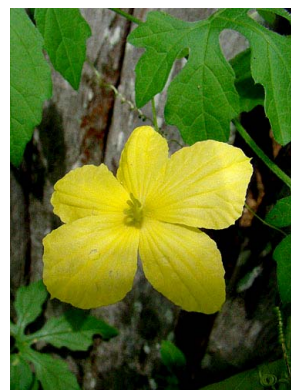
30 Momordica charantia staminate flower