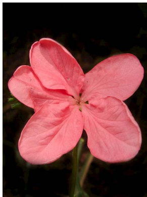
33 Psiguria ternata staminate flower