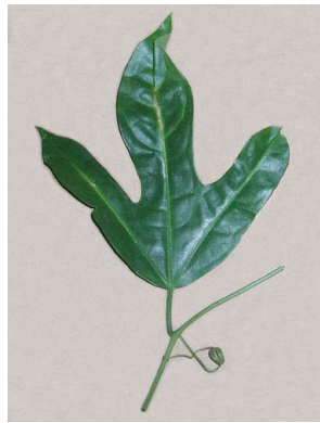
36 Psiguria triphylla leaf