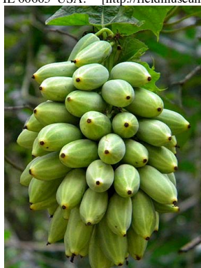
22 Gurania subumbellata fruits