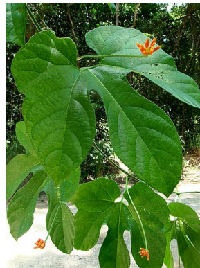
13 Gurania lobata habit