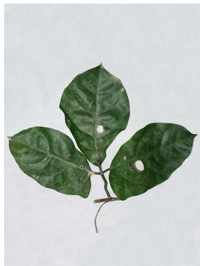
32 Psiguria ternata leaf