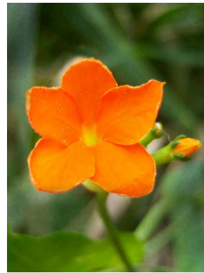
40 Psiguria umbrosa staminate flower