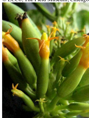
21 Gurania subumbellata pistillate flowers

Rapid Color Guide # 339 version 1 01/2012