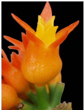
11 Gurania aff. bignoniacea staminate flower