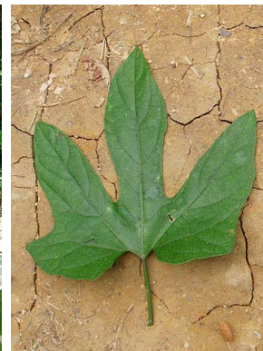
14 Gurania lobata leaf