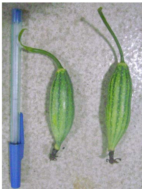
12 Gurania aff. bignoniacea fruits