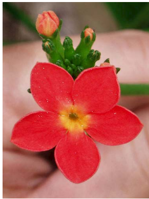
38 Psiguria triphylla staminate flower