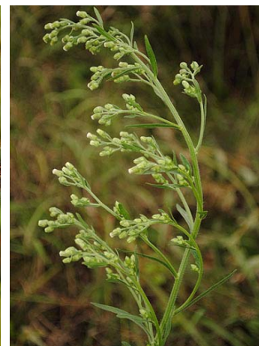
19 Conyza bonariensis ASTERACEAE