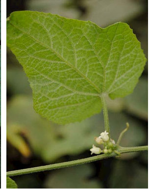
45 Zehneria scabra CUCURBITACEAE