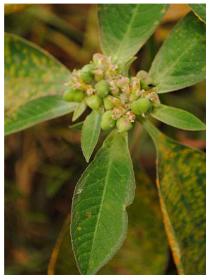
52 Euphorbia heterophylla EUPHORBIACEAE