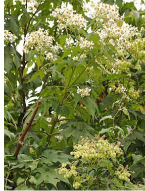
23 Montanoa hibiscifolia ASTERACEAE