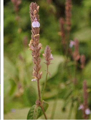
4 Justicia nyassana ACANTHACEAE