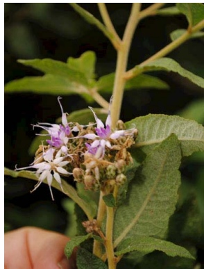
27 Vernonia adoensis ASTERACEAE