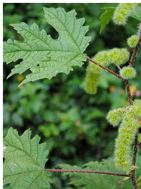
77 Girardinia diversifolia URTICACEAE