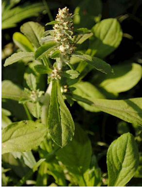
21 Gamochaeta purpurea ASTERACEAE

Rapid Color Guide # 331 version 1 02/2012