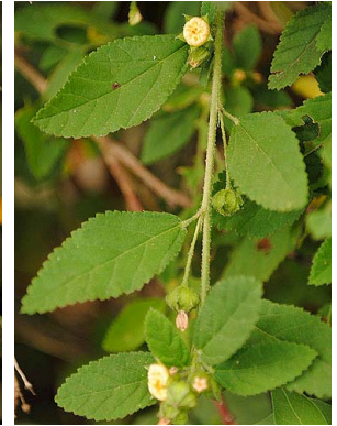
65 Sida alba MALVACEAE