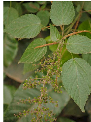
49 Acalypha racemosa EUPHORBIACEAE