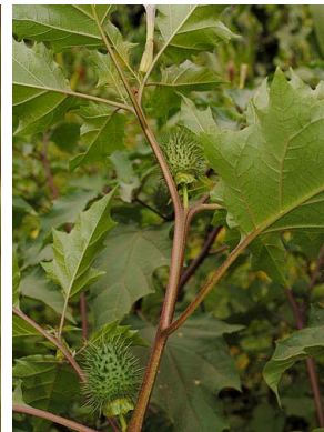
69 Datura stramonium SOLANACEAE