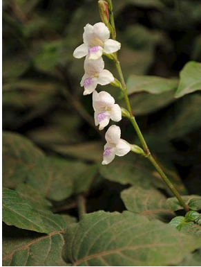
1 Asystasia gangetica ACANTHACEAE

Rapid Color Guide # 331 version 1 02/2012