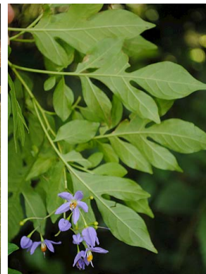
74 Solanum seaforthianum SOLANACEAE