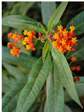
12 Asclepias curassavica APOCYNACEAE