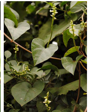
30 Basella alba BASELLACEAE