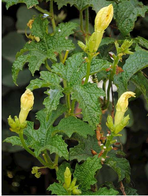
41 Peponium vogelii CUCURBITACEAE

Rapid Color Guide # 331 version 1 02/2012