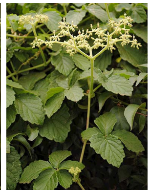
80 Cyphostemma cyphopetalum VITACEAE