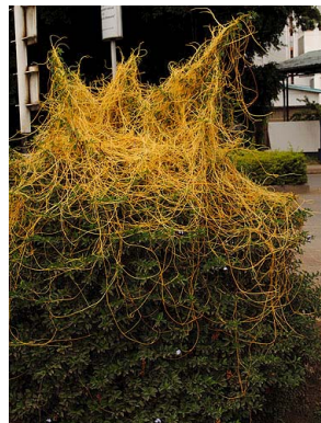
33 Cuscuta kilimanjari CONVOLVULACEAE