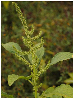
11 Amaranthus hybridus AMARANTHACEAE