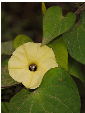
36 Ipomoea obscura CONVOLVULACEAE