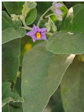
72 Solanum incanum SOLANACEAE