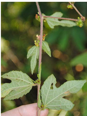
76 Triumfetta rhomboidea TILIACEAE