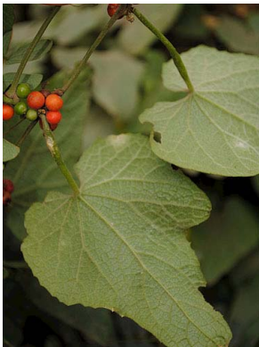
46 Zehneria scabra CUCURBITACEAE