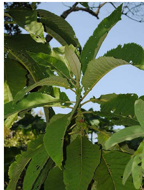
28 Vernonia auriculifera ASTERACEAE