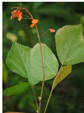
58 Desmodium repandum FABACEAE-PAPIL.