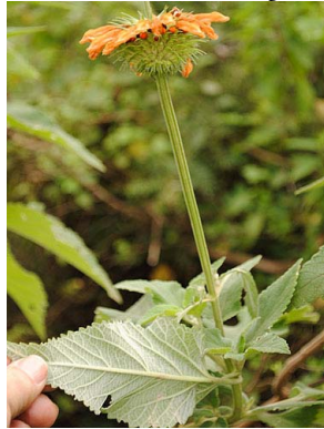
62 Leonotis nepetifolia LAMIACEAE