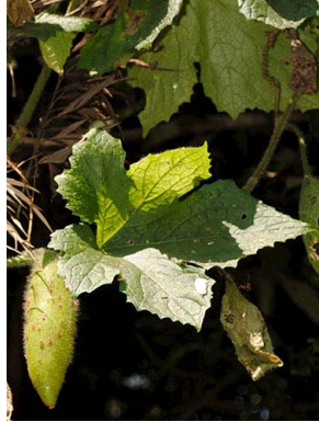
42 Peponium vogelii CUCURBITACEAE