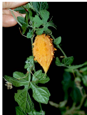
38 Momordica charantia CUCURBITACEAE