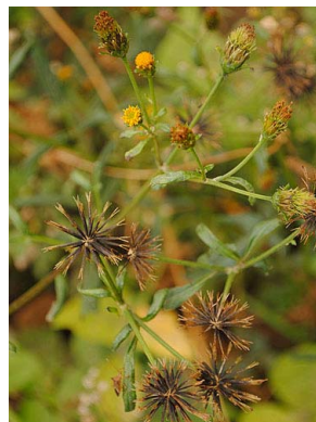
18 Bidens schimperi ASTERACEAE