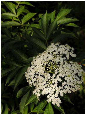
6 Sambucus africana ADOXACEAE