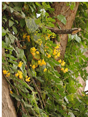
57 Senna bicapsularis FABACEAE-CAESALP.