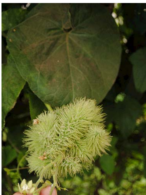
16 Pergularia daemia APOCYNACEAE