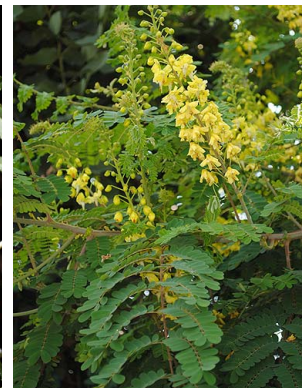
55 Caesalpinia decapetala FABACEAE-CAESALP.