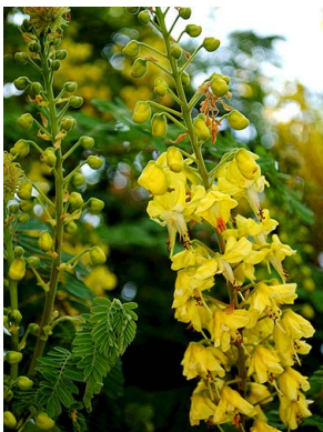
56 Caesalpinia decapetala FABACEAE-CAESALP.