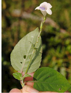
2 Asystasia gangetica ACANTHACEAE