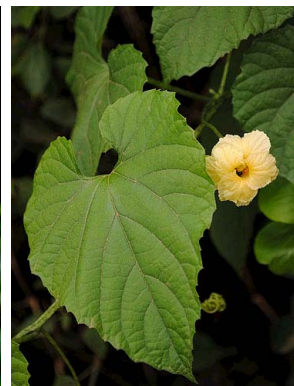
39 Momordica foetida CUCURBITACEAE