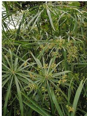
47 Cyperus involucratus CYPERACEAE