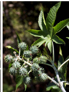
54 Ricinus communis EUPHORBIACEAE