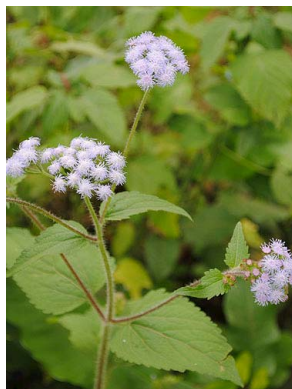
17 Ageratum conyzoides ASTERACEAE