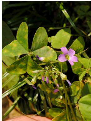
67 Oxalis latifolia OXALIDACEAE