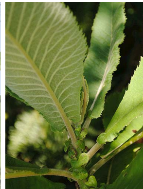
29 Vernonia auriculifera ASTERACEAE