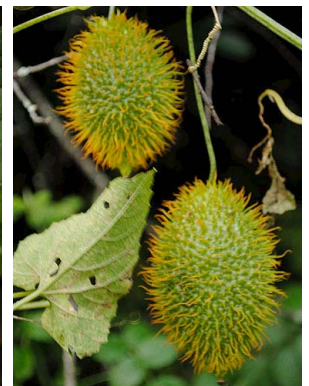
40 Momordica foetida CUCURBITACEAE