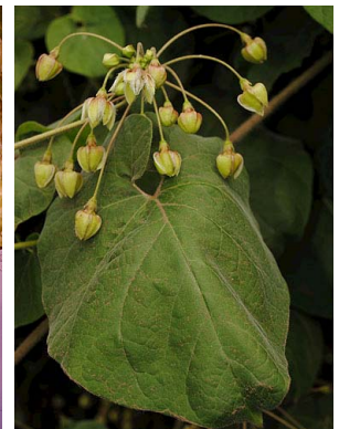
15 Pergularia daemia APOCYNACEAE