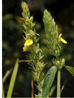
3 Justicia flava ACANTHACEAE