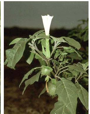
70 Datura stramonium SOLANACEAE