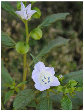
71 Nicandra physaloides SOLANACEAE