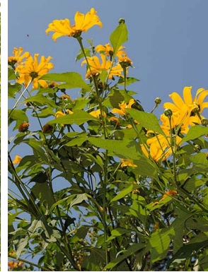
24 Tithonia diversifolia ASTERACEAE