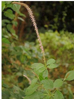
7 Achyranthes aspera AMARANTHACEAE