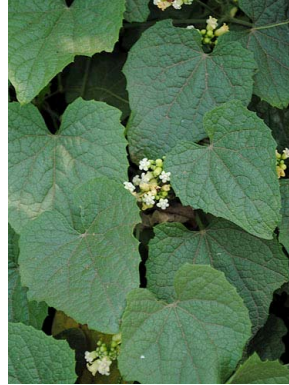
43 Zehneria scabra CUCURBITACEAE