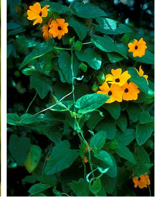
5 Thunbergia alata ACANTHACEAE