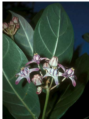
13 Calotropis gigantea APOCYNACEAE