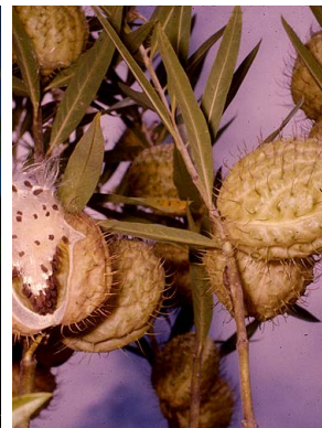
14 Gomphocarpus physocarpus APOCYNACEAE