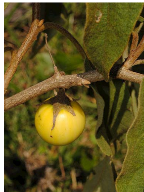
73 Solanum incanum SOLANACEAE