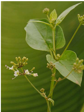
66 Commicarpus plumbagineus NYCTAGINACEAE