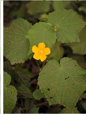
64 Pavonia patens MALVACEAE