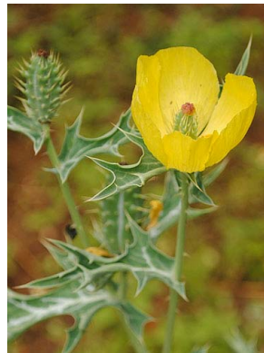
68 Argemone mexicana PAPAVERACEAE