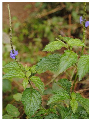
78 Stachytarpheta cayennensis VERBENACEAE