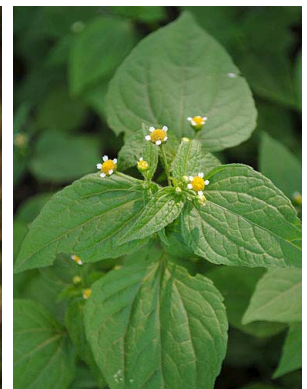
20 Galinsoga parviflora ASTERACEAE