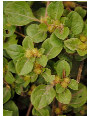
9 Alternanthera pungens AMARANTHACEAE