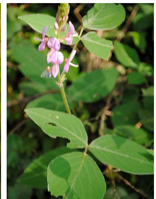
60 Desmodium intortum FABACEAE-PAPIL.