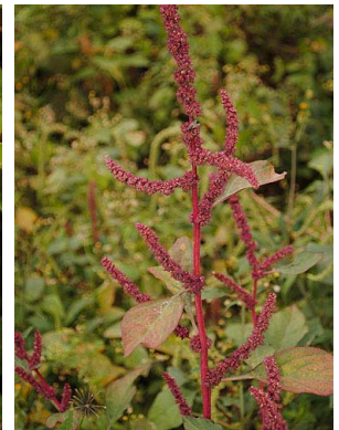
10 Amaranthus hybridus AMARANTHACEAE