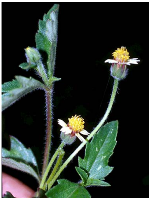
26 Tridax procumbens ASTERACEAE