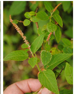
50 Acalypha racemosa EUPHORBIACEAE