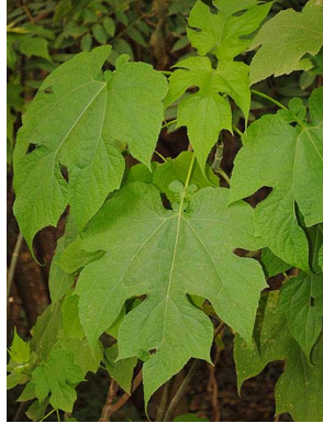
22 Montanoa hibiscifolia ASTERACEAE