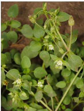
31 Stellaria media CARYOPHYLLACEAE