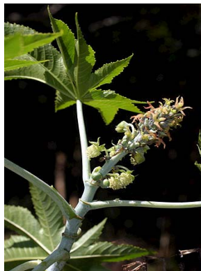
53 Ricinus communis EUPHORBIACEAE