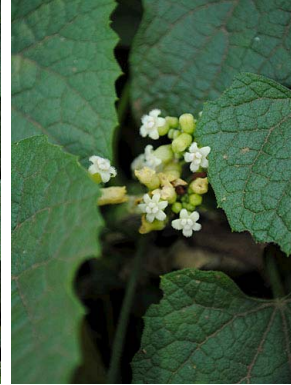
44 Zehneria scabra CUCURBITACEAE