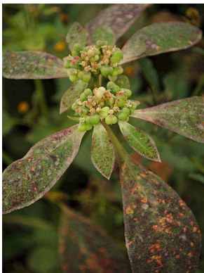
51 Euphorbia heterophylla EUPHORBIACEAE