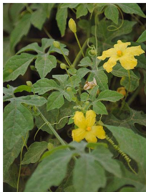
37 Momordica charantia CUCURBITACEAE