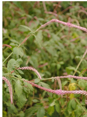
8 Achyranthes aspera AMARANTHACEAE