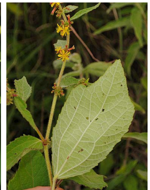
75 Triumfetta rhomboidea TILIACEAE