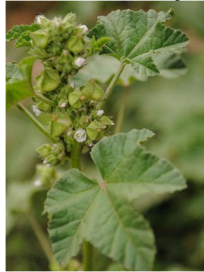
63 Malva verticillata MALVACEAE