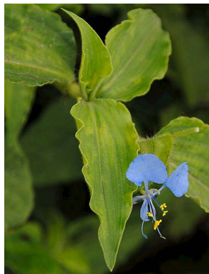
32 Commelina benghalensis COMMELINACEAE