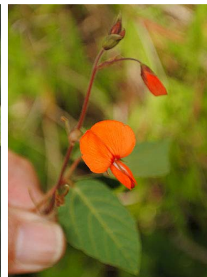
59 Desmodium repandum FABACEAE-PAPIL.