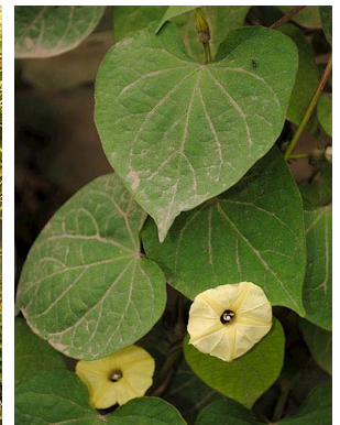
35 Ipomoea obscura CONVOLVULACEAE