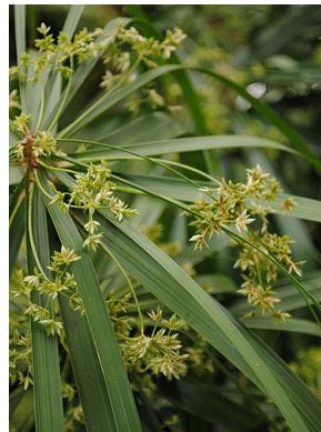
48 Cyperus involucratus CYPERACEAE