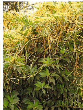
34 Cuscuta kilimanjari CONVOLVULACEAE