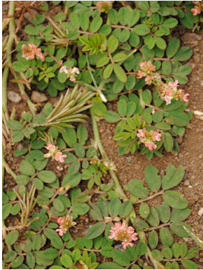
61 Indigofera spicata FABACEAE-PAPIL.

Rapid Color Guide # 331 version 1 02/2012