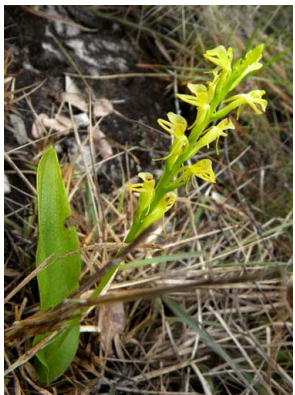
27 Liparis loeselii