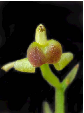
29 Liparis nervosa