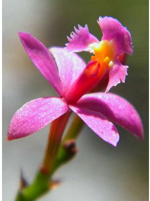
22 Epidendrum secundum