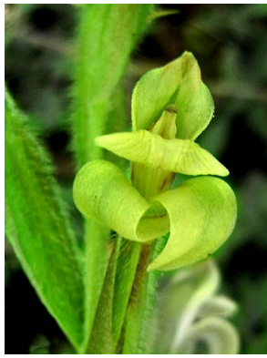
35 Sarcoglottis acaulis