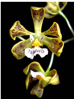
13 Encyclia oncioides