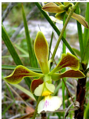
14 Encyclia patens