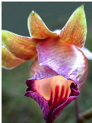
26 Galeandra montana