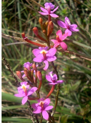
21 Epidendrum secundum