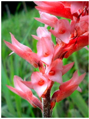
34 Sacoila lanceolata