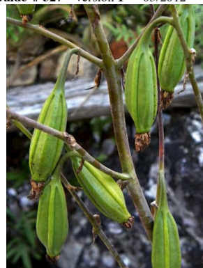
5 Cyrtopodium flavum