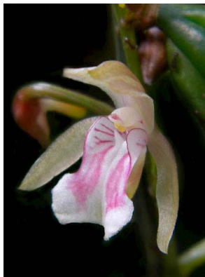
30 Oeceoclades maculata