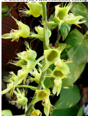
1 Catasetum discolor