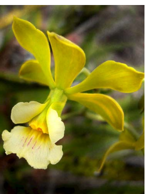
9 Encyclia alboxanthina D.S Melo