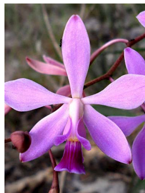
11 Encyclia dichroma