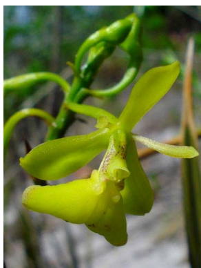
19 Epidendrum orchidiflorum