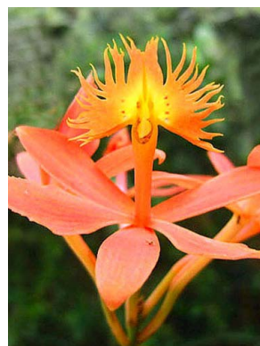
16 Epidendrum cinnabarinum