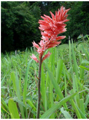
33 Sacoila lanceolata