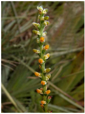
32 Prescottia plantaginea W.J. Machado