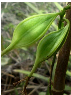
18 Epidendrum cinnabarinum