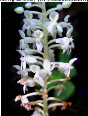
3 Cranichis candida