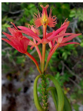
17 Epidendrum cinnabarinum