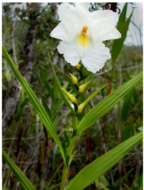
37 Sobralia liliastrum D.S. Melo