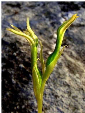
40 Veyretia rupicola