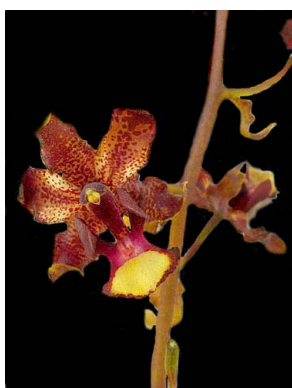
7 Cyrtopodium parviflorum