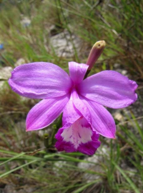
24 Epistephium lucidum