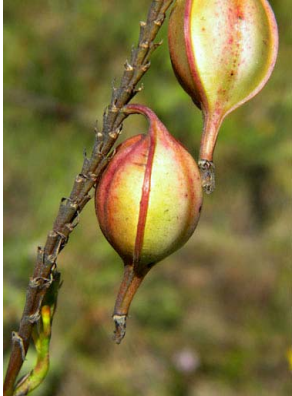
23 Epidendrum secundum