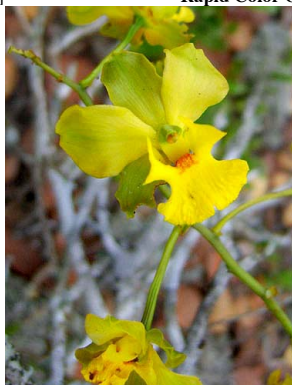
4 Cyrtopodium flavum