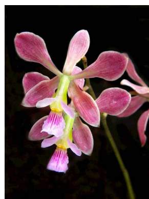
10 Encyclia dichroma