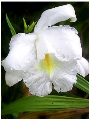
38 Sobralia liliastrum