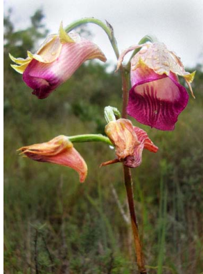
25 Galeandra montana D.S. Melo