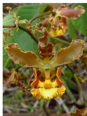
6 Cyrtopodium holstii