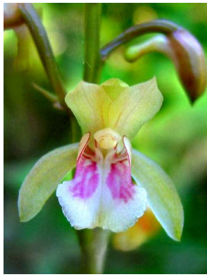
31 Oeceoclades maculata