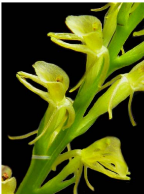
28 Liparis loeselii