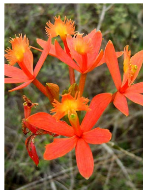
15 Epidendrum cinnabarinum