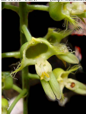
2 Catasetum discolor D.S Melo