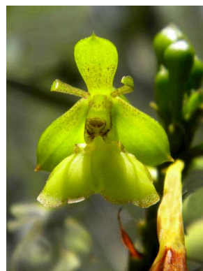
20 Epidendrum orchidiflorum