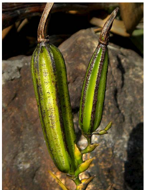
39 Sobralia liliastrum