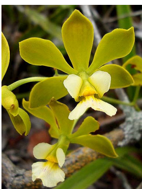
8 Encyclia alboxanthina