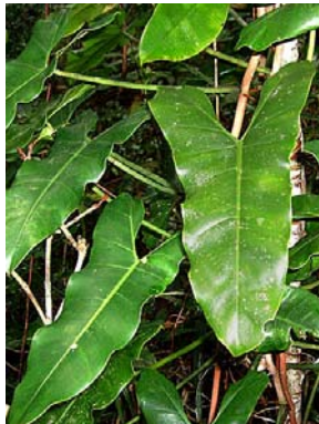
17 Philodendron acutatum hemiepiphyte