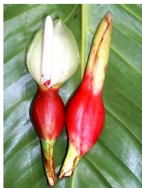
25 Philodendron fragrantissimum inflorescence