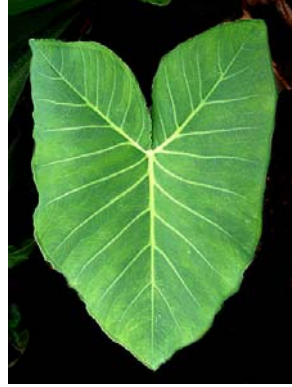
39 Xanthosoma sagittifolium geophyte