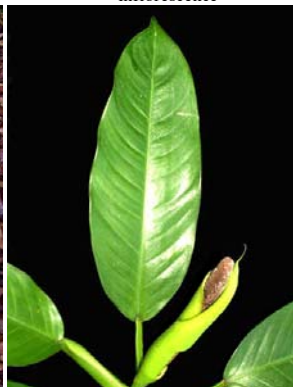
32 Philodendron rudgeanum hemiepiphyte – leaf and inflorescence