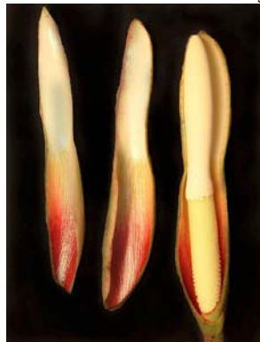
20 Philodendron bipennifolium inflorescence

Rapid Color Guide # 268 versão 1 05/2010