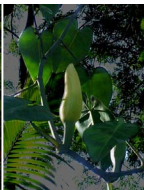
27 Philodendron hederaceum inflorescence