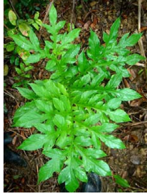
35 Taccarum ulei geophyte