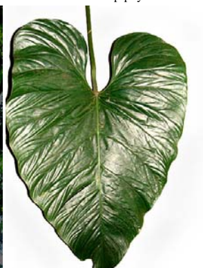
28 Philodendron ornatum hemiepiphyte