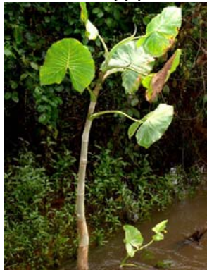
15 Montrichardia linifera heliophyte