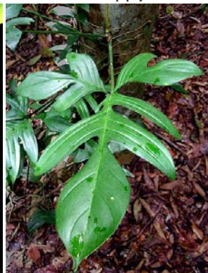
31 Philodendron pedatum hemiepiphyte