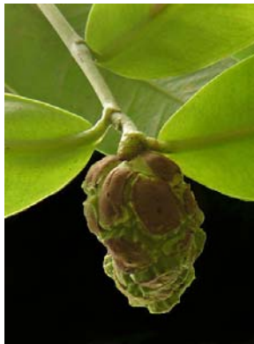
12 Heteropsis oblongifolia infructescence