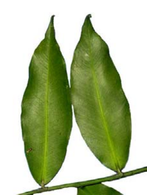
10 Heteropsis oblongifolia hemiepiphyte