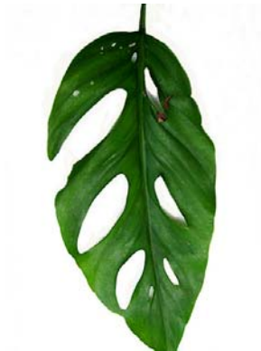
13 Monstera adansonii hemiepiphyte