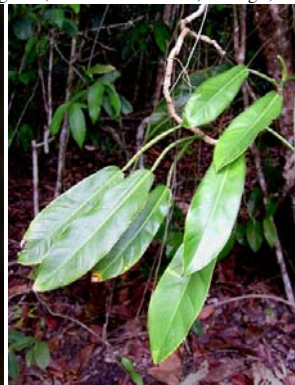
21 Philodendron blanchetianum hemiepiphyte