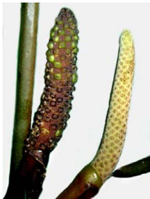
5 Anthurium pentaphyllum infructescence and inflorescence