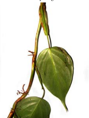
29 Philodendron ornatum young leaf