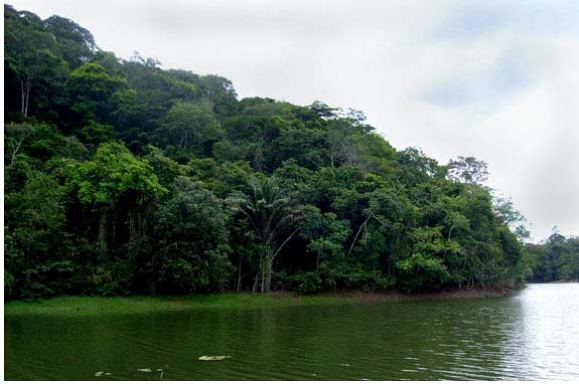
1 Vista da RPPN de Piedade, pertencente à Usina São José