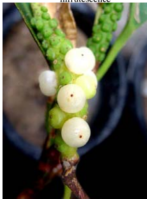
8 Anthurium scandens infructescence