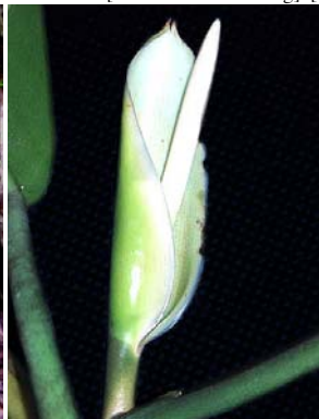
22 Philodendron blanchetianum inflorescence