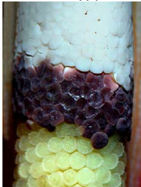
18 Philodendron acutatum male, sterile male, & female flowers