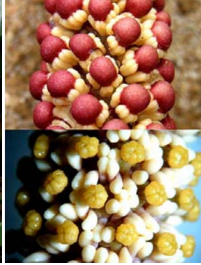
37 Taccarum ulei male and female flowers