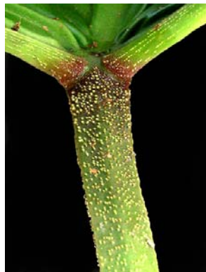
30 Philodendron ornatum petiole with warty papillae