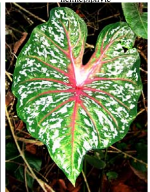
9 Caladium bicolor geophyte