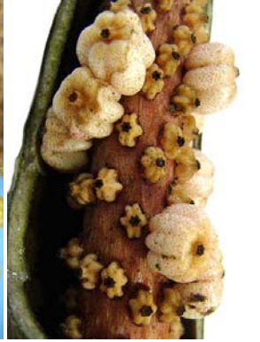
38 Taccarum ulei fruits