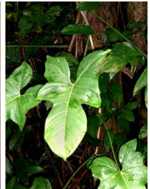
19 Philodendron bipennifolium hemiepiphyte