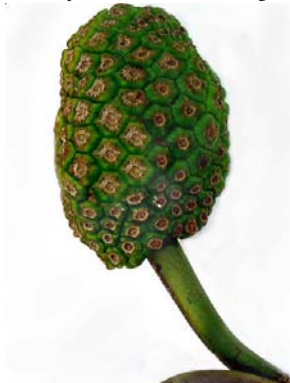
16 Montrichardia linifera infructescence