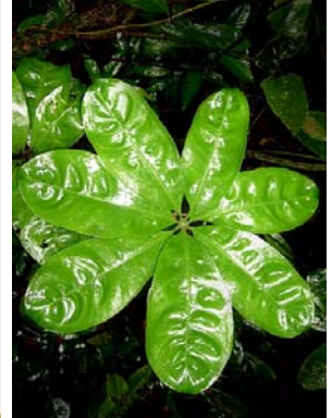
4 Anthurium pentaphyllum hemiepiphyte