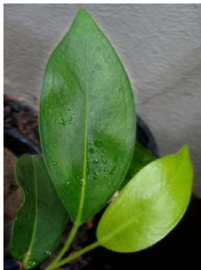
6 Anthurium scandens epiphyte