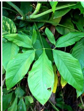
33 Syngonium podophyllum hemiepiphyte