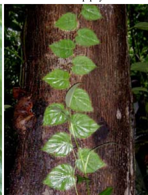
26 Philodendron hederaceum hemiepiphyte