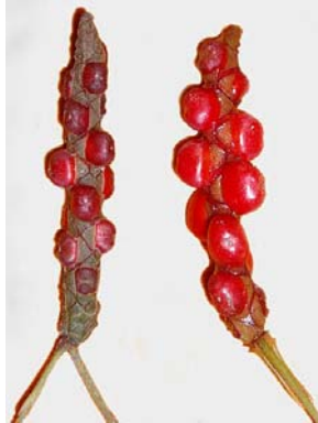
3 Anthurium gracile infructescence