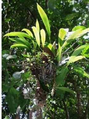
2 Anthurium gracile epiphyte