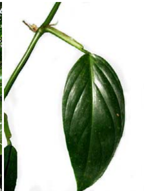
24 Philodendron fragrantissimum young leaf