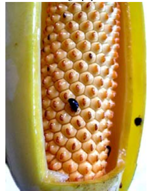
14 Monstera adansonii inflorescence