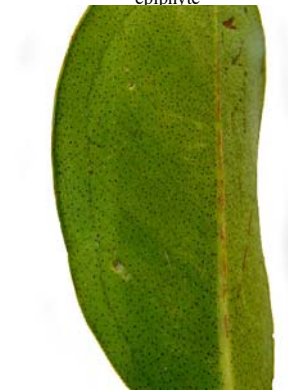
7 Anthurium scandens black dots on abaxial leaf surface