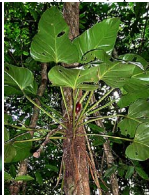
23 Philodendron fragrantissimum hemiepiphyte