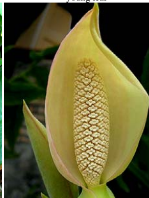
34 Syngonium podophyllum Inflorescence/male flowers