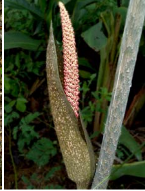
36 Taccarum ulei inflorescence