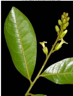
31 Diclidanthera laurifolia POLYGALACEAE