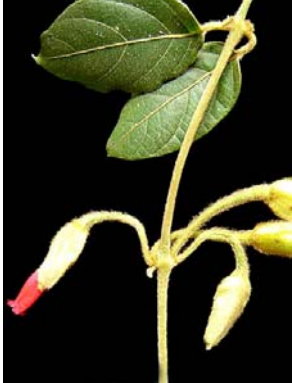
1 Mendoncia sp. ACANTHACEAE

Rapid Color Guide # 267 version 1 07/2010