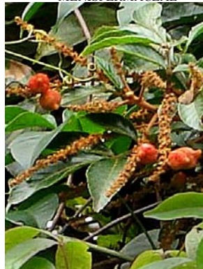
33 Paullinia seminuda SAPINDACEAE