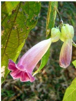
12 Stizophyllum perforatum BIGNONIACEAE