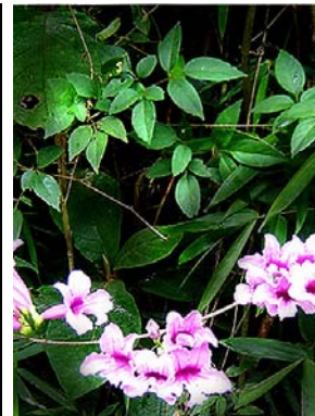
9 Mansoa difficilis BIGNONIACEAE