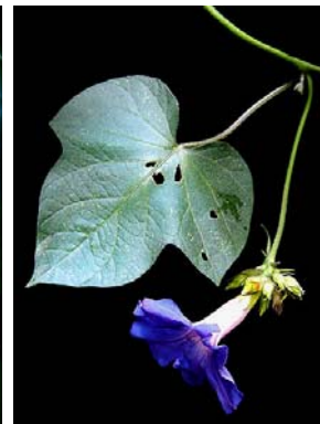
14 Ipomoea indica CONVOLVULACEAE