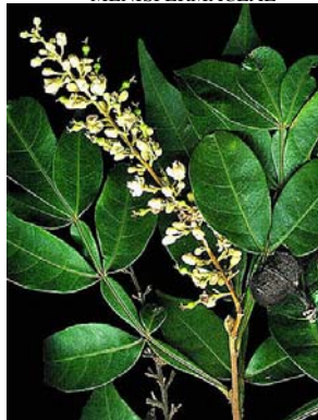
32 Paullinia carpopoda SAPINDACEAE