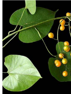
29 Odontocarya acuparata ASTERACEAE