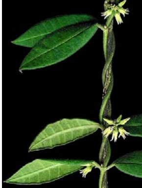
2 Ditassa tomentosa APOCYNACEAE