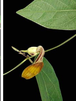
4 Aristolochia melastoma ARISTOLOCHIACEAE