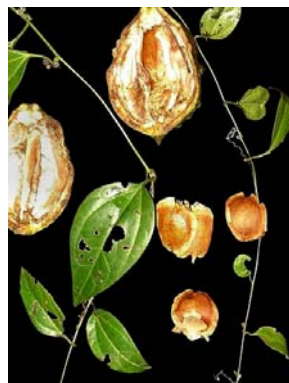
18 Fevillea passiflora