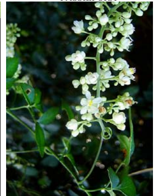
35 Serjania reticulata SAPINDACEAE