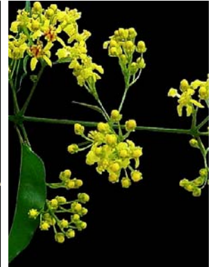
25 Heteropterys intermedia MALPIGHIACEAE