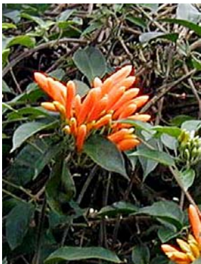
11 Pyrostegia venusta BIGNONIACEAE