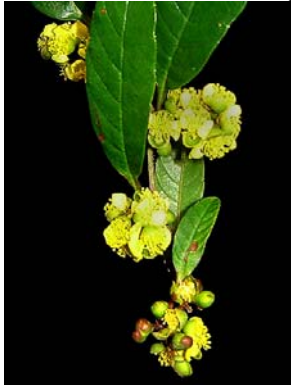
21 Davilla rugosa DILLENIACEAE

© Environmental & Conservation Programs, The Field Museum, Chicago, IL USA [rc@fieldmuseum.org] [http://www.fnmh.org/plantguides/] Rapid Color Guide # 267 version 1 07/2010