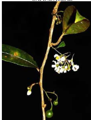
37 Solanum inodorum SOLANACEAE