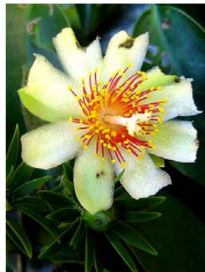
13 Pereskia aculeata CACTACEAE