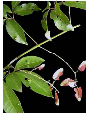
34 Serjania lethalis SAPINDACEAE