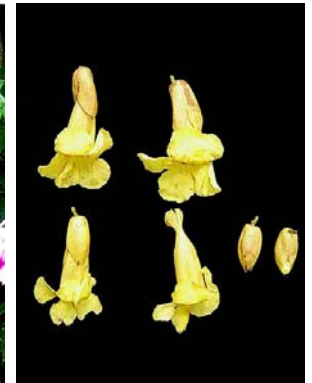
10 Melloa quadrivalvis BIGNONIACEAE