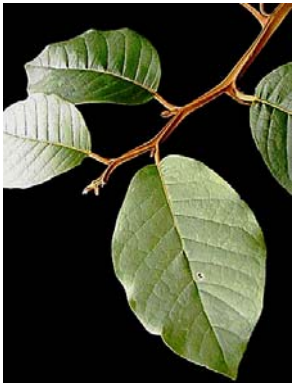
6 Piptocarpha quadrangularis ASTERACEAE