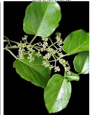
40 Cissus verticillata VITACEAE