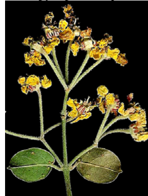
24 Banisteriopsis adenopoda MALPIGHIACEAE