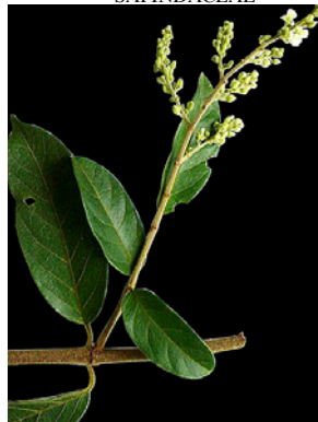
38 Trigonía paniculata TRIGONIACEAE