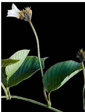
17 Odonellia eriocentra