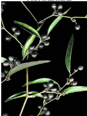
36 Smilax elastica SMILACACEAE