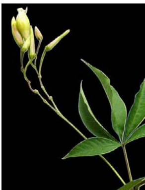
16 Merremia macrocalyx