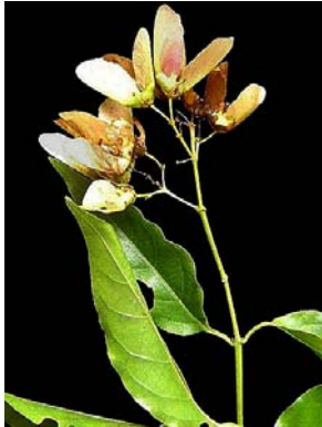
26 Tetrapteryx mucronata MALPIGHIACEAE