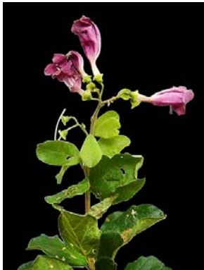
7 Arrabidaea samyoides BIGNONIACEAE