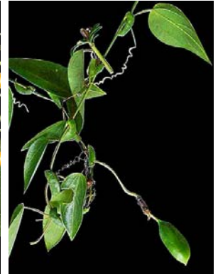
30 Passiflora miersii PASSIFLORA