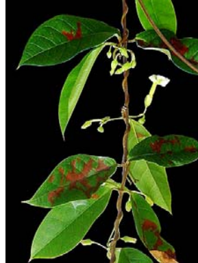
3 Secondatia densiflora APOCYNACEAE