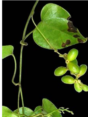
28 Disciphania modesta MENISPERMACEAE