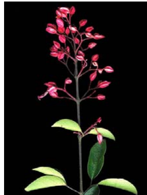
8 Fridericia speciosa BIGNONIACEAE