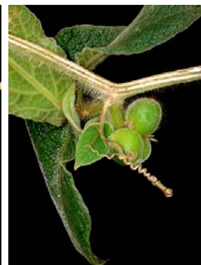
19 Cavanonia villosicima