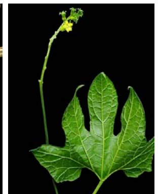
20 Wilbrandia verticillata