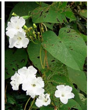
15 Ipomoea saopaulista CONVOLVULACEAE