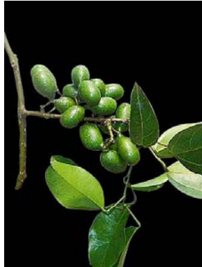
27 Abuta selloana MENISPERMACEAE