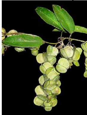
22 Dioscorea oifersiana DIOSCOREACEAE