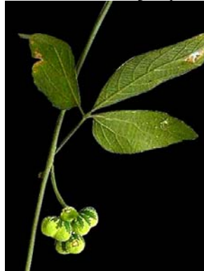
23 Dalechampia triphylla EUPHORBIACEAE