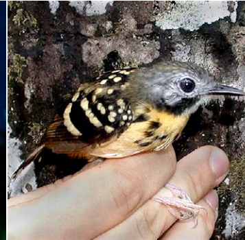
99 Hylophylax naevius Ad ♀ PH