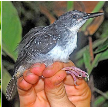
83 Sclateria naevia argentata Ad ♂ JAT