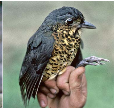
110 Grallaria squamigera canicauda Ad RW