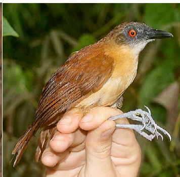
91 Myrmeciza goeldii Ad ♀