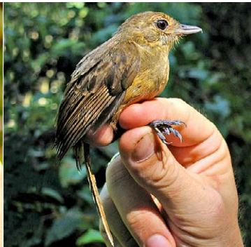
32 Thamnomanes caesius perimilis Imm ♀ JAT