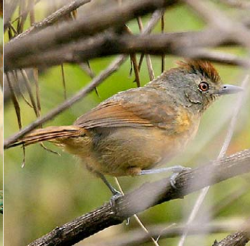
8 Thamnophilus ruficapillus marcapatae Ad ♀ JAT