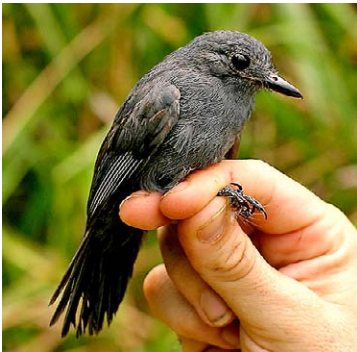
32 Thamnomanes caesius persimilis Ad ♂ JAT