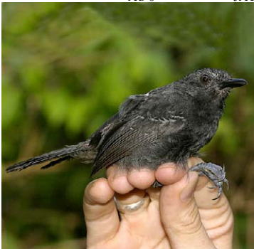
72 Cercomacra serva Ad ♂ JAT