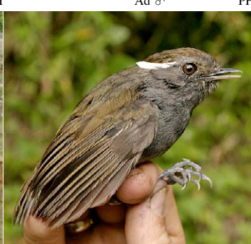
132 Conopophaga ardesiaca Ad ♂ JAT