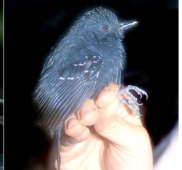
29 Dysithamnus occidentalis Ad ♂ DFL