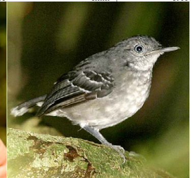
81 Hypocnemoides melanopogon Ad ♀ AG