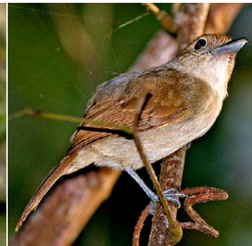
16 Thamnophilus murinus murinus Ad ♀ JAT