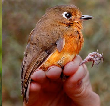
128 Grallaricula ferruginepectus leymebambae Ad JJ