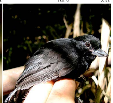
27 Neotantes niger Ad ♂ DL