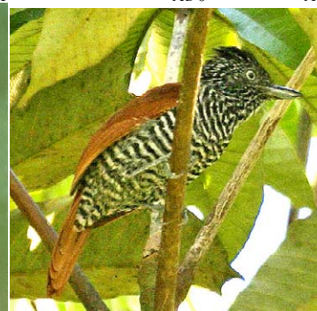
12 Thamnophilus palliatus Ad ♂ JAT