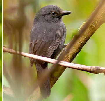
22 Thamnophilus unicolor Ad ♂ SO