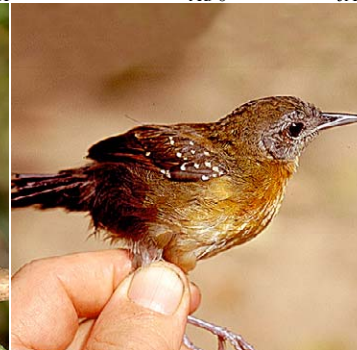
90 Myrmeciza atrothorax melanura Ad ♀ JH