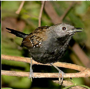
90 Myrmeciza atrothorax melanura Ad ♂ JAT