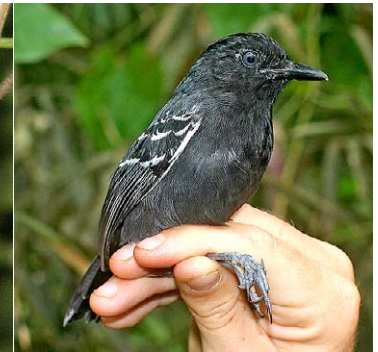
84 Percnostola lophotes Ad ♂ JAT