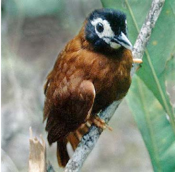
96 Pithys castanea Ad

[RRC@fmnh.org] | www.fmnh.org/animalguides/ | Rapid Color Guide #256 version 1, 9/2009