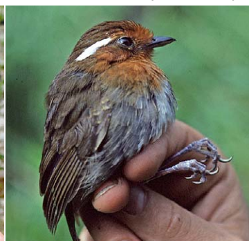
131 Conopophaga castaneiceps chapmani Juv ♂ JAT