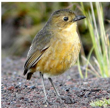
121 Grallaria quitensis Ad SB