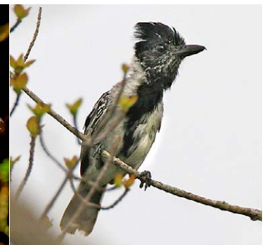
6 Sakesphorus canadensis Ad ♂ JAT