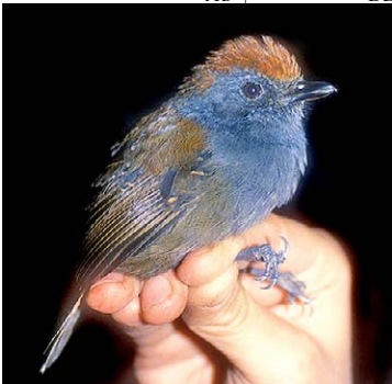
29 Dysithamnus occidentalis Ad ♀ DFL