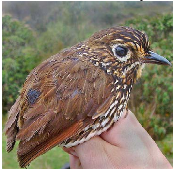
113 Grallaria andicola Ad

[RRC@fmnh.org] | www.fmnh.org/animalguides/ | Rapid Color Guide #256 version 1, 11/2009