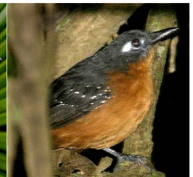
92 Myrmeciza hyperythra Ad ♀