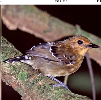
101 Willisornis poecilinotus lepidonota Ad ♀