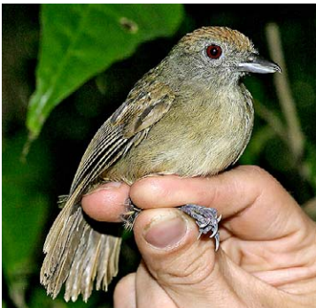
15 Thamnophilus schistaceus Ad ♀ JAT