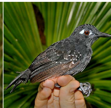
92 Myrmeciza hyperythra Ad ♂