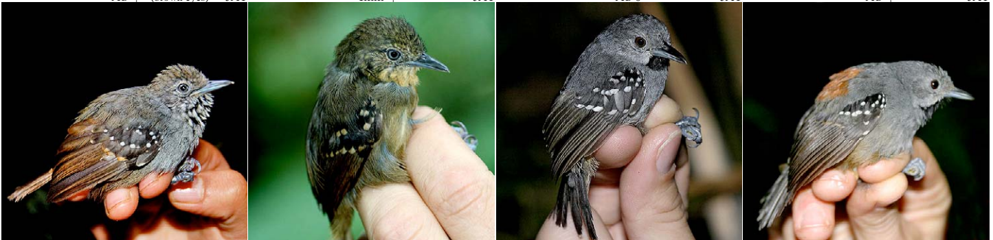
37 Epinecrophylla spodionota sororia Ad ♂ JJ 37 Epinecrophylla spodionota sororia Ad ♀ ZP 38 Epinecrophylla ornata meridionalis Ad ♂ (grey back) JAT 38 Epinecrophylla ornata meridionalis Ad ♂ (rufous back) CM