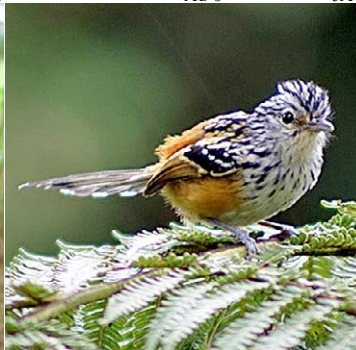
63 Drymophila caudata Ad ♂ DB