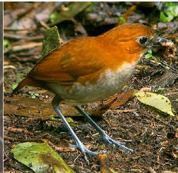
117 Grallaria hypoleuca Ad NA