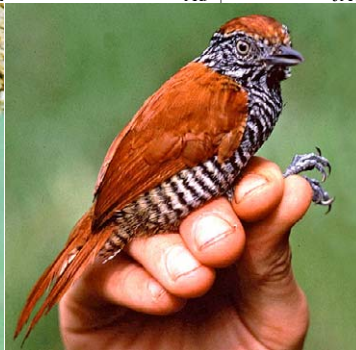
11 Thamnophilus tenuepunctatus Ad ♀ RW