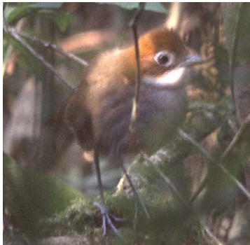
116 Grallaria albigula Ad JAT