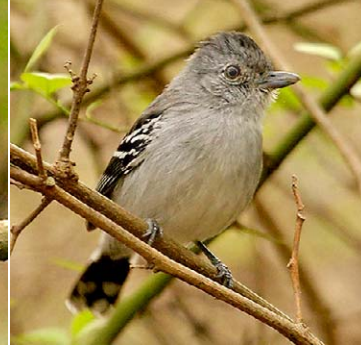
20 Thamnophilus sticturus Ad ♂ JAT