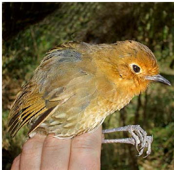
119 Grallaria (rufula) cajamarcae Ad FAP