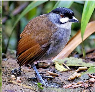
114 Grallaria ridgelyi Ad DB