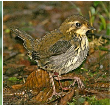
108 Chamaeza campanisona boliviana Ad