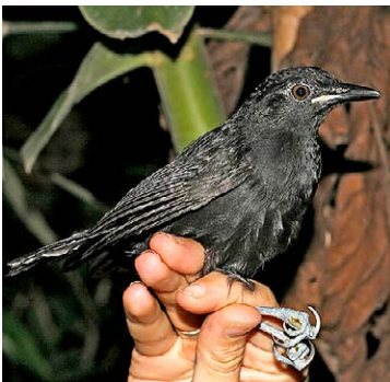
91 Myrmeciza goeldii Imm ♂ JAT