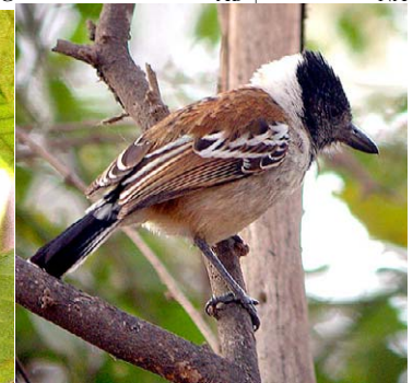
13 Thamnophilus bernardi Ad ♂ NA