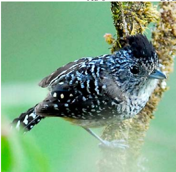
10 Thamnophilus zarumae Ad ♂ PN