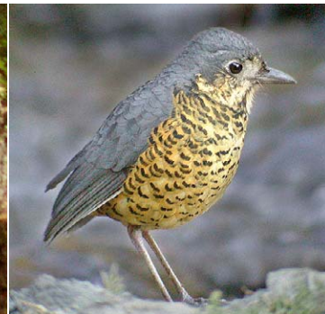
110 Grallaria squamigera squamigera Ad WH