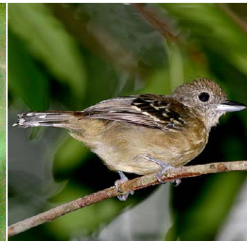
14 Thamnophilus atrinucha Ad ♀ JAT