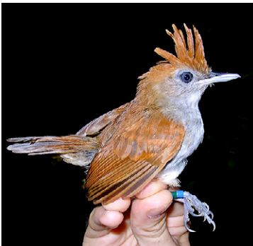
84 Percnostola lophotes Ad ♀ JAT