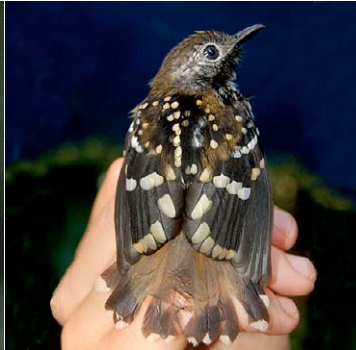
99 Hylophylax naevius Ad ♂ JJ