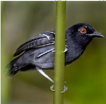
79 Myrmoborus melanurus Ad ♂ RS