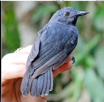
30 Thamnomanes ardesiacus ardesiacus Ad ♀ DFL