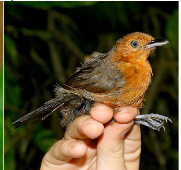
71 Cercomacra nigrescens fuscicauda Ad ♀ JAT