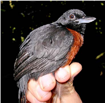
27 Neotantes niger Ad ♀

Photos by Roger Ahlman (RA), Mike Andersen (MA), Nick Athanas (NA), Steve Blain (SB), Dušan Brinkhuizen (DB) Rosalbina Butron (RB), Iain Campbell (IC), Bertrando Campos (BC), J. Chavez (JC), Arthur Grosset (AG), Wim Heylen (WH), Jon Hornbuckle (JH), Peter Hosner (PH), Caroline Isaksson (CI), Jill Jankowski (JJ), Philip Koch (PK), Daniel F. Lane, Daniel Lebbin (DL), Huw Lloyd (HL), Chris Merkord (CM), Paul Noakes (PN), Scott Olmstead (SO), Chris Perrins (CP), Zacharia Peterson (ZP), Fernando Angulo Pratulongo (FAP), Robert Scanlon (RS), Ryan Shaw (RSh), Joseph A. Tobias (JAT), Wendy Tori (WT), Ursula Valdez (UV), Thomas Valqui (TV), Rob Williams (RW), Kevin Zimmer (KZ). © Environmental & Conservation Programs, The Field Museum, Chicago, IL 60605 USA. [RRC@fmnh.org] | www.fmnh.org/animalguides/ | Rapid Color Guide #256 version 1, 11/2009