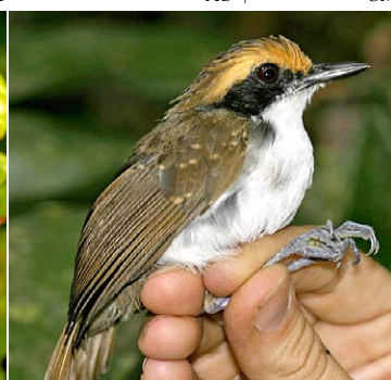
76 Myrmoborus leucophrys Ad ♀ JAT