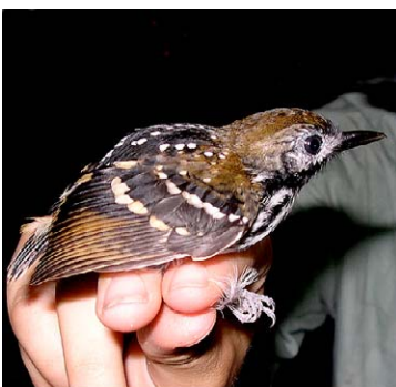
100 Hylophylax punctulata Ad ♂ DL