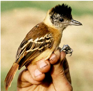
13 Thamnophilus bernardi Ad ♀ RW