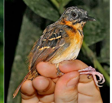
89 Myrmeciza hemimelaena Imm ♂ JAT