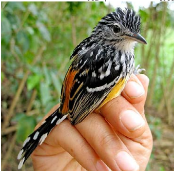
62 Drymophila devillei devillei Ad ♂ UV