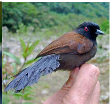
75 Pyriglena leuconota picea Ad ♀ PH