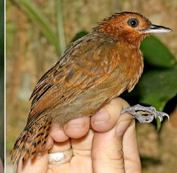
97 Gymnopithys salvini Ad ♀ JAT