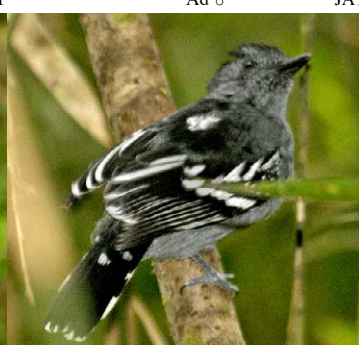
25 Thamnophilus amazonicus Ad ♂ JAT