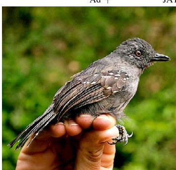
24 Thamnophilus aroyae Imm ♂ JAT