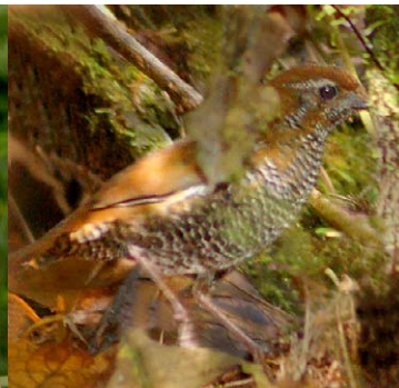
109 Chamaeza molissima Ad DL