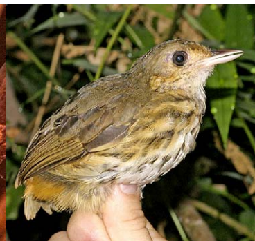
124 Hylopezus berlepschi Ad JAT