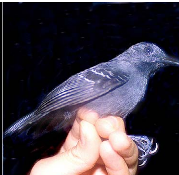
85 Percnostola arenarum Ad ♂