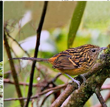
63 Drymophila caudata Ad ♀ JAT