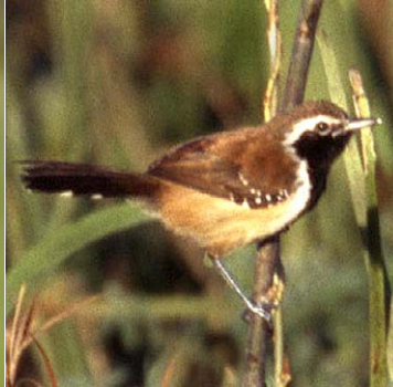
61 Formicivora rufa rufa Ad ♂ JAT