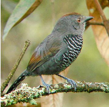
8 Thamnophilus ruficapillus marcapatae Ad ♂

[RRC@fmnh.org] [www.fmnh.org/animalguides/] Rapid Color Guide #256 version 1, 11/2009