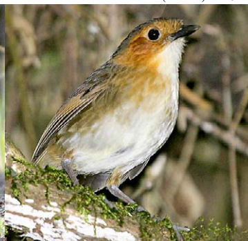
122 Grallaria erythrotis Ad JAT