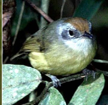
28 Dysithamnus mentalis mentalis Ad ♀ JAT