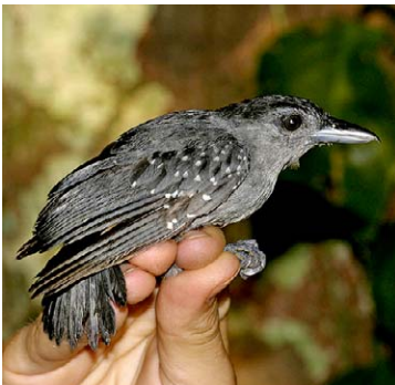
34 Pygiptila stellaris stellaris Ad ♂ JAT