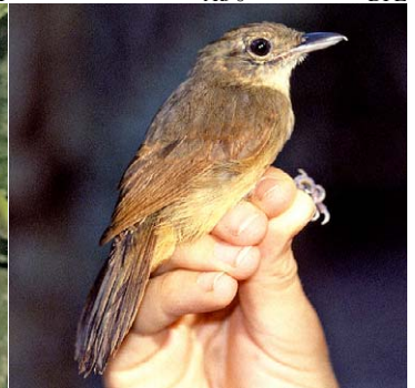
31 Thamnomanes saturninus Ad ♀