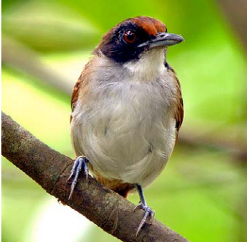
77 Myrmoborus lugubris Ad ♀

[RRC@fmnh.org] | www.fmnh.org/animalguides/ | Rapid Color Guide #256 version 1, 11/2009