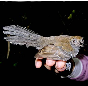
74 Cercomacra manu Ad ♀ DL