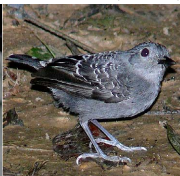
101 Willisornis poecilinotus griseiventris Ad ♂ PK