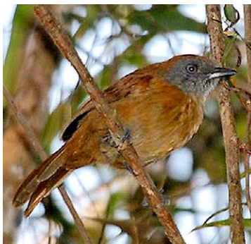
22 Thamnophilus unicolor Ad ♀ JAT