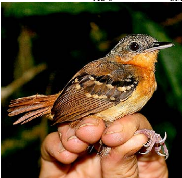
89 Myrmeciza hemimelaena Ad ♀