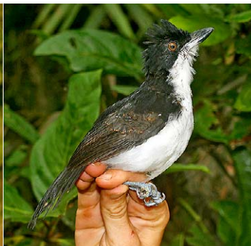
5 Taraba major Imm ♂ JAT