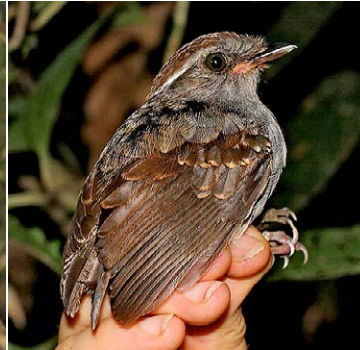
130 Conopophaga peruviana Imm ♂ JAT