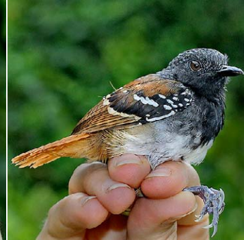
89 Myrmeciza hemimelaena Ad ♂