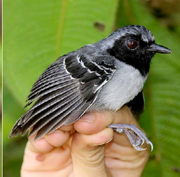
78 Myrmoborus myotherinus myotherinus Ad ♂