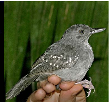
86 Schistocichla humaythae Ad ♂