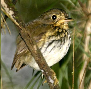
126 Grallaricula flavirostris boliviana Ad