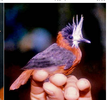
95 Pithys albifrons Ad DFL