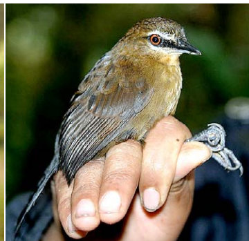
75 Pyriglena leuconota marcapatensis Ad ♀ CM