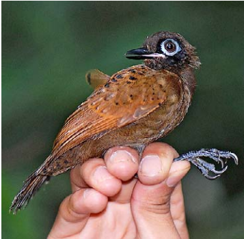
98 Rhegmatorhina melanosticta Juv JAT