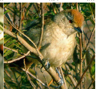
8 Thamnophilus ruficapillus ruficapillus Ad ♀ NA