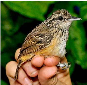
64 Hypocnemis peruviana peruviana Ad ♀ JAT