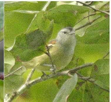
69 Terenura humeralis Ad ♂ JAT