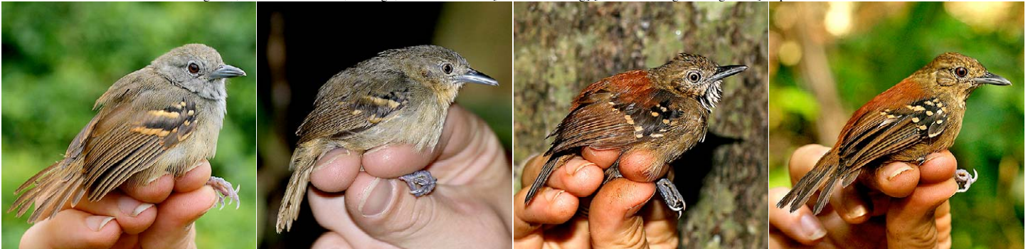
35 Epinecrophylla leucophthalma leucophthalma Ad ♀ "(brown eyes)" JAT 35 Epinecrophylla leucophthalma leucophthalma Imm ♀ JAT 36 Epinecrophylla haematonota haematonota Ad ♂ JAT 36 Epinecrophylla haematonota haematonota Ad ♀

[RRC@fmnh.org] | www.fmnh.org/animalguides/ | Rapid Color Guide #256 version 1, 11/2009