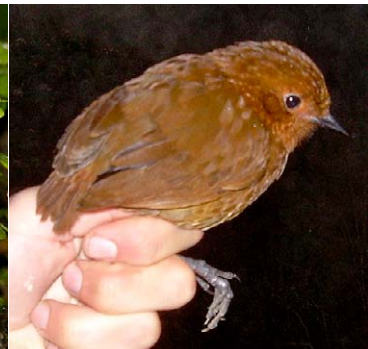
120 Grallaria blakei Ad PH