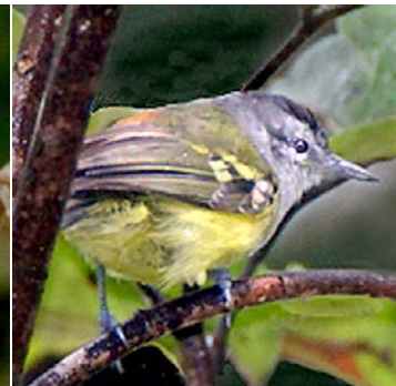
68 Terenura callinota Ad ♂ JAT