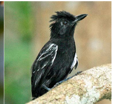
17 Thamnophilus cryptoleucus Ad ♂ KZ