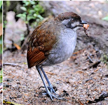
114 Grallaria ridgelyi Imm CP