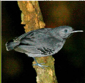
80 Hypocnemoides melanopogon Ad ♂ JAT