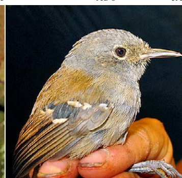
94 Myrmeciza griseiceps Ad ♂