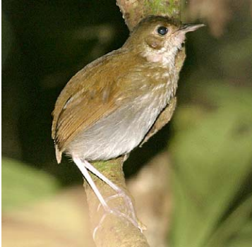
125 Myrmothera campanisona Ad

Photos by Roger Ahlman (RA), Mike Andersen (MA), Nick Athanas (NA), Steve Blain (SB), Dušan Brinkhuizen (DB), Rosalbina Butron (RB), Iain Campbell (IC), Bertrando Campos (BC), J. Chavez (JC), Arthur Grosset (AG), Wim Heylen (WH), Jon Hornbuckle (JH), Peter Hosner (PH), Caroline Isaksson (CI), Jill Jankowski (JJ), Philip Koch (PK), Daniel F. Lane (DFL), Daniel Lebbin (DL), Huw Lloyd (HL), Chris Merford (CM), Paul Noakes (PN), Scott Olmstead (SO), Chris Perrins (CP), Zacharia Peterson (ZP), Fernando Angulo Pratulongo (FAP), Robert Scanlon (RS), Ryan Shaw (RSh), Joseph A. Tobias, Wendy Tori (WT), Ursula Valdez (UV), Thomas Valqui (TV), Rob Williams (RW), Kevin Zimmer (KZ). © Environmental & Conservation Programs, The Field Museum, Chicago, IL 60605 USA. [RRC@fmnh.org] | www.fmnh.org/animalguides/ | Rapid Color Guide #256 version 1, 11/2009