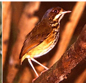
123 Hylopezus auricularis Ad