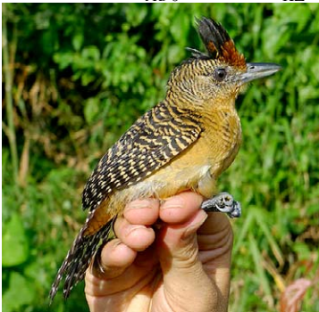
2 Cymbilaimus sanctaemariae Ad ♀ JAT