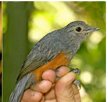
33 Thamnomanes schistogynus Ad ♀