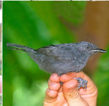
71 Cercomacra nigrescens fuscicauda Ad ♂ JAT