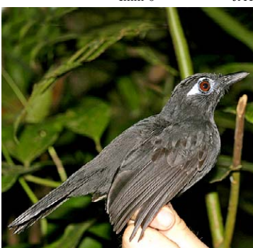
93 Myrmeciza fortis Ad ♂