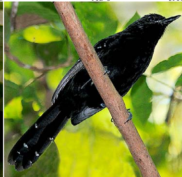
73 Cercomacra melanaria Ad ♂ KZ