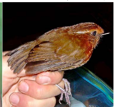
131 Conopophaga castaneiceps brunneinucha Ad ♀ PH