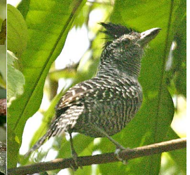
2 Cymbilaimus sanctaemariae Ad ♂ JAT