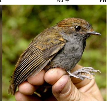
132 Conopophaga ardesiaca Juv JAT