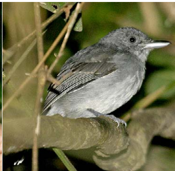
16 Thamnophilus murinus canipennis Ad ♂ JAT