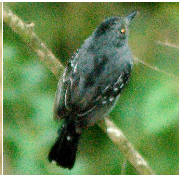
14 Thamnophilus atrinucha Ad ♂ DL