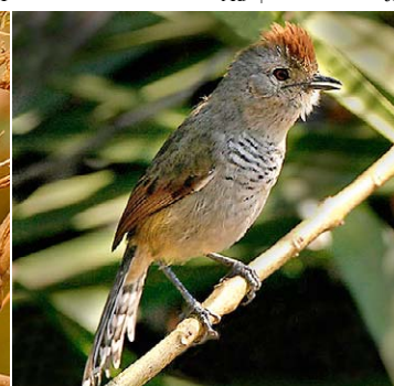
8 Thamnophilus ruficapillus cochabambae Ad ♂ JAT