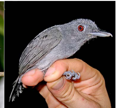
15 Thamnophilus schistaceus Ad ♂ DL