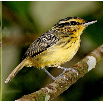
67 Hypocnemis hypoxantha Ad ♀ JAT