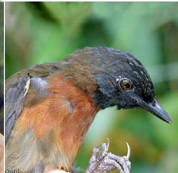
107 Formicarius rufipectus Ad CM