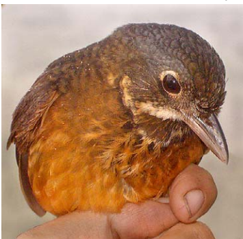
111 Grallaria guatemalensis Ad FAP