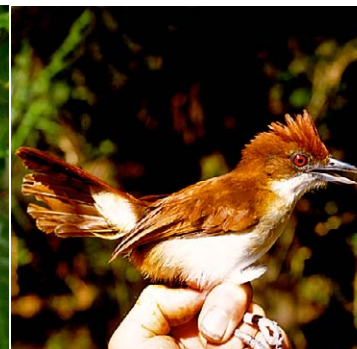
5 Taraba major Ad ♀ JH