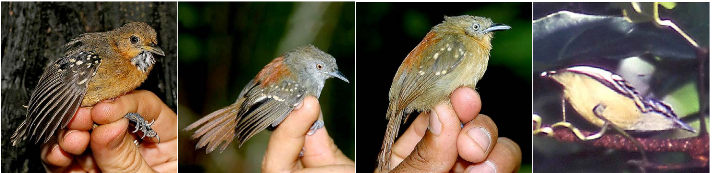
38 Epinecrophylla ornata meridionalis Ad ♀ JAT 39 Epinecrophylla erythrura septentrionalis Ad ♂ CM 39 Epinecrophylla erythrura septentrionalis Ad ♀ CM 40 Myrmotherula brachyura Ad ♂ AG