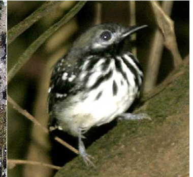
100 Hylophylax punctulata Ad ♂ JAT