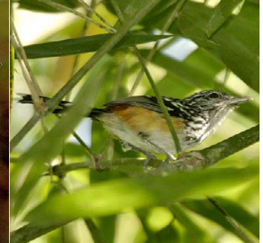
62 Drymophila devillei devillei Ad ♂