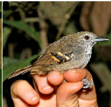
35 Epinecrophylla leucophthalma leucophthalma Ad ♂ "(brown eyes)" JAT