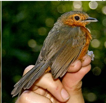
72 Cercomacra serva Ad ♀ JAT