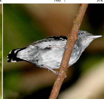
26 Megastictus margaritatus Ad ♂ JAT