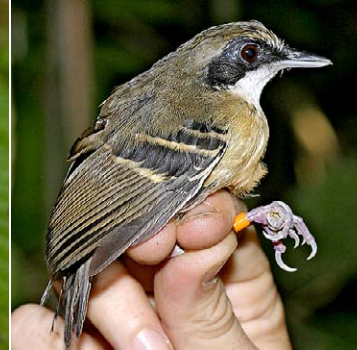
78 Myrmoborus myotherinus myotherinus Ad ♀ JAT