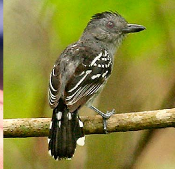
19 Thamnophilus stictocephalus Ad ♂ JAT