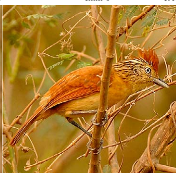
7 Thamnophilus doliatus radiatus Ad ♀ JAT