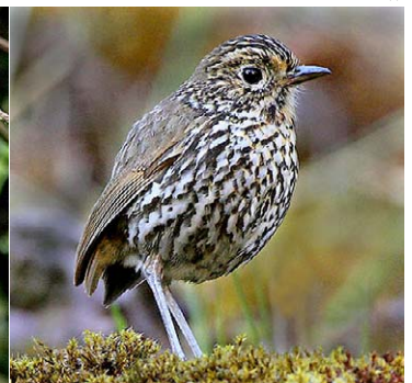
113 Grallaria andicola Ad