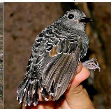
101 Willisornis poecilinotus griseiventris Imm ♂ JAT