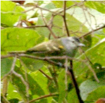
70 Terenura sharpei Ad ♂

Photos by Roger Ahlman (RA), Mike Andersen (MA), Nick Athanas (NA), Steve Blain (SB), Dušan Brinkhuizen (DB), Rosalbina Butron (RB), Iain Campbell (IC), Bertrando Campos (BC), J. Chavez (JC), Arthur Grosset (AG), Wim Heylen (WH), Jon Hornbuckle (JH), Peter Hosner (PH), Caroline Isaksson (CI), Jill Jankowski (JJ), Philip Koch (PK), Daniel F. Lane (DFL), Daniel Lebbin (DL), Huw Lloyd (HL), Chris Merkord (CM), Paul Noakes (PN), Scott Olmstead (SO), Chris Perrins (CP), Zacharia Peterson (ZP), Fernando Angulo Prtolongo (FAP), Robert Scanlon (RS), Ryan Shaw (RSh), Joseph A. Tobias, Wendy Tori (WT), Ursula Valdez (UV), Thomas Valqui (TV), Rob Williams (RW), Kevin Zimmer (KZ). © Environmental & Conservation Programs, The Field Museum, Chicago, IL 60605 USA. [RRC@fmnh.org] [www.fmnh.org/animalguides/] Rapid Color Guide #256 version 1, 11/2009