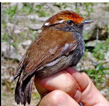
131 Conopophaga castaneiceps brunneinucha Ad ♂ PH