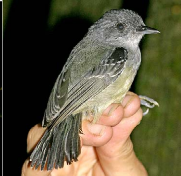
28 Dysithamnus mentalis tavarae Ad ♂ JAT