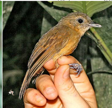
30 Thamnomanes ardesiacus ardesiacus Ad ♀ JAT