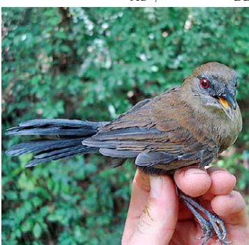
75 Pyriglena leuconota pacifica Ad ♀ DFL