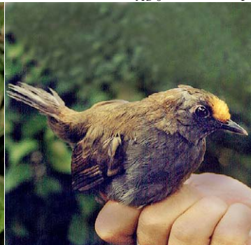
106 Formicarius rufifrons Ad HL