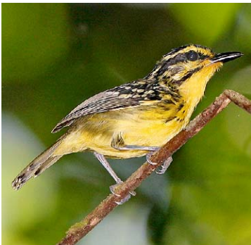
67 Hypocnemis hypoxantha Ad ♂ JAT