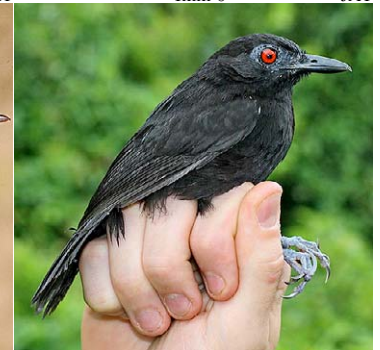
91 Myrmeciza goeldii Ad ♀