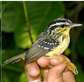
65 Hypocnemis subflava collinsi Ad ♂ JAT