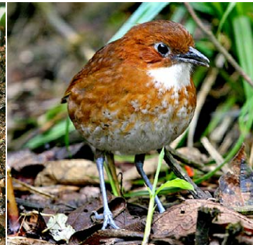
118 Grallaria erythroleuca Ad CI