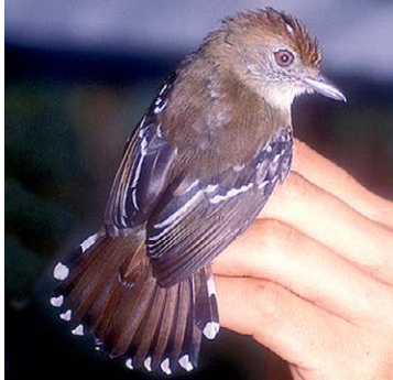
18 Thamnophilus punctatus leucogaster Ad ♀ DFL

© Environmental & Conservation Programs, The Field Museum, Chicago, IL 60605 USA. [RRC@fmnh.org] | www.fmnh.org/animalguides/ | Rapid Color Guide #256 version 1, 11/2009