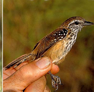
61 Formicivora rufa rufa Ad ♀ JH