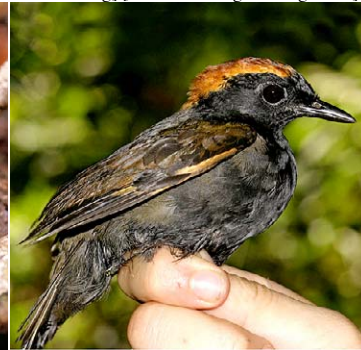
104 Formicarius colma Ad JAT