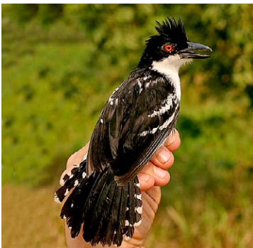
5 Taraba major Ad ♂ JAT