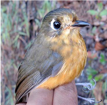
128 Grallaricula ferruginepectus leymebambae Imm RB