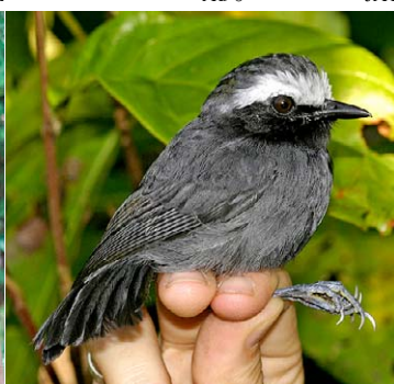
76 Myrmoborus leucophrys Ad ♂ JAT