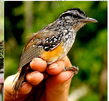
64 Hypocnemis peruviana peruviana Ad ♂ JAT