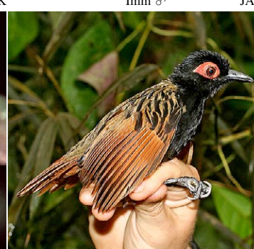
102 Phlegopsis nigromaculata nigromaculata Ad JAT