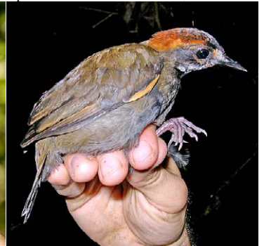
104 Formicarius colma Juv DL