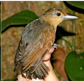
34 Pygiptila stellaris stellaris Ad ♀ JAT