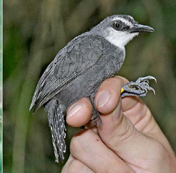
97 Gymnopithys salvini Ad ♂ JAT