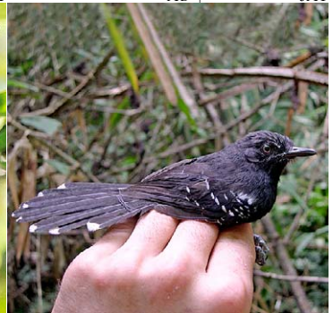
74 Cercomacra manu Ad ♂ DL