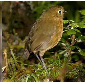
119 Grallaria (rufula) cochabambae Ad JAT