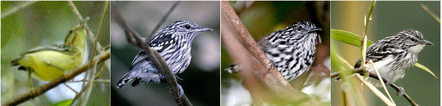
41 Myrmotherula sclateri Ad ♂ JAT 42 Myrmotherula multostriata Ad ♂ 43 Myrmotherula cherriei Ad ♂ JAT 44 Myrmotherula longicauda Ad ♂