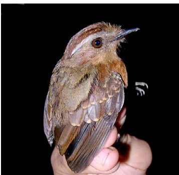
130 Conopophaga peruviana Ad ♀ PH