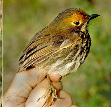
127 Grallaricula ochraceifrons Ad JH