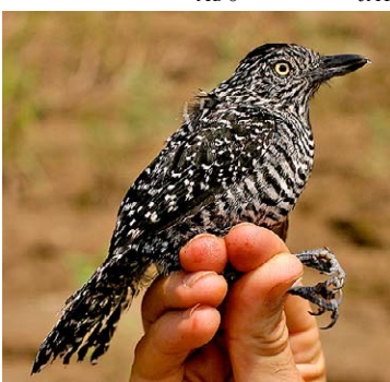
7 Thamnophilus doliatus radiatus Ad ♂ JAT