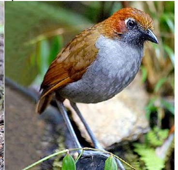
115 Grallaria nuchalis Ad DB