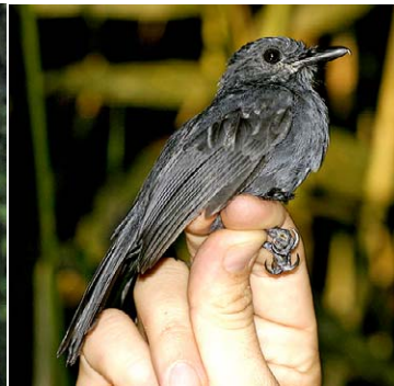
33 Thamnomanes schistogynus Ad ♂