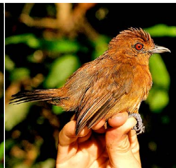
23 Thamnophilus aethiops kapounis Ad ♀