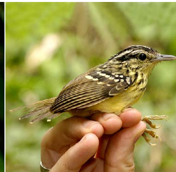
65 Hypocnemis subflava collinsi Ad ♀ JAT