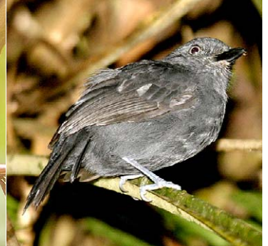
22 Thamnophilus unicolor Ad ♂ (Cusco) JAT