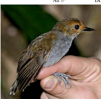
101 Willisornis poecilinotus griseiventris Ad ♀