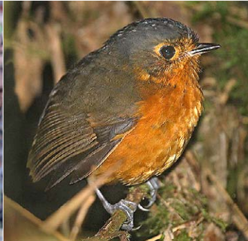
129 Grallaricula nana nana Ad JAT