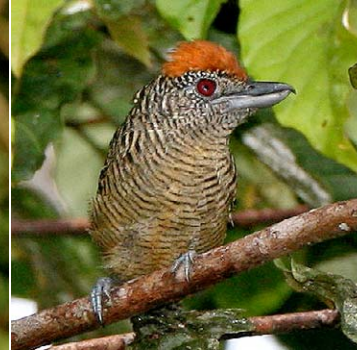
1 Cymbilaimus lineatus Ad ♀ JAT