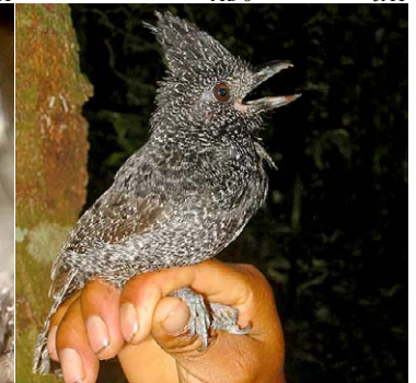
4 Frederickena unduligera Ad ♂ WT