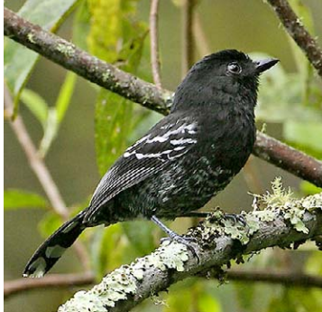
21 Thamnophilus caeruleus aspersiventer Ad ♂ JAT