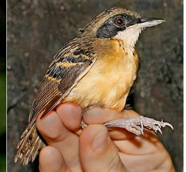
78 Myrmoborus myotherinus myotherinus Imm ♀ JAT