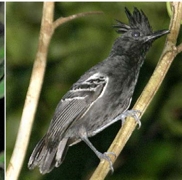
84 Percnostola lophotes Ad ♂ JAT