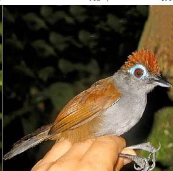
93 Myrmeciza fortis Ad ♀ UV