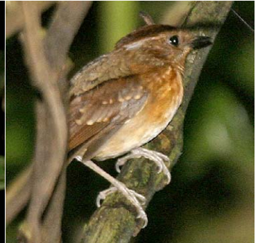
130 Conopophaga peruviana Ad ♀ JAT