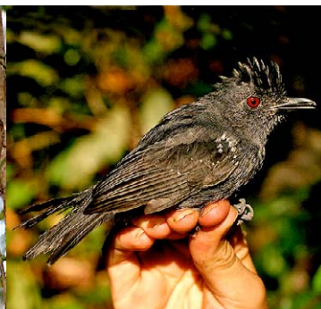
23 Thamnophilus aethiops kapounis Ad ♂