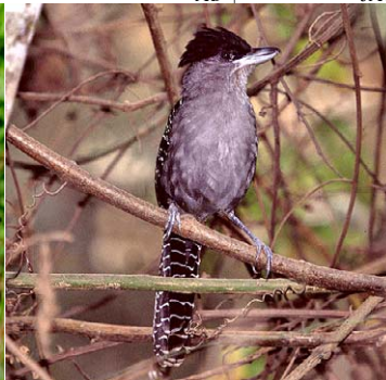
3 Batara cinerea argentina Ad ♂