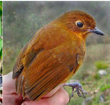
119 Grallaria (rufula) obscura Ad MA