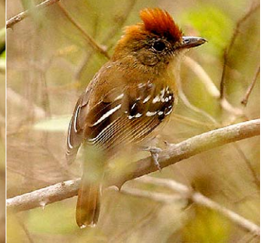
20 Thamnophilus sticturus Ad ♀ JAT