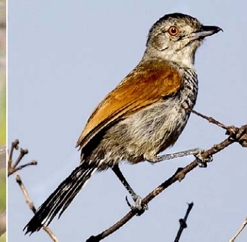
9 Thamnophilus torquatus Ad ♂ AG