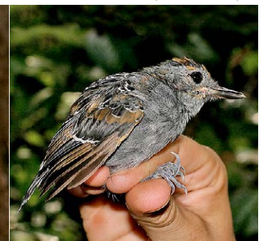
101 Willisornis poecilinotus griseiventris Imm ♂ JAT