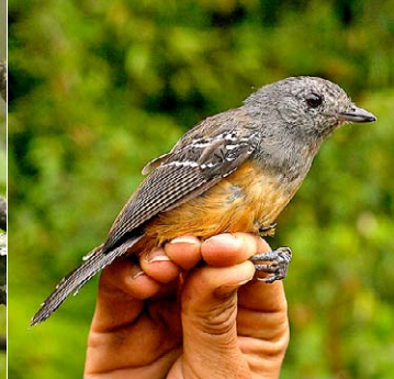
21 Thamnophilus caeruleus aspersiventer Ad ♀ JAT