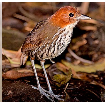
112 Grallaria ruficapilla Ad RSh