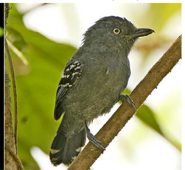
24 Thamnophilus aroyae Ad ♂