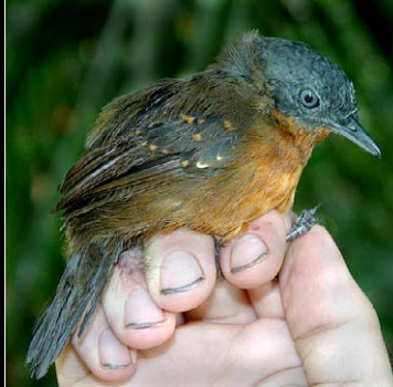
88 Schistocichla leucostigma subplumbea Ad ♀ CM