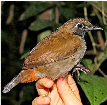
105 Formicarius analis Ad JAT