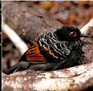
103 Phlegopsis erythroptera Ad ♂ TV