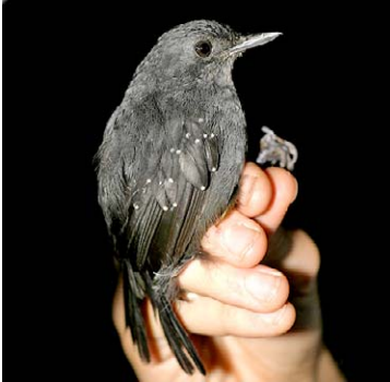
87 Schistocichla brunneiceps Ad ♂

Photos by Roger Ahlman (RA), Mike Andersen (MA), Nick Athanas (NA), Steve Blain (SB), Dušan Brinkhuizen (DB), Rosalbina Butron (RB), Iain Campbell (IC), Bertrando Campos (BC), J. Chavez (JC), Arthur Grosset (AG), Wim Heylen (WH), Jon Hornbuckle (JH), Peter Hosner (PH), Caroline Isaksson (CI), Jill Jankowski (JJ), Philip Koch (PK), Daniel F. Lane (DFL), Daniel Lebbin (DL), Huw Lloyd (HL), Chris Merckold, Paul Noakes (PN), Scott Olmstead (SO), Chris Perrins (CP), Zacharia Peterson (ZP), Fernando Angulo Pratulongo (FAP), Robert Scanlon (RS), Ryan Shaw (RSh), Joseph A. Tobias (JAT), Wendy Tori (WT), Ursula Valdez (UV), Thomas Valqui (TV), Rob Williams (RW), Kevin Zimmer (KZ). © Environmental & Conservation Programs, The Field Museum, Chicago, IL 60605 USA. [RRC@fmnh.org] [www.fmnh.org/animalguides/] Rapid Color Guide #256 version 1, 11/2009