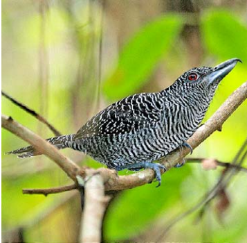
1 Cymbilaimus lineatus Ad ♂

[RRC@fmnh.org] | www.fmnh.org/animalguides/ | Rapid Color Guide #256 version 1, 11/2009