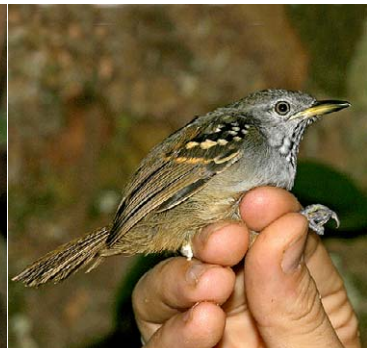
35 Epinecrophylla leucophthalma leucophthalma Imm ♂ JAT