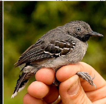
81 Hypocnemoides maculicauda Ad ♂ JAT