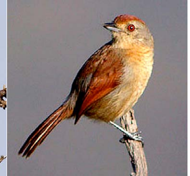
9 Thamnophilus torquatus Ad ♀ NA