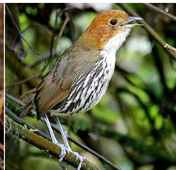
112 Grallaria ruficapilla Ad DB