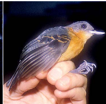
85 Percnostola arenarum Ad ♀ DFL