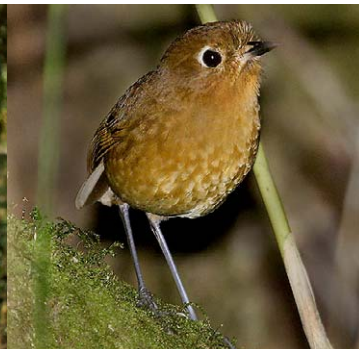
119 Grallaria (rufula) taxon nov. Ad (La Paz)