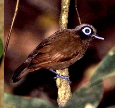
98 Rhegmatorhina melanosticta Ad