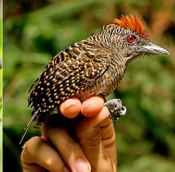
1 Cymbilaimus lineatus Ad ♀ JAT