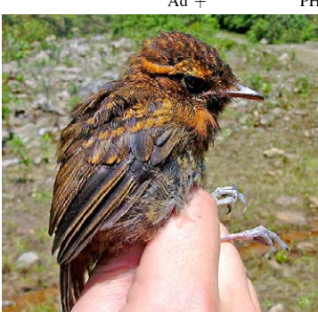
131 Conopophaga castaneiceps brunneinucha Juv PH