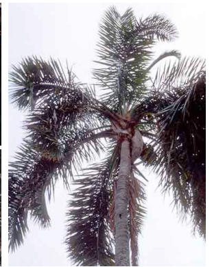
40 Syagrus sancona