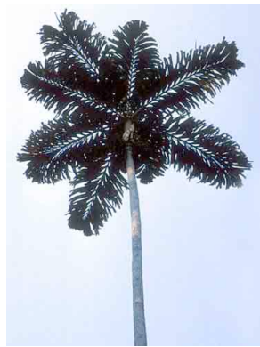
38 Socratea exorrhiza