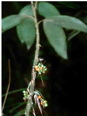
17 Bactris simplicifrons