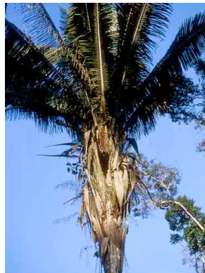
8 Attalea speciosa