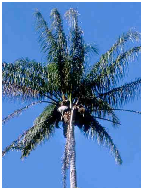
6 Attalea maripa