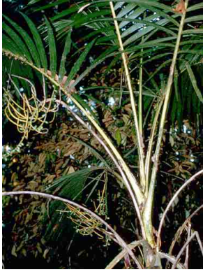
21 Chamaedorea angustisecta

© Environmental & Conservation Programs, The Field Museum, Chicago, IL 60605 USA. [RRC@fmnh.org] Rapid Color Guide # 146 version 1.0