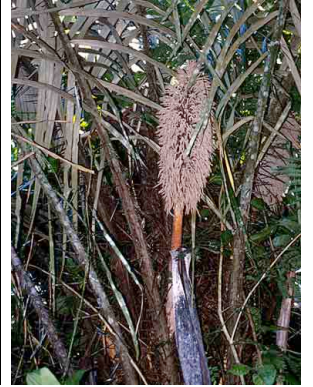
5 Astrocaryum murumuru