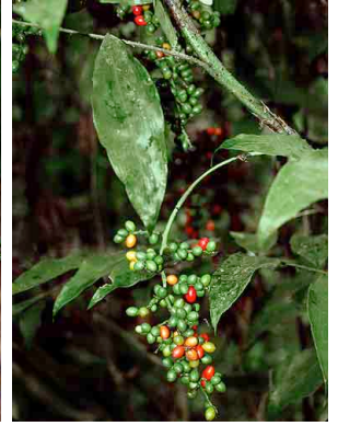
25 Desmoncus orthacanthos