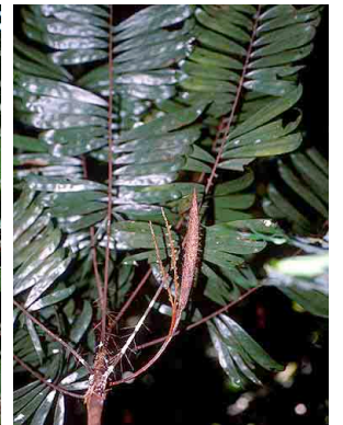
20 Bactris sp. nov.?