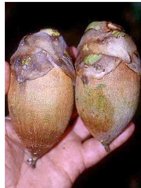
9 Attalea speciosa