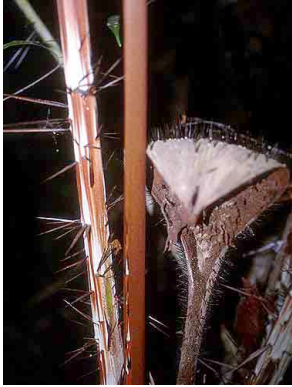
1 Astrocaryum acaule

© Environmental & Conservation Programs, The Field Museum, Chicago, IL 60605 USA. [RRC@fmnh.org] Rapid Color Guide # 146 version 1.0