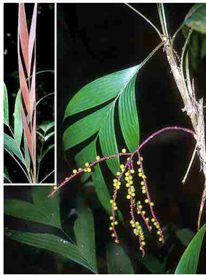
27 Geonoma deversa