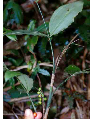
24 Desmoncus mitis