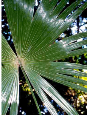
22 Chelyocarpus chuco