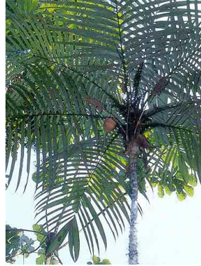
3 Astrocaryum gynacanthum