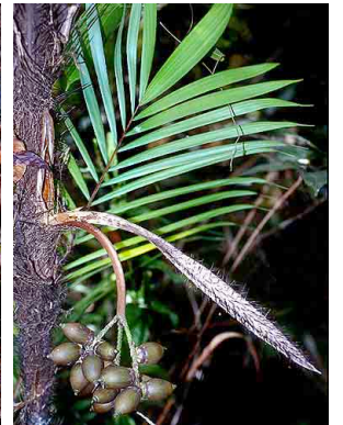
15 Bactris major cf.