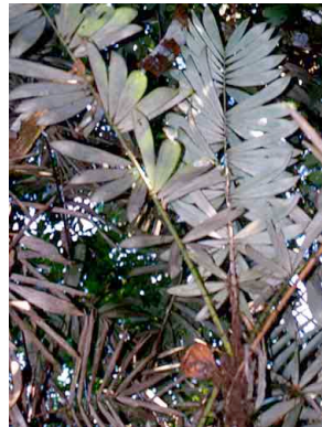
13 Bactris glaucescens