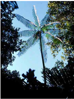
26 Euterpe precatoria