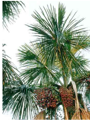
33 Mauritia flexuosa