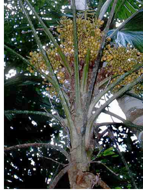
23 Chelyocarpus chuco