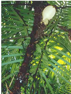
12 Bactris concinna