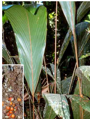
18 Bactris trailiana