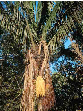
36 Oenocarpus bataua