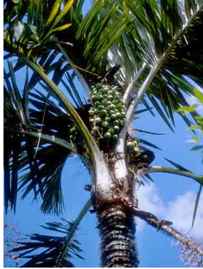
2 Astrocaryum aculeatum