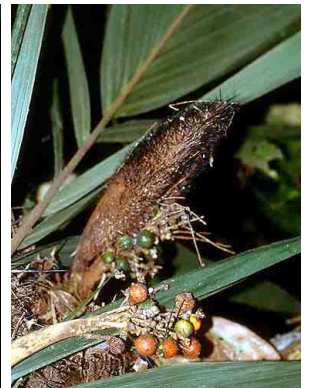
10 Bactris acanthocarpa