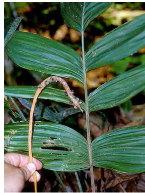
28 Geonoma macrostachys