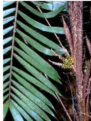
14 Bactris hirta cf.