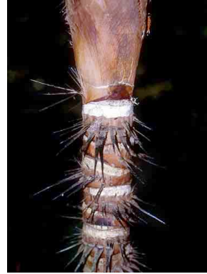
4 Astrocaryum gynacanthum