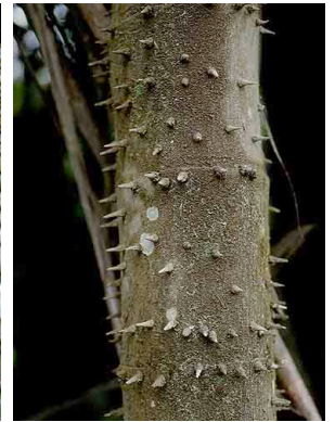
35 Mauritiella armata