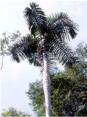
31 Iriartea deltoidea