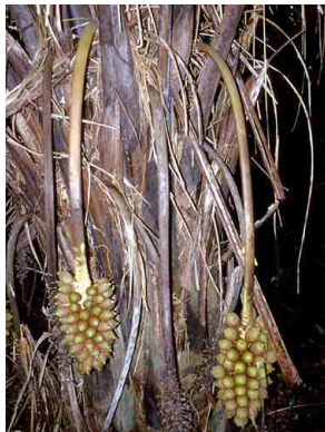
7 Attalea phalerata