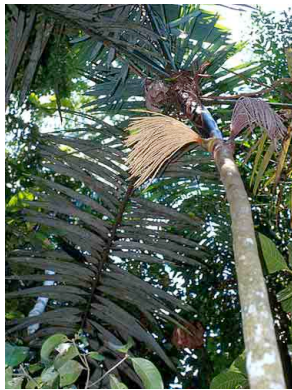
37 Oenocarpus mapora