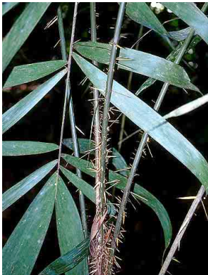
11 Bactris brongniartii