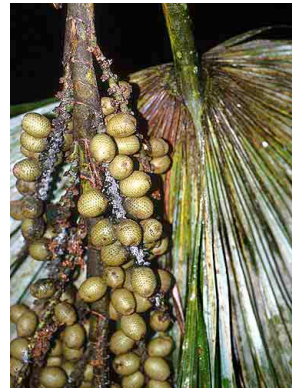
34 Mauritiella armata