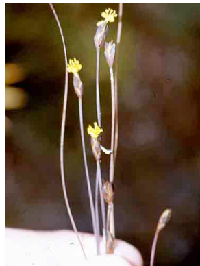
58 Xyris XYRIDACEAE