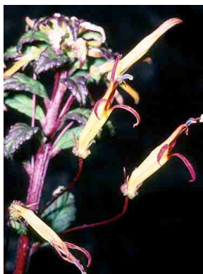
18 Centropogon CAMPANULACEAE