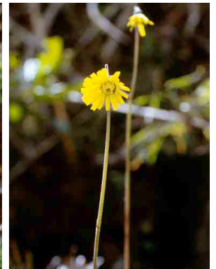
10 Hieracium ASTERACEAE