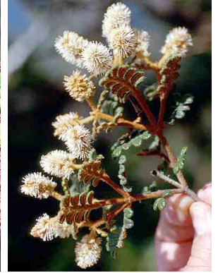
25 Weinmannia CUNONIACEAE