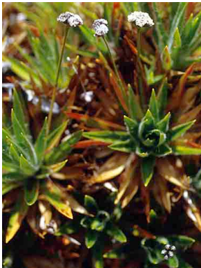
31 Paepalanthus ERIOCAULACEAE