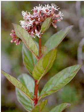
11 Baccharis ASTERACEAE