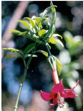
32 Symbolanthus GENTIANACEAE