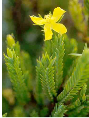
23 Hypericum CLUSIACEAE