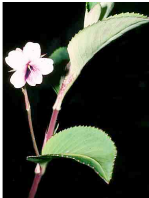
57 Viola VIOLACEAE