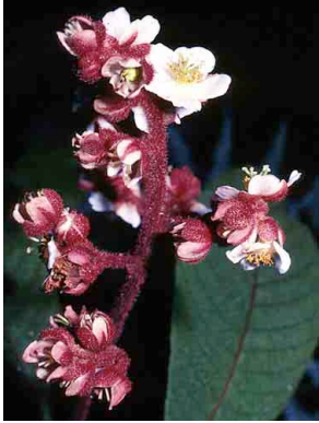
1 Saurauia ACTINIDIACEAE