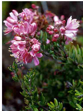
28 Bejaria ERICACEAE