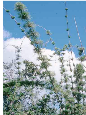
49 Chusquea POACEAE