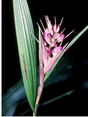
42 Elleanthus ORCHIDACEAE