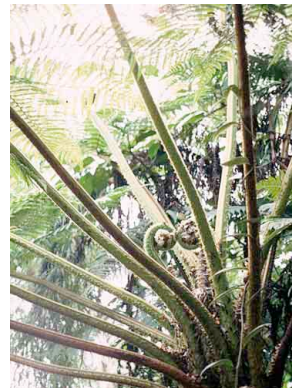
59 Cyathea PTERIDOPHYTA