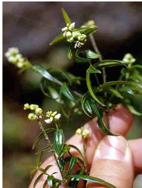
52 Polygala POLYGALACEAE