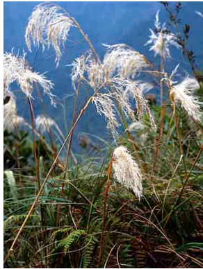
47 Cortaderia POACEAE