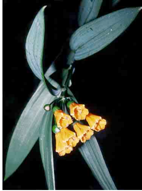
3 Bomarea ALSTROEMERIACEAE