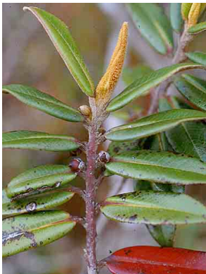
56 Freziera THEACEAE