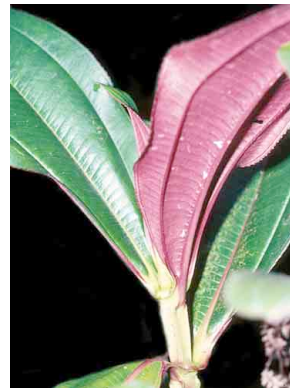
39 Miconia MELASTOMATACEAE