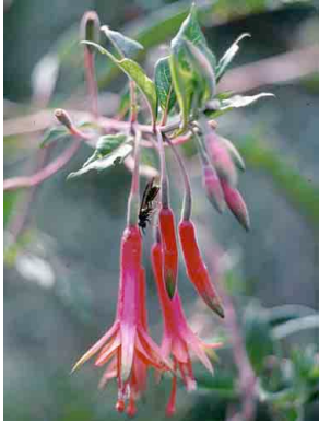
41 Fuchsia ONAGRACEAE