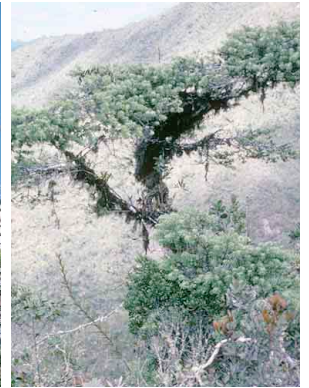
50 Podocarpus PODOCARPACEAE