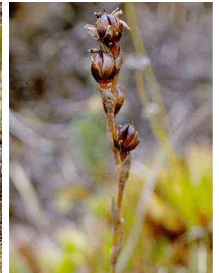
15 Puya BROMELIACEAE