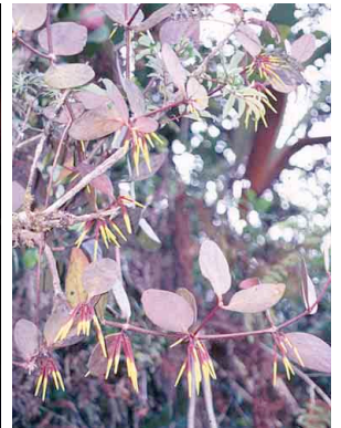
35 Aethanathus LORANTHACEAE