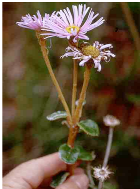
8 Diplostephium ASTERACEAE