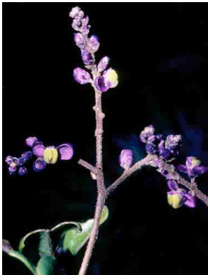
51 Monnina POLYGALACEAE