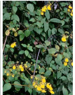
55 Calceolaria SCROPHULARIACEAE