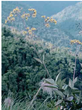
13 Senecio ASTERACEAE