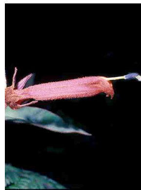
19 Siphocampylus CAMPANULACEAE