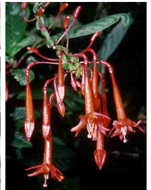
40 Fuchsia ONAGRACEAE