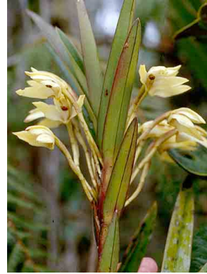
44 Maxillaria ORCHIDACEAE