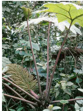
33 Gunnera GUNNERACEAE