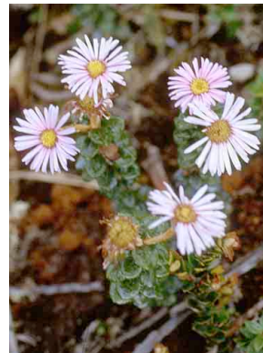
9 Diplostephium ASTERACEAE