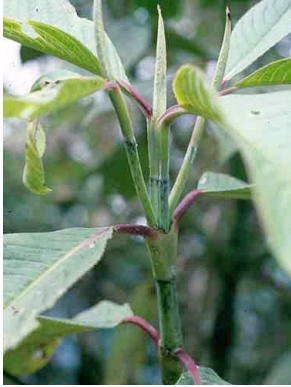
21 Hedyosmum CHLORANTHACEAE