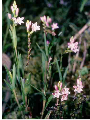
43 Epidendrum ORCHIDACEAE