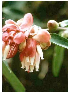
29 Cavendishia ERICACEAE