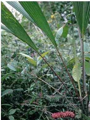
26 Sphaeradenia CYCLANTHACEAE