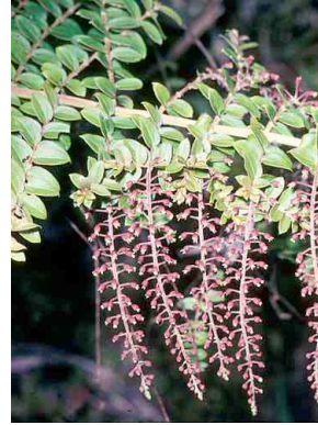
24 Coriaria CORIARIACEAE