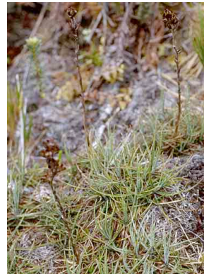
14 Puya BROMELIACEAE