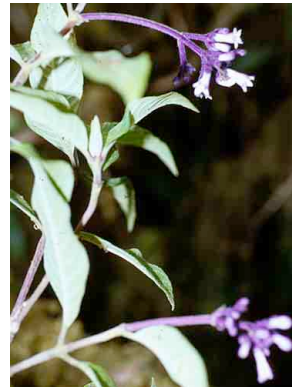
54 Palicourea RUBIACEAE