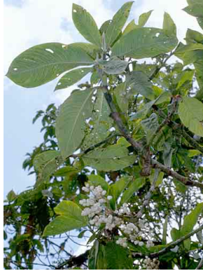
22 Hedyosmum CHLORANTHACEAE