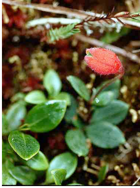
2 Bomarea ALSTROEMERIACEAE