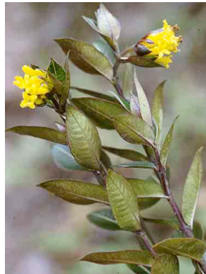
53 Palicourea RUBIACEAE