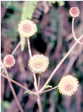
12 Oritrophium ASTERACEAE