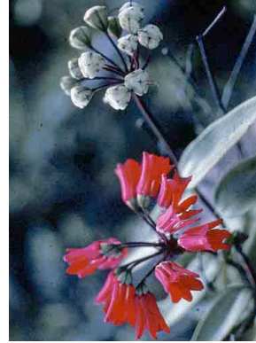
4 Bomarea ALSTROEMERIACEAE