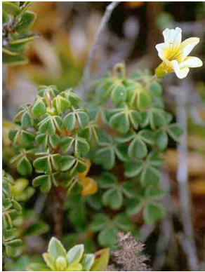
46 Oxalis OXALIDACEAE