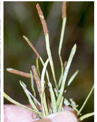
60 Grammitis PTERIDOPHYTA