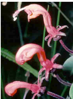
17 Centropogon CAMPANULACEAE