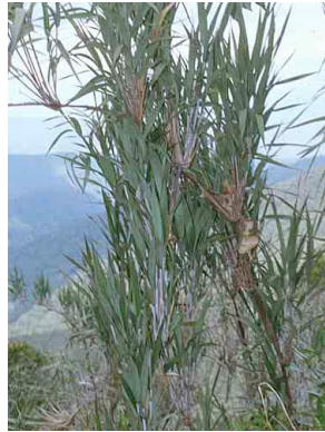
48 Chusquea POACEAE