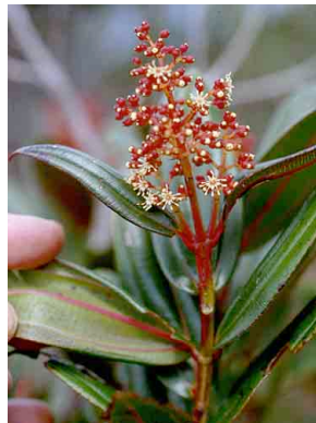
38 Miconia MELASTOMATACEAE