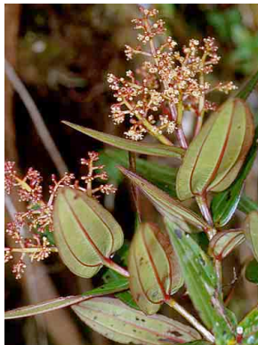
37 Miconia MELASTOMATACEAE