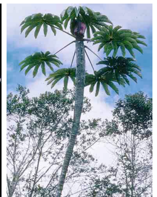
20 Cecropia CECROPIACEAE