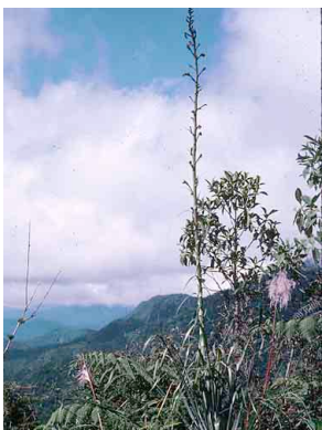
16 Puya BROMELIACEAE