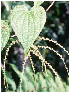
27 Dioscorea DIOSCOREACEAE