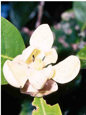
36 Talauma MAGNOLIACEAE