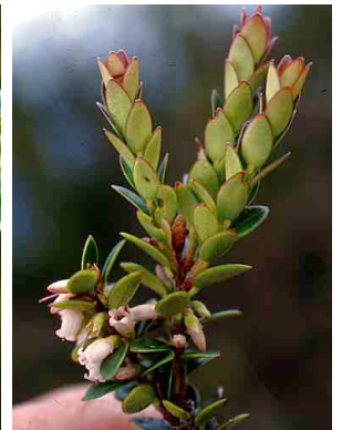
30 Disterigma ERICACEAE