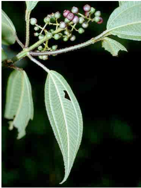
86 Miconia MELASTOMATACEAE