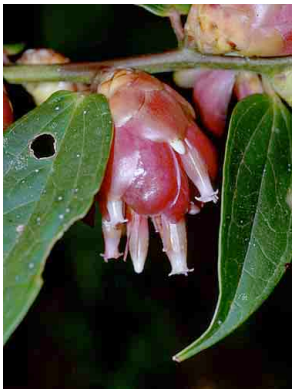
56 Cavendishia ERICACEAE