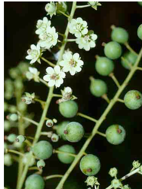
154 Tovaria TOVARIACEAE