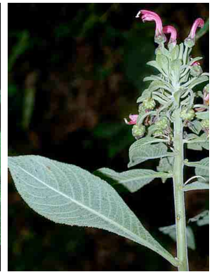
40 Centropogon CAMPANULACEAE