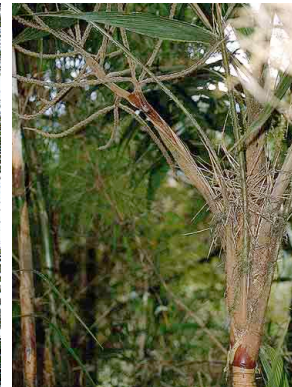
14 Geonoma ARECACEAE