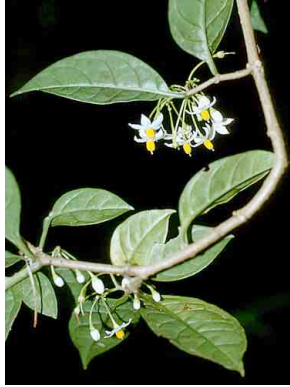
143 Solanum SOLANACEAE