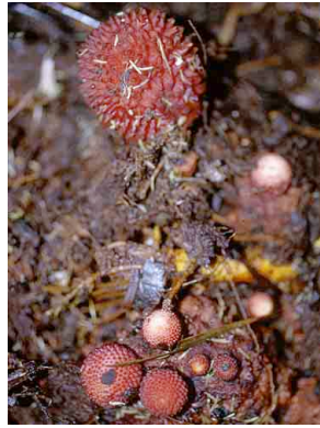
28 Ombrophytum BALANOPHORACEAE