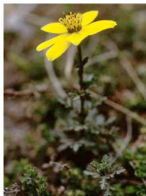
18 Bidens ASTERACEAE