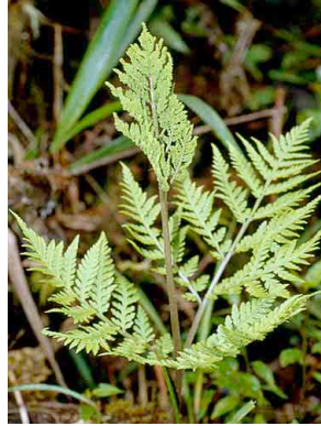
163 Botrychium PTERIDOPHYTA