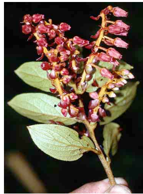
58 Gaultheria ERICACEAE