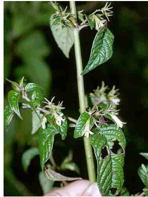
128 Hoffmannia RUBIACEAE