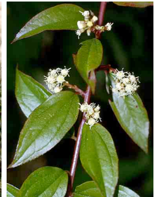
15 Baccharis ASTERACEAE