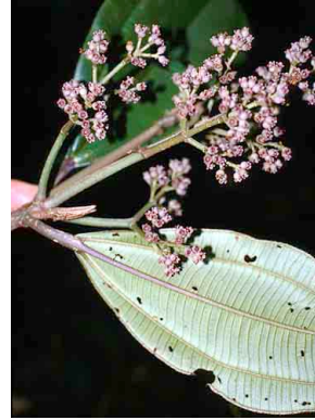
84 Miconia MELASTOMATACEAE