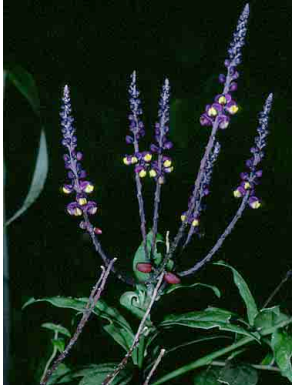
121 Monnina POLYGALACEAE

Rapid Color Guide # 92 version 1.1