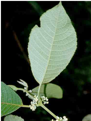
91 Siparuna MONIMIACEAE