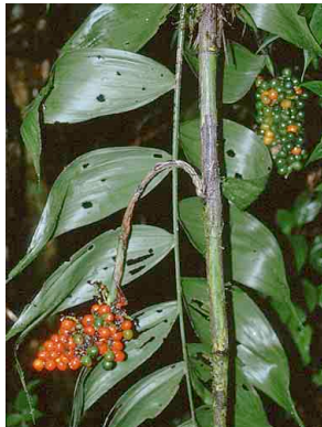
12 Chamaedorea ARECACEAE