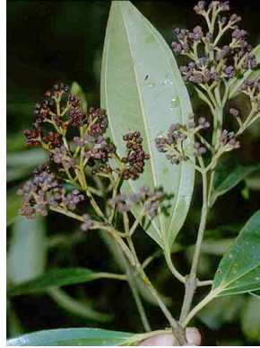
83 Miconia MELASTOMATACEAE