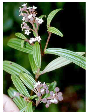
80 Miconia MELASTOMATACEAE