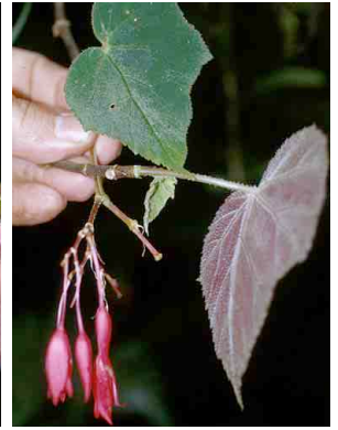
30 Begonia BEGONIACEAE