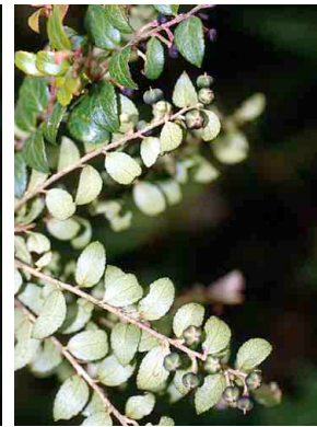
59 Gaultheria ERICACEAE