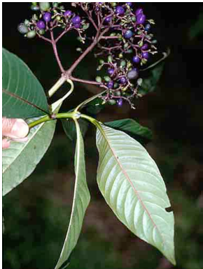
131 Psychotria RUBIACEAE