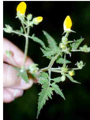
134 Calceolaria SCROPHULARIACEAE