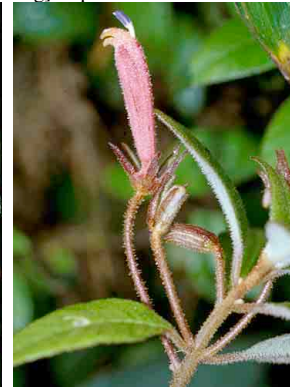
44 Siphocampylus CAMPANULACEAE