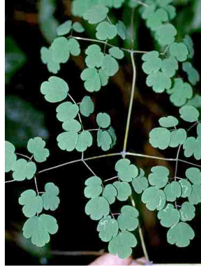
123 Thalictrum RANUNCULACEAE