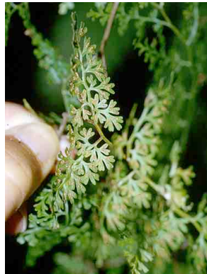
173 Eriosorus PTERIDOPHYTA