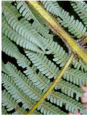
167 Cyathea PTERIDOPHYTA