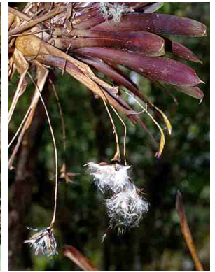
35 Tillandsia BROMELIACEAE