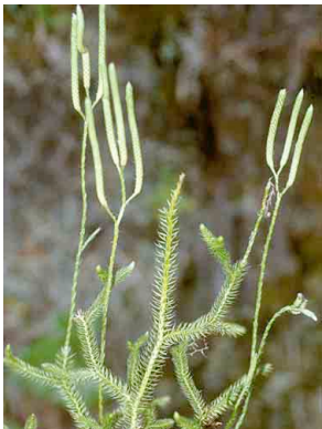
176 Lycopodium PTERIDOPHYTA