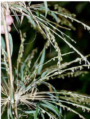
116 Guadua POACEAE