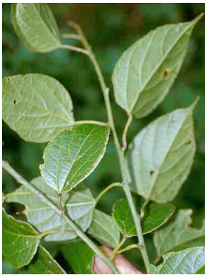
66 Plukenetia EUPHORBIACEAE