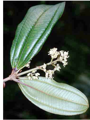
89 Miconia MELASTOMATACEAE