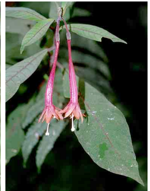
95 Fuchsia ONAGRACEAE