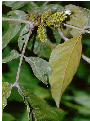
68 Inga FABACEAE