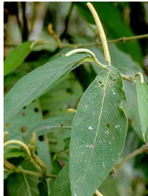
113 Piper PIPERACEAE