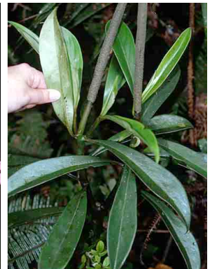
110 Peperomia PIPERACEAE