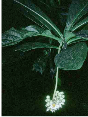
142 Solanum SOLANACEAE