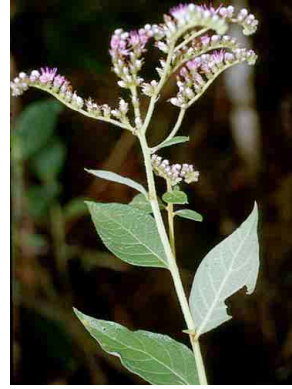
24 Vernonia ASTERACEAE