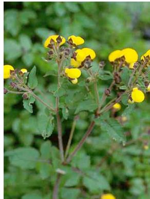
133 Calceolaria SCROPHULARIACEAE