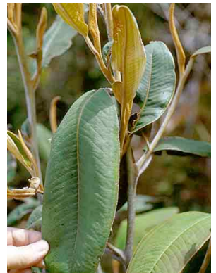
150 Freziera THEACEAE