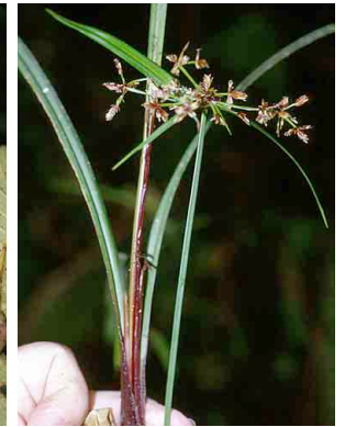
55 Cyperus CYPERACEAE