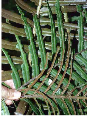
162 Blechnum PTERIDOPHYTA