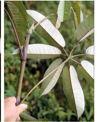
10 Schefflera ARALIACEAE