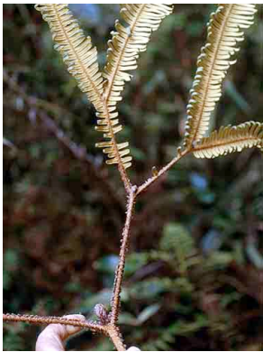
186 Sticherus PTERIDOPHYTA