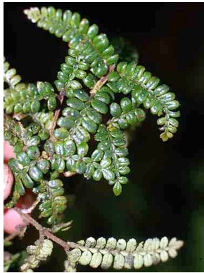
52 Weinmannia CUNONIACEAE