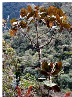
79 Graffenrieda MELASTOMATACEAE