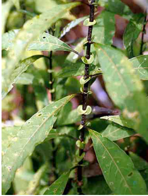
141 Cestrum SOLANACEAE