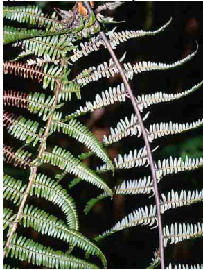
183 Diplazium PTERIDOPHYTA