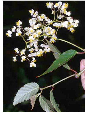
29 Begonia BEGONIACEAE