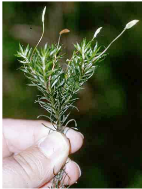
193 Polytrichum BRYOPHYTA