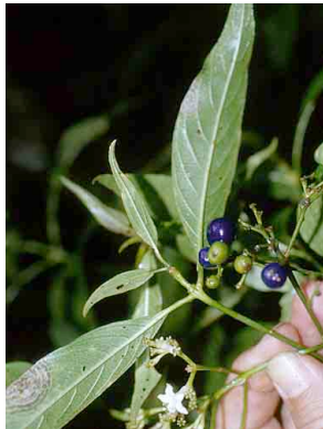
132 Psychotria RUBIACEAE