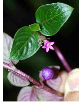
125 Coccocypselum RUBIACEAE