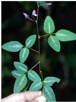
67 Desmodium FABACEAE