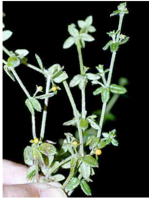
127 Galium RUBIACEAE