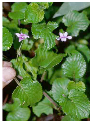
159 Viola VIOLACEAE