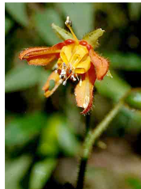
74 Nasa cf. pascoensis LOASACEAE