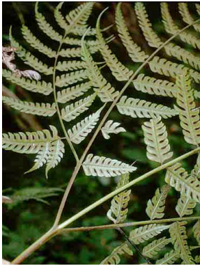
181 Pteris PTERIDOPHYTA