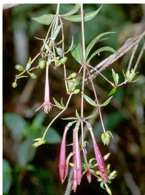
97 Fuchsia ONAGRACEAE