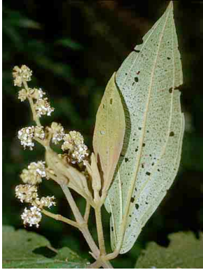
81 Miconia MELASTOMATACEAE

[RRC@fmnh.org] Rapid Color Guide # 92 version 1.1