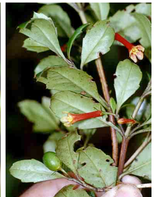
75 Desfontainea LOGANIACEAE