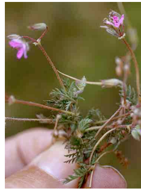
69 Geranium GERANIACEAE