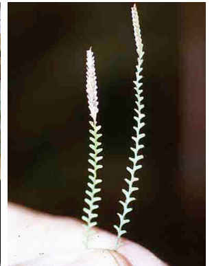
175 Grammitis PTERIDOPHYTA