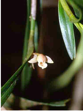
101 Maxillaria ORCHIDACEAE