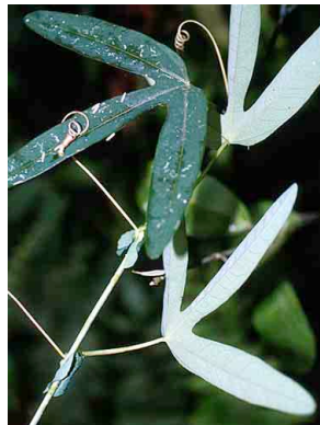
108 Passiflora PASSIFLORACEAE