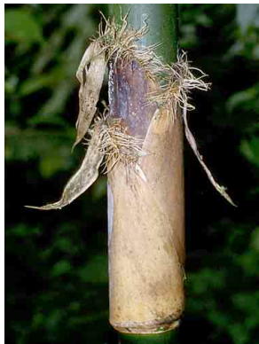
117 Guadua POACEAE