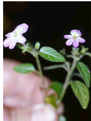
139 Browallia SOLANACEAE