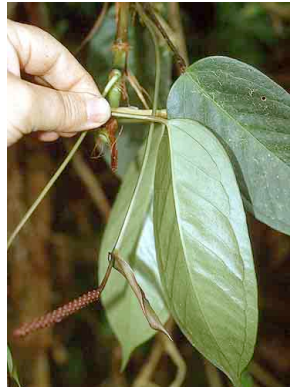
8 Anthurium ARACEAE