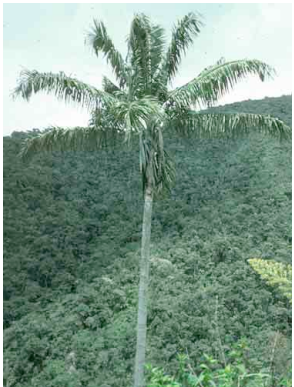
11 Ceroxylon ARECACEAE