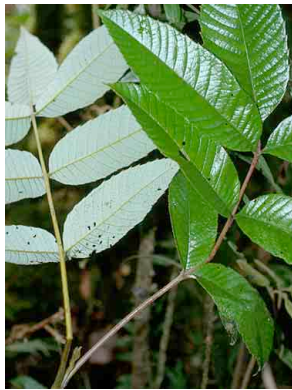
37 Brunellia BRUNELLIACEAE