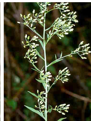
19 Conyza ASTERACEAE