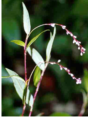
122 Polygonum POLYGONACEAE