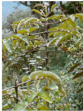
38 Brunellia BRUNELLIACEAE