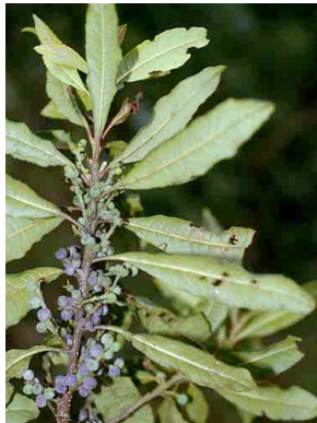
92 Myrica MYRICACEAE