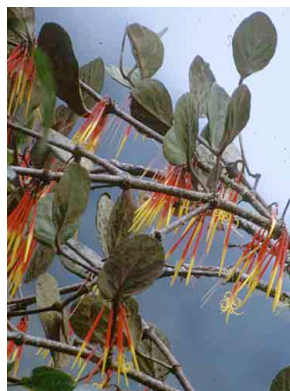
78 Aetanthus LORANTHACEAE