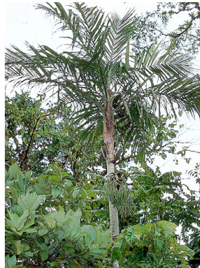
13 Geonoma ARECACEAE