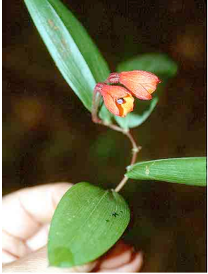
1 Bomarea ALSTROEMERIACEAE

Rapid Color Guide # 92 version 1.1