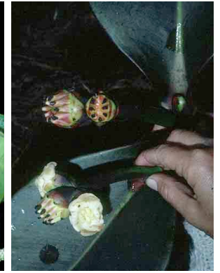
50 Clusia CLUSIACEAE