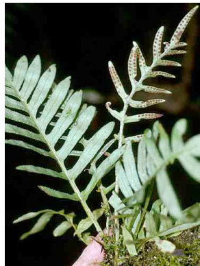
178 Polypodium PTERIDOPHYTA