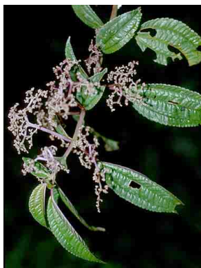
157 Pilea URTICACEAE