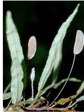
169 Elaphoglossum PTERIDOPHYTA