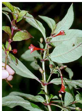
98 Fuchsia ONAGRACEAE