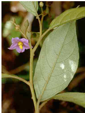
147 Solanum SOLANACEAE