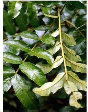
90 Ruagea MELIACEAE