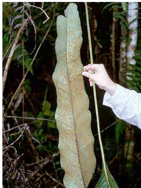
177 Niphidium PTERIDOPHYTA