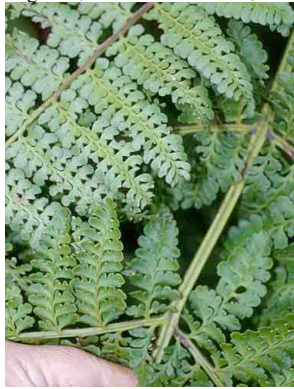
182 Saccoloma PTERIDOPHYTA