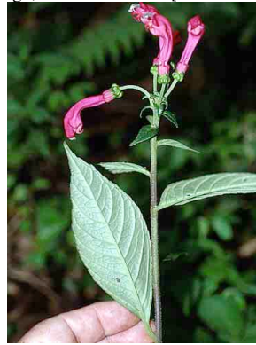
43 Centropogon CAMPANULACEAE