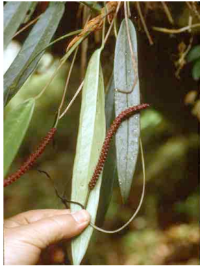
7 Anthurium ARACEAE