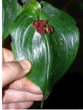
103 Pleurothallis ORCHIDACEAE