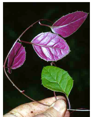
160 Cissus VITACEAE