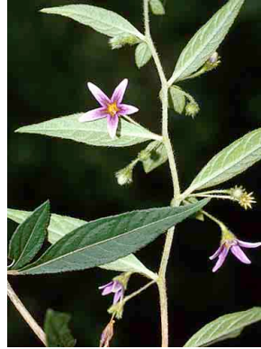
144 Solanum SOLANACEAE