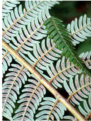
168 Cyathea PTERIDOPHYTA