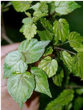
111 Peperomia PIPERACEAE