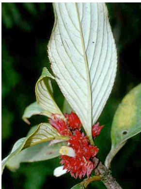
71 Columnea GESNERIACEAE