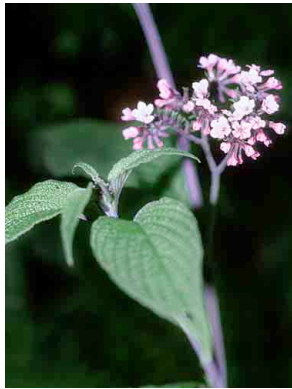
32 Heliotropium BORAGINACEAE