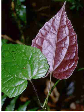
22 Mikania ASTERACEAE