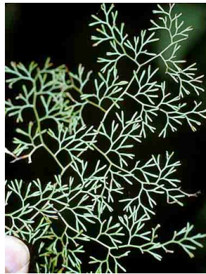
190 Trichomanes PTERIDOPHYTA