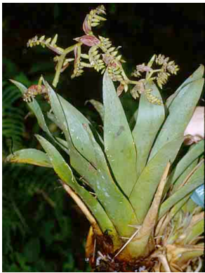
36 Tillandsia BROMELIACEAE