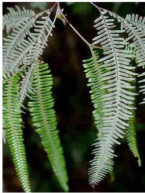
187 Sticherus PTERIDOPHYTA