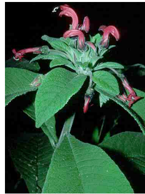
39 Centropogon CAMPANULACEAE