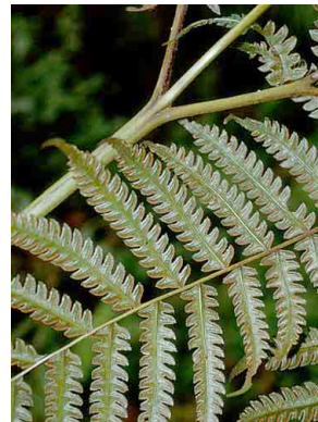
179 Pteris PTERIDOPHYTA