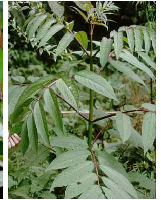
45 Sambucus CAPRIFOLIACEAE