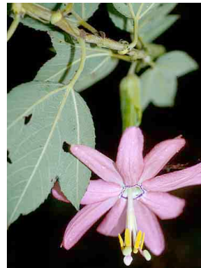
109 Passiflora PASSIFLORACEAE