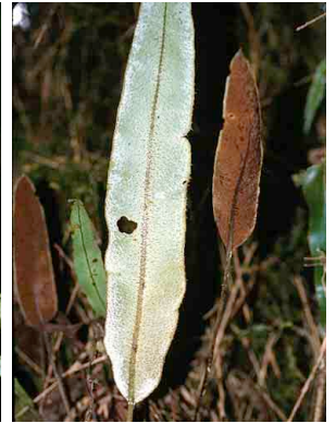
170 Elaphoglossum PTERIDOPHYTA