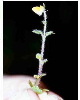
135 Calceolaria SCROPHULARIACEAE