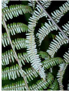
184 Diplazium PTERIDOPHYTA