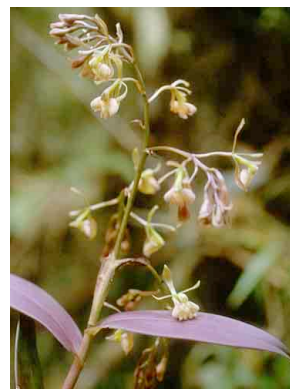
99 Epidendrum ORCHIDACEAE