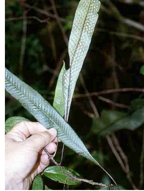
164 Campyloneurum PTERIDOPHYTA