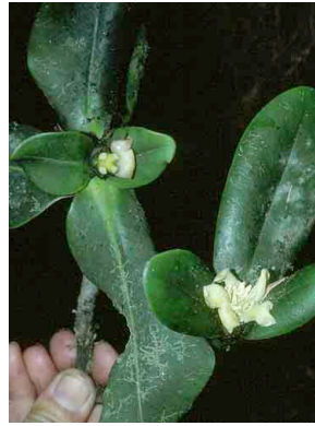
48 Clusia CLUSIACEAE