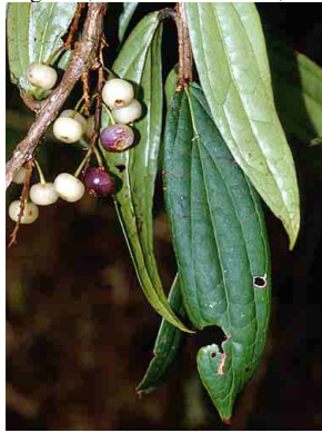
62 Thibaudia ERICACEAE