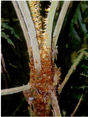
166 Cyathea PTERIDOPHYTA