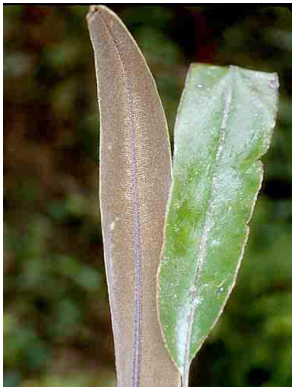
171 Elaphoglossum PTERIDOPHYTA