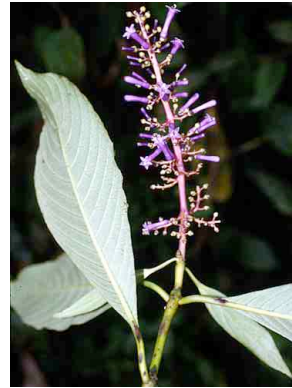
129 Palicourea RUBIACEAE