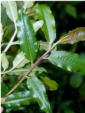
151 Freziera THEACEAE