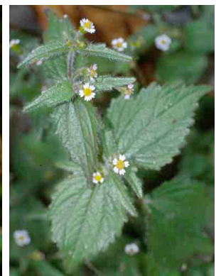
20 Galinsoga ASTERACEAE