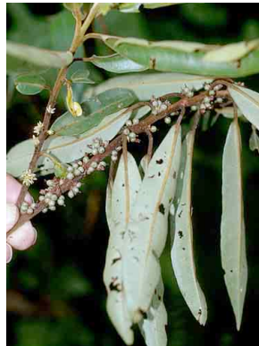
93 Myrsine MYRSINACEAE