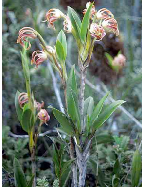
102 Maxillaria ORCHIDACEAE