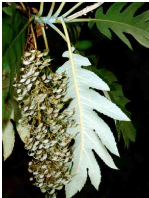
106 Bocconia PAPAVERACEAE