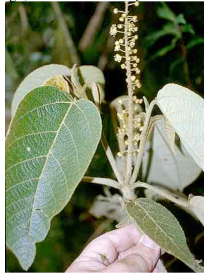
63 Croton EUPHORBIACEAE