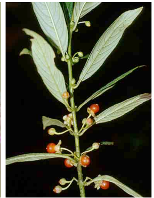
70 Besleria GESNERIACEAE