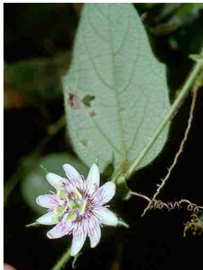
107 Passiflora PASSIFLORACEAE