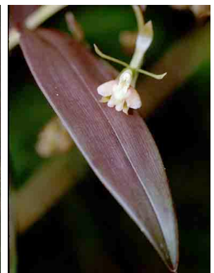
100 Epidendrum ORCHIDACEAE