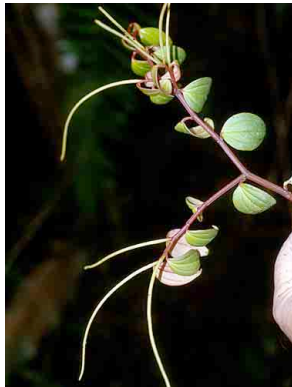
112 Peperomia PIPERACEAE