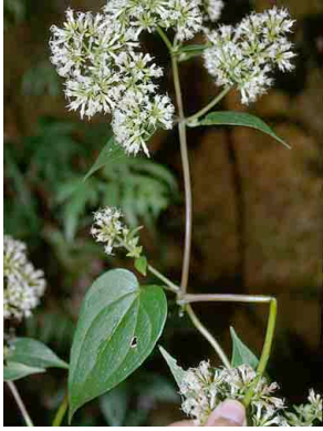
21 Mikania ASTERACEAE