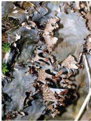
198 Peltigera LICHEN