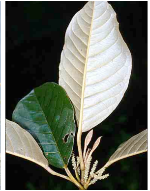
65 Hyeronima EUPHORBIACEAE