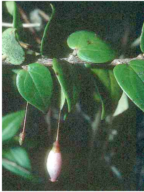
61 Sphyrnospermum ERICACEAE