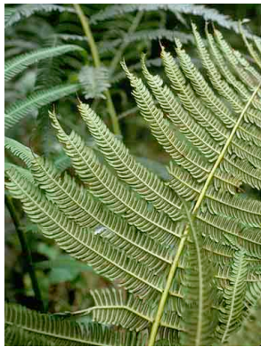
188 Thelypteris PTERIDOPHYTA