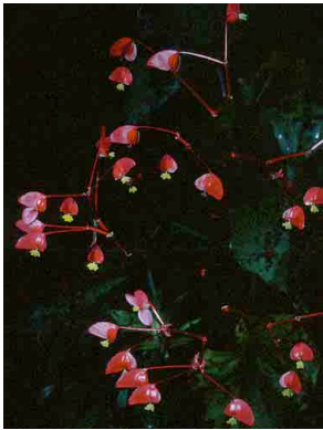
31 Begonia BEGONIACEAE