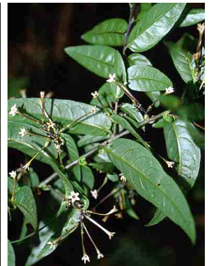
140 Cestrum SOLANACEAE