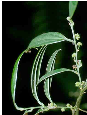
138 Smilax SMILACACEAE