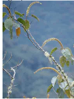
64 Croton EUPHORBIACEAE