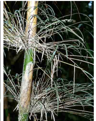
115 Guadua POACEAE