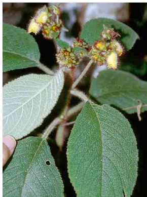
72 Pearcea GESNERIACEAE