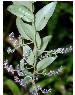
120 Momina POLYGALACEAE