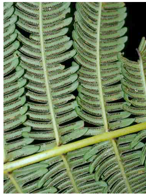
189 Thelypteris PTERIDOPHYTA