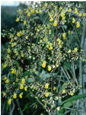
136 Calceolaria SCROPHULARIACEAE