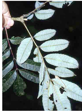
53 Weinmannia CUNONIACEAE