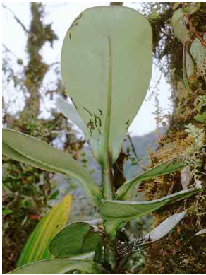
51 Clusia CLUSIACEAE