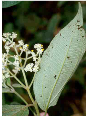
88 Miconia MELASTOMATACEAE