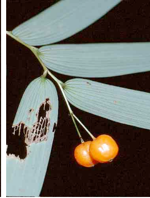
4 Bomarea ALSTROEMERIACEAE