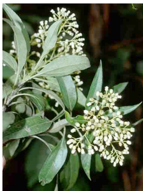
17 Baccharis ASTERACEAE