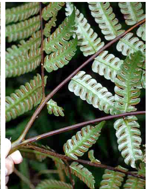
180 Pteris PTERIDOPHYTA