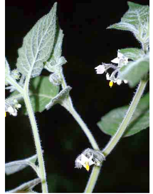
145 Solanum SOLANACEAE