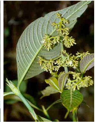
130 Psychotria RUBIACEAE