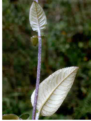
23 Oritrophium ASTERACEAE