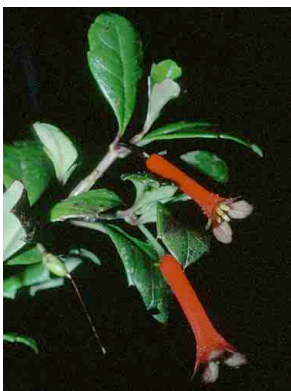
76 Desfontainea LOGANIACEAE