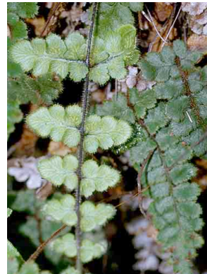
174 Eriosorus PTERIDOPHYTA