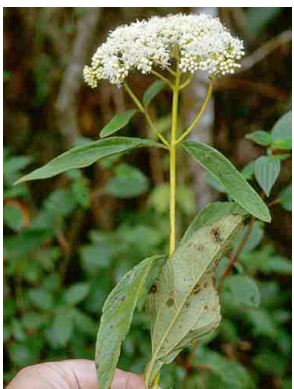
16 Baccharis ASTERACEAE