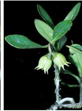
49 Clusia CLUSIACEAE