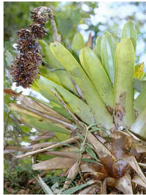
33 Guzmania BROMELIACEAE