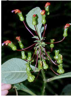
42 Centropogon CAMPANULACEAE