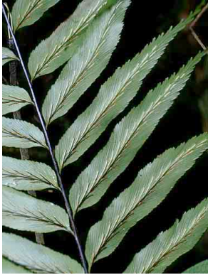
161 Asplenium PTERIDOPHYTA

[RRC@fmnh.org] Rapid Color Guide # 92 version 1.1