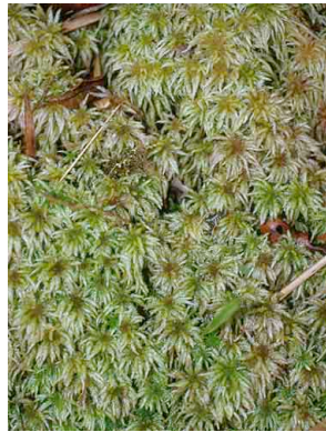
194 Sphagnum BRYOPHYTA