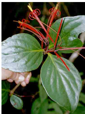
77 Aetanthus LORANTHACEAE