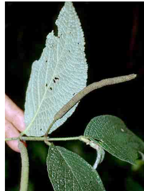
114 Piper PIPERACEAE