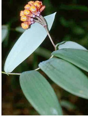
2 Bomarea ALSTROEMERIACEAE