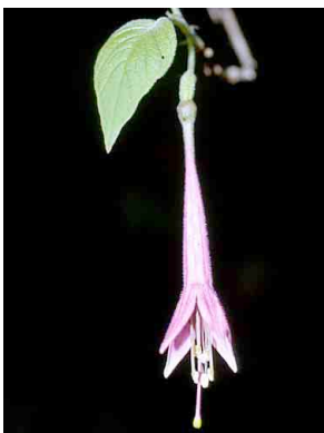
96 Fuchsia ONAGRACEAE