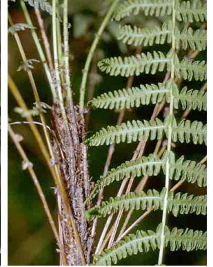
165 Cyathea PTERIDOPHYTA