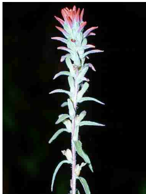
137 Castilleja SCROPHULARIACEAE