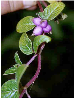
126 Coccocypselum RUBIACEAE