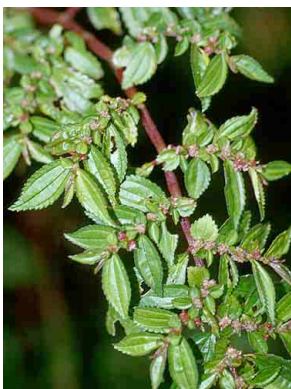
156 Pilea URTICACEAE