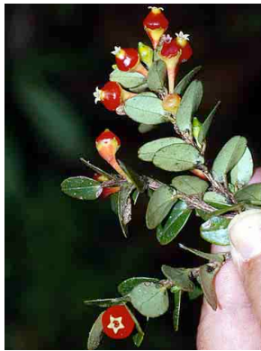
57 Demosthenesia ERICACEAE