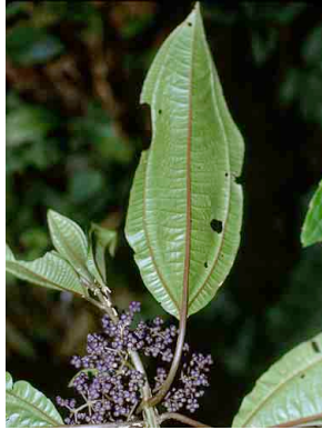
82 Miconia MELASTOMATACEAE