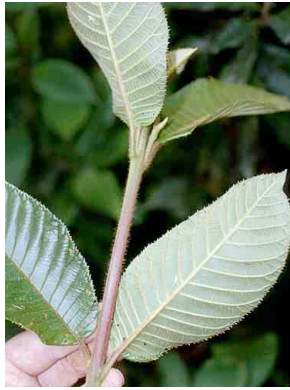
47 Clethra CLETHRACEAE