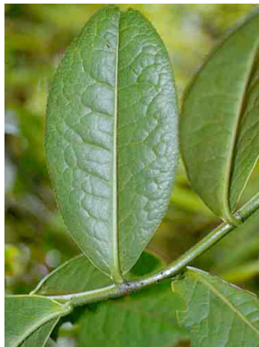
148 Symplocos SYMPLOCACEAE