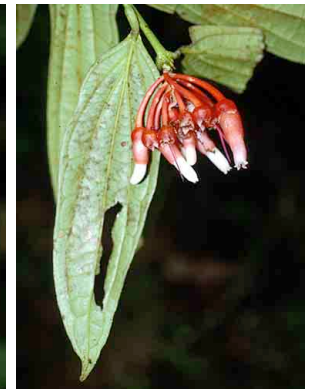
60 Psammisia ERICACEAE