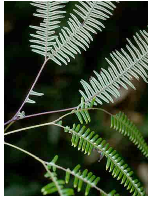
185 Sticherus PTERIDOPHYTA