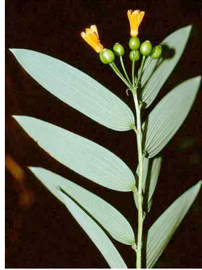
3 Bomarea ALSTROEMERIACEAE