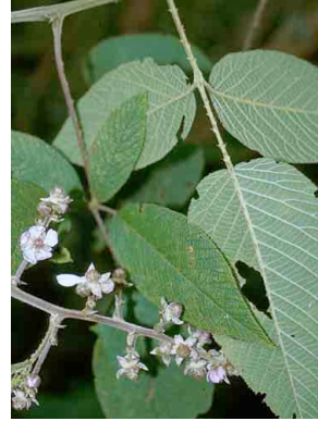
124 Rubus ROSACEAE