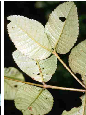
54 Weinmannia CUNONIACEAE