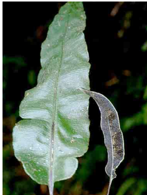
172 Elaphoglossum PTERIDOPHYTA