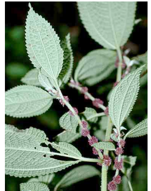
155 Phenax URTICACEAE