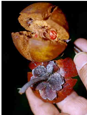
152 Ternstroemia THEACEAE