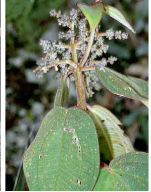
85 Miconia MELASTOMATACEAE