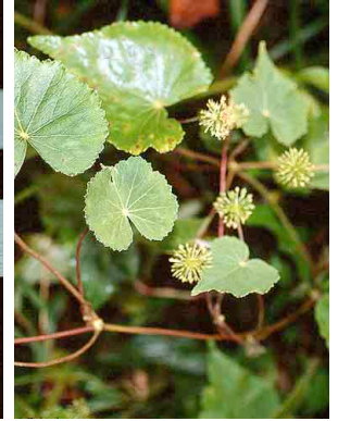
5 Hydrocotyle APIACEAE