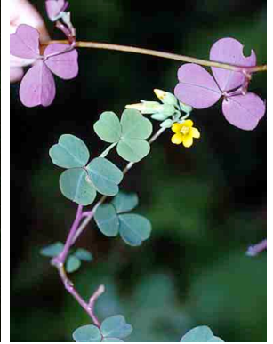
105 Oxalis OXALIDACEAE