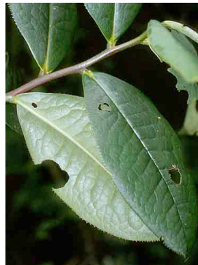
149 Symplocos SYMPLOCACEAE