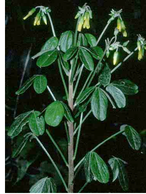
104 Oxalis OXALIDACEAE