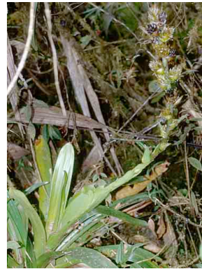
34 Guzmania BROMELIACEAE