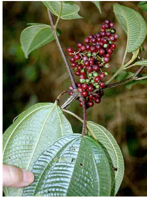
87 Miconia MELASTOMATACEAE