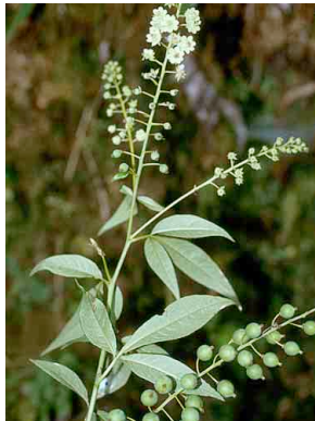
153 Tovaria TOVARIACEAE