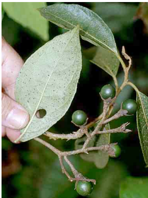
146 Solanum SOLANACEAE