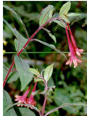
94 Fuchsia ONAGRACEAE