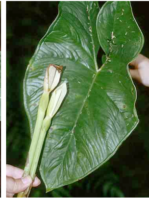
9 Xanthosoma ARACEAE