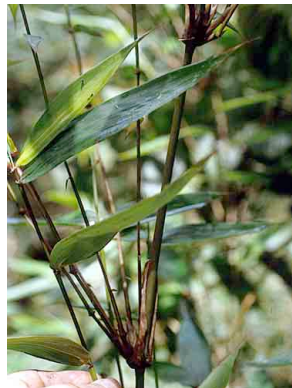
118 Guadua POACEAE