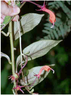
41 Centropogon CAMPANULACEAE

© Environmental & Conservation Programs, The Field Museum, Chicago, IL 60605 USA. [RRC@fmnh.org] Rapid Color Guide # 92 version 1.1