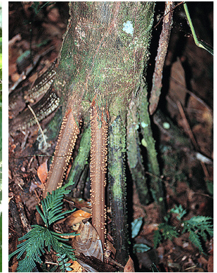
40 Wettinia augusta ponilla