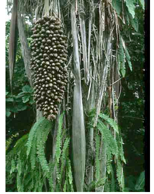
5 Attalea butyracea shebon