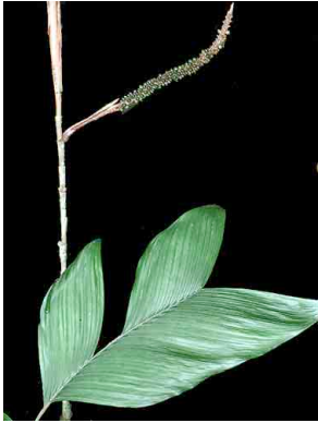
26 Geonoma stricta palmiche