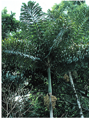
37 Socratea exorrhiza cashapona