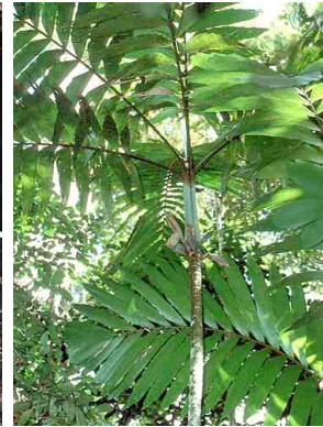
39 Wettinia augusta ponilla