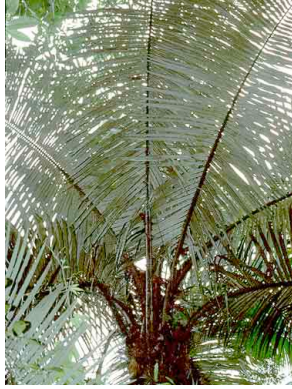
2 Astrocaryum murumuru ungurauí