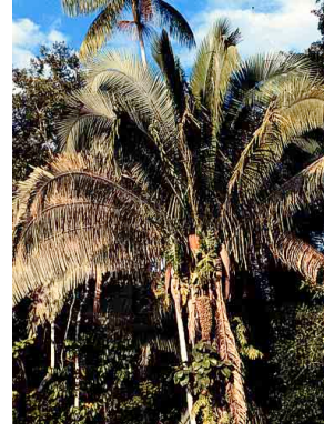
4 Attalea butyracea shebon