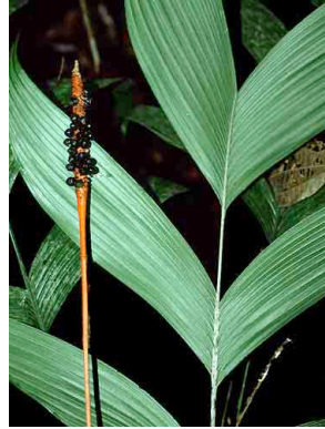
23 Geonoma macrostachys palmiche