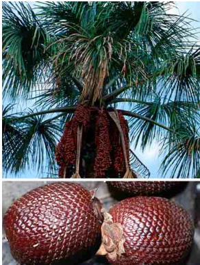
31 Mauritia flexuosa aguaje