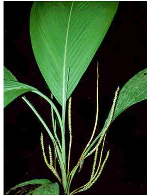
13 Chamaedorea pauciflora sangapilla