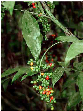
16 Desmoncus orthacanthos vara casha