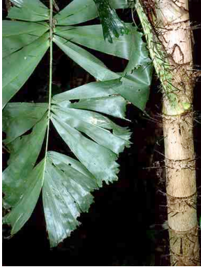
1 Aiphanes aculeata chontilla