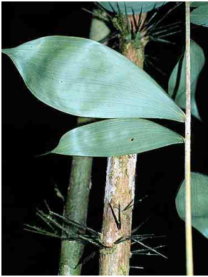
11 Bactris maraja ñejilla