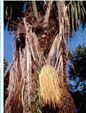
34 Oenocarpus bataua ungurauí