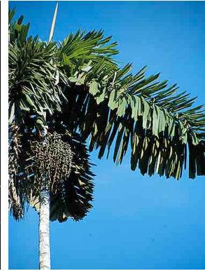
29 Iriartea deltoidea pona