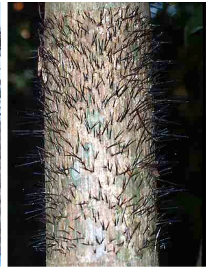
10 Bactris gasipaes pijuayo