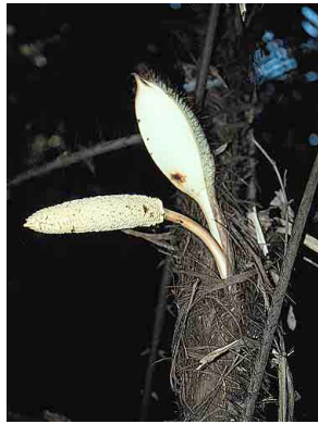
8 Bactris concinna ñejilla