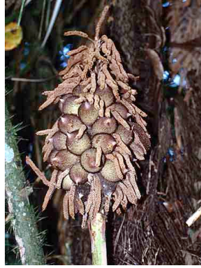
3 Astrocaryum murumuru ungurauí