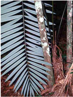
36 Oenocarpus mapora sinami / sinamillo