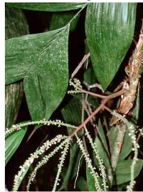
19 Geonoma cf. aspidifolia palmiche macho