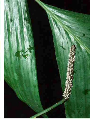
24 Geonoma cf. macrostachys palmiche