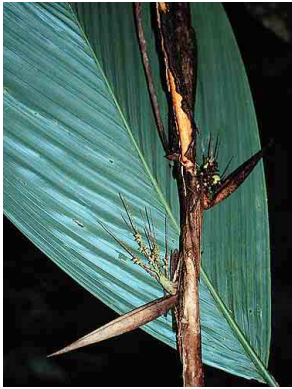
12 Bactris simplicifrons ñejilla