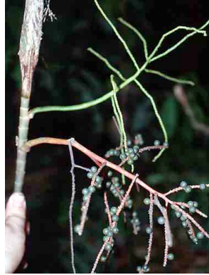
22 Geonoma deversa crisñeja / palmiche