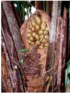
7 Attalea phalerata shapaja