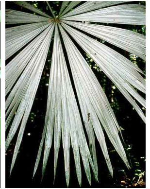
15 Chelyocarpus ulei sacha aguajillo