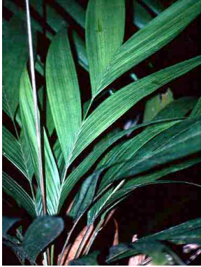
21 Geonoma deversa crisñeja / palmiche

Photos by R. Foster & H. Betz, & a few by M. Metz, T. Wachter, T. Plowman Produced by: R. Foster, H. Betz, M. Metz. Support from ACCA and the Andrew Mellon Foundation. © Environmental & Conservation Programs, The Field Museum, Chicago, IL 60605 USA. [RRC@fmnh.org] Rapid Color Guide # 83 version 1.0