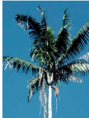
33 Oenocarpus bataua ungurauí