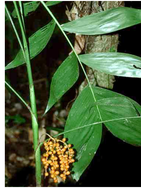
14 Chamaedorea pinnatifrons cashipana