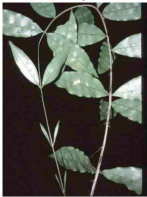
17 Desmoncus orthacanthos vara casha