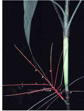
28 Hyospathe elegans palmicho