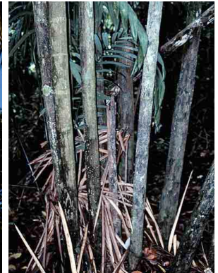
35 Oenocarpus mapora sinami / sinamillo