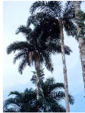
9 Bactris gasipaes pijuayo