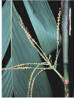
27 Hyospathe elegans palmicho