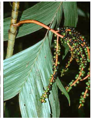
20 Geonoma cf. aspidifolia palmiche macho