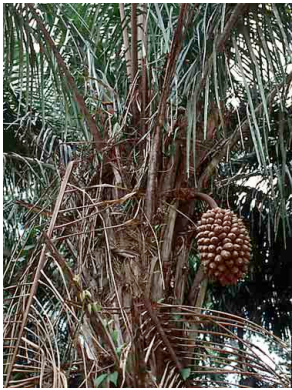
6 Attalea phalerata shapaja