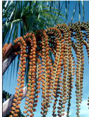
32 Mauritia flexuosa aguaje