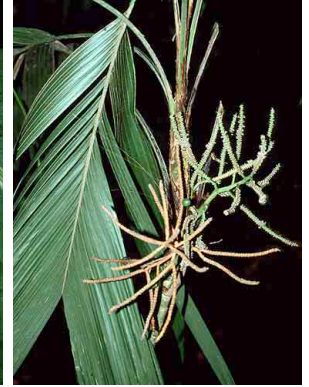
25 Geonoma maxima palmiche