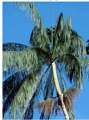
18 Euterpe precatoria huasai