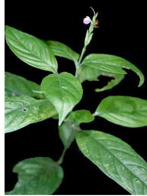
3 Justicia ACANTHACEAE