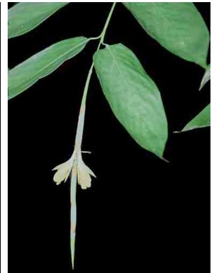
70 Ischnosiphon MARANTACEAE