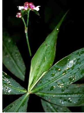
24 Tradescantia zanonii COMMELINACEAE