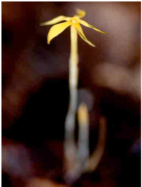
46 Voyria GENTIANACEAE