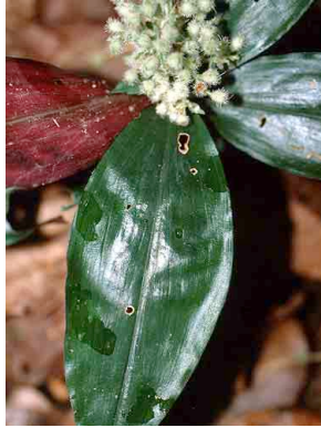
23 Floscopa peruviana COMMELINACEAE