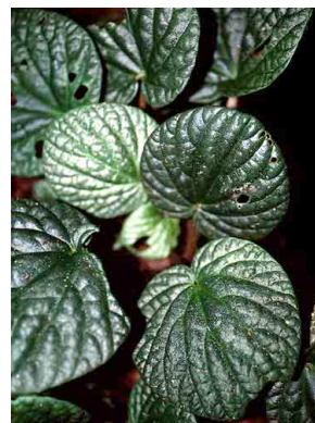
79 Peperomia PIPERACEAE