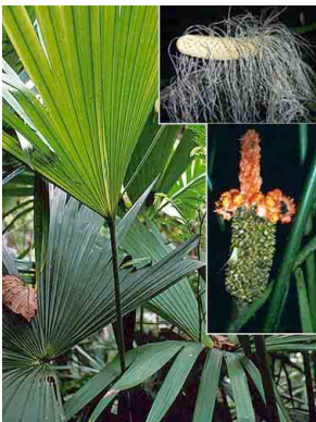
31 Carludovica palmata CYCLANTHACEAE