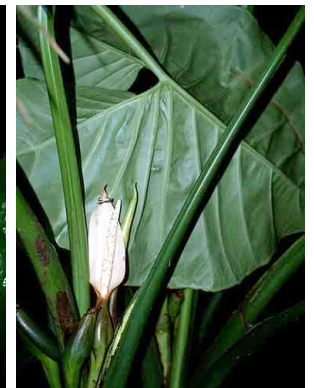
15 Xanthosoma ARACEAE