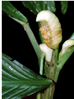
68 Hylaeante unilateralis MARANTACEAE