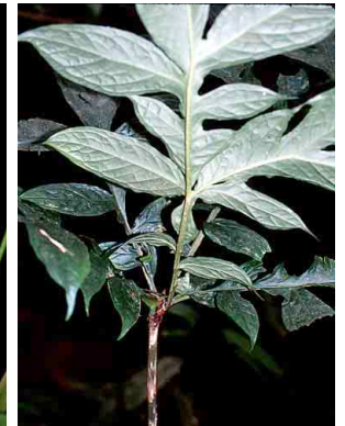
10 Dracontium lorentense ARACEAE