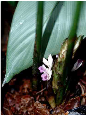
66 Calathea MARANTACEAE