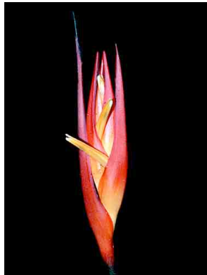
48 Heliconia densiflora HELICONIACEAE