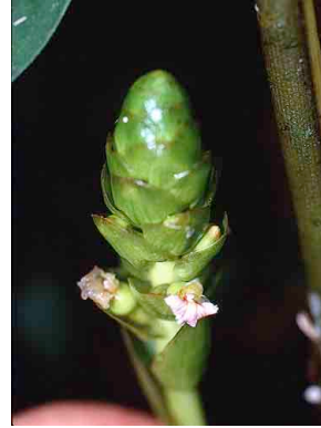
104 Renealmia ZINGIBERACEAE