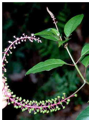
78 Phytolacca rivinoides PHYTOLACCACEAE