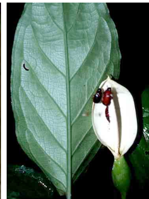
14 Xanthosoma vivipera ARACEAE