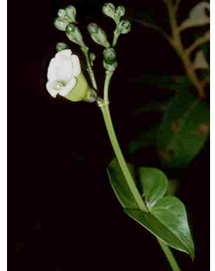
45 Chelonanthus alatus GENTIANACEAE