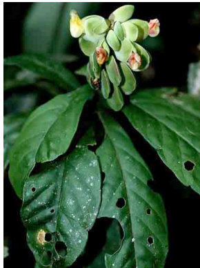
87 Polygala gigantea POLYGALACEAE