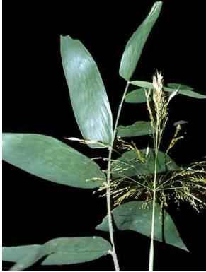
81 Olyra lorentensis POACEAE