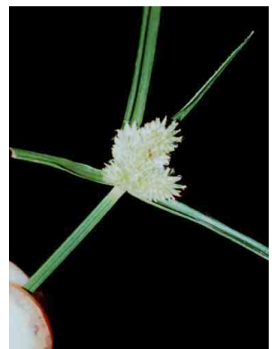
40 Kyllinga pumila CYPERACEAE