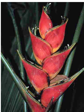
57 Heliconia stricta HELICONIACEAE