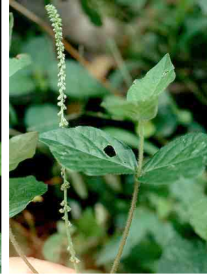
4 Cyathula prostrata AMARANTHACEAE