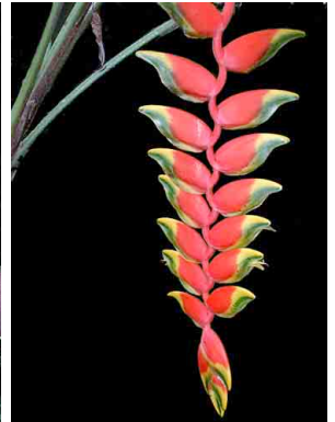
55 Heliconia rostrata HELICONIACEAE