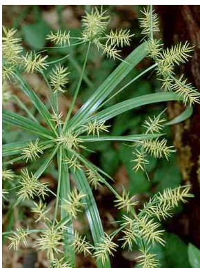
37 Cyperus odoratus CYPERACEAE