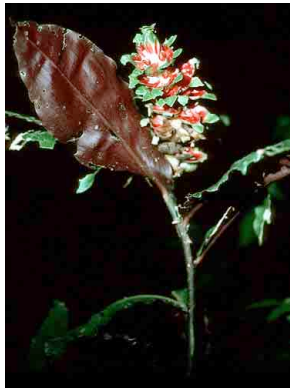
28 Costus COSTACEAE