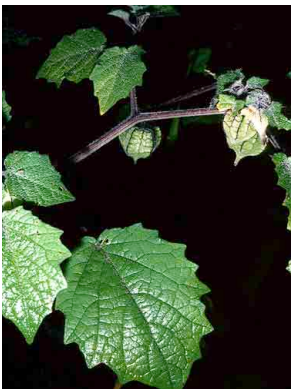
96 Physalis SOLANACEAE