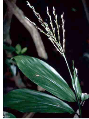
84 Pharus latifolius POACEAE