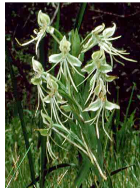
74 Habenaria ORCHIDACEAE