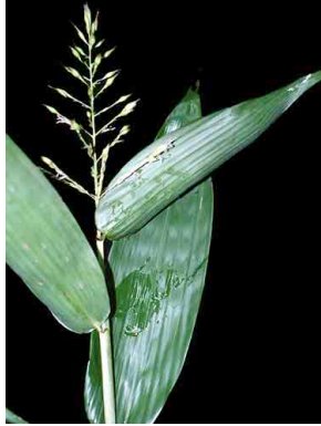
82 Olyra latifolia POACEAE