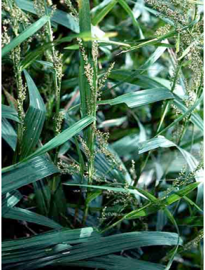
41 Scleria microcarpa CYPERACEAE