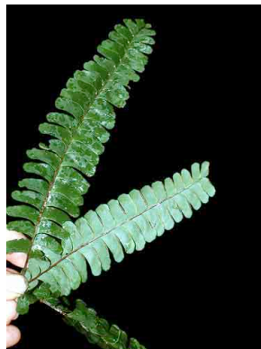
113 Lindsaea PTERIDOPHYTA