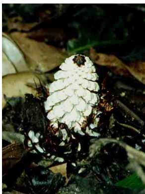
17 Lophophytum mirabile BALANOPHORACEAE