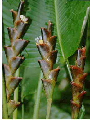
63 Calathea lutea MARANTACEAE