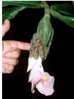
29 Costus COSTACEAE