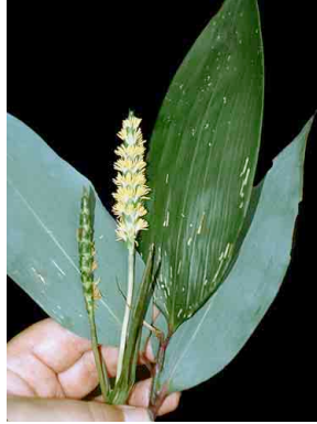
83 Pariana bicolor POACEAE