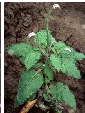
19 Heliotropium indicum BORAGINACEAE