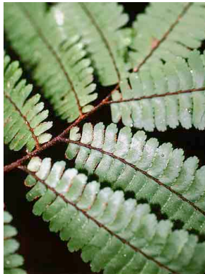
107 Adiantum PTERIDOPHYTA