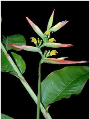
51 Heliconia hirsuta HELICONIACEAE