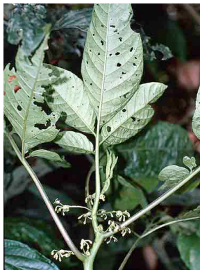
98 Solanum SOLANACEAE