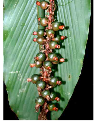
105 Renealmia ZINGIBERACEAE