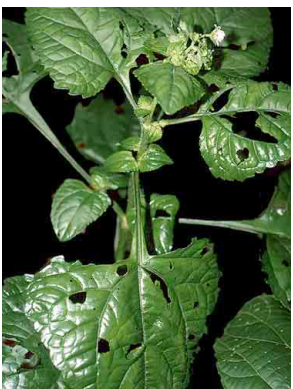
16 Adenostemma ASTERACEAE