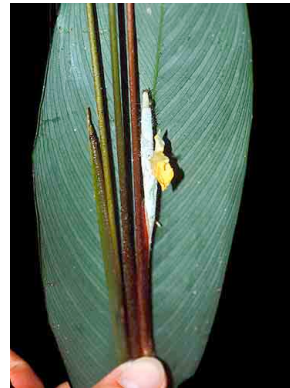
69 Ischnosiphon hirsutus MARANTACEAE