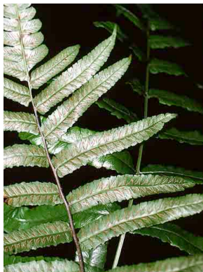
112 Diplazium PTERIDOPHYTA