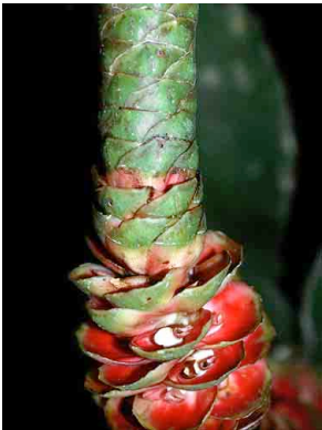
26 Costus scaber COSTACEAE