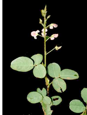
44 Desmodium FABACEAE