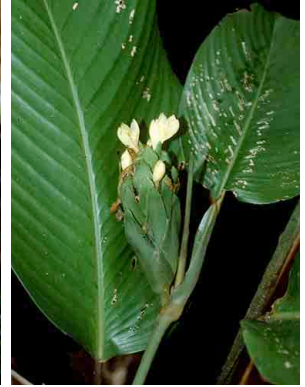
65 Calathea MARANTACEAE