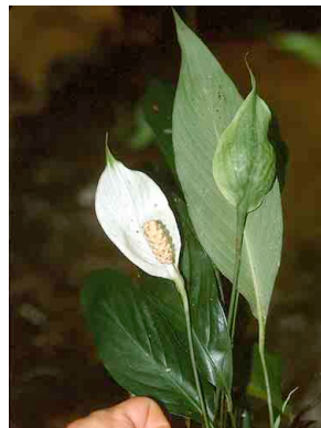
13 Spathiphyllum lechlerianum ARACEAE