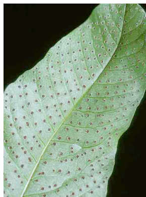
118 Tectaria incisa PTERIDOPHYTA