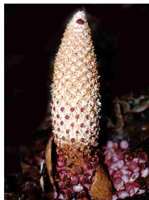
18 Ombrophytum BALANOPHORACEAE