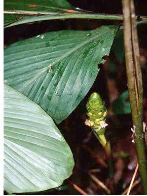
103 Renealmia ZINGIBERACEAE