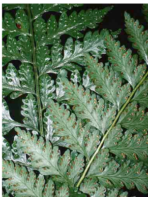
116 Saccoloma PTERIDOPHYTA