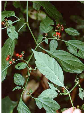
93 Capsicum coccineum SOLANACEAE