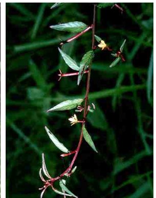
75 Ludwigia ONAGRACEAE