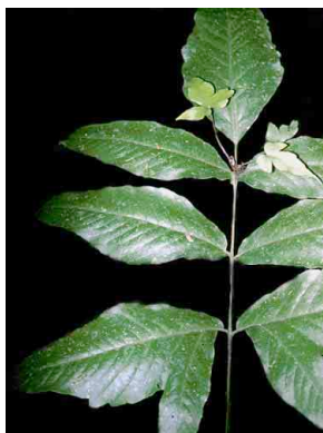
117 Tectaria incisa PTERIDOPHYTA