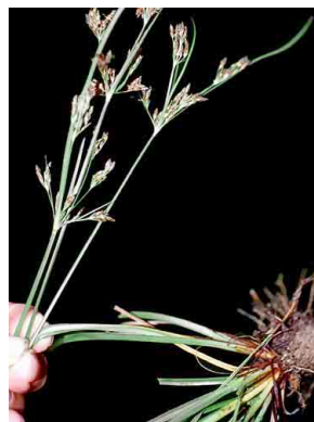
39 Fimbristylis dichotoma CYPERACEAE