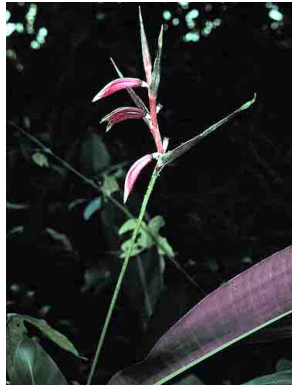
54 Heliconia metallica HELICONIACEAE