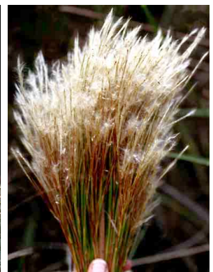
80 Andropogon POACEAE