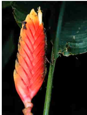
49 Heliconia episcopalis HELICONIACEAE