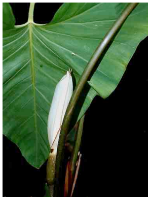
12 Philodendron ARACEAE