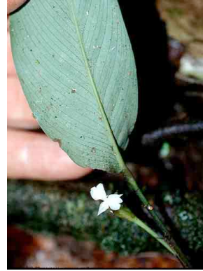
64 Calathea micans MARANTACEAE