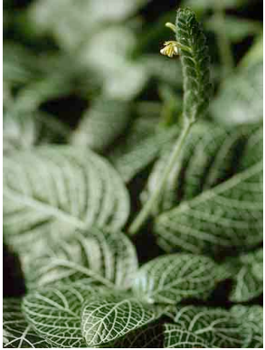
1 Fittonia ACANTHACEAE

Producido por: R. Foster, H. Betz, M. Metz, con el apoyo de ACCA y el Andrew Mellon Foundation. [RRC@fmnh.org] Rapid Color Guide # 82 version 1.0