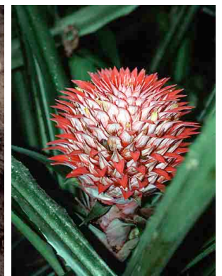
20 Aechmea fernandae BROMELIACEAE