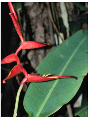
56 Heliconia spathocircinnata HELICONIACEAE