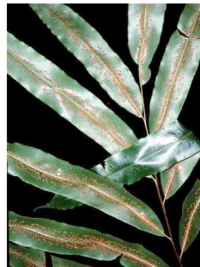
114 Metaxya rostrata PTERIDOPHYTA