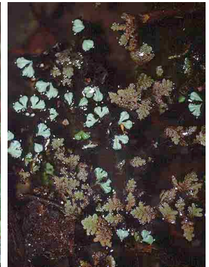
110 Azolla (& Ricciocarpus) PTERIDOPHYTA