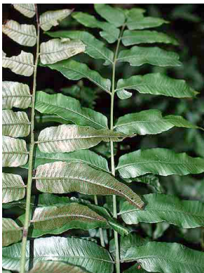
111 Diplazium PTERIDOPHYTA