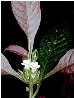
47 Nautilocalyx GESNERIACEAE