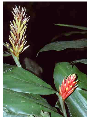
99 Renealmia cernua ZINGIBERACEAE