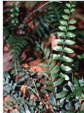
109 Asplenium PTERIDOPHYTA