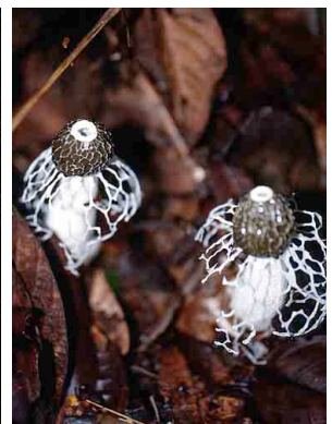
120 Dictyophora indusiata FUNGI