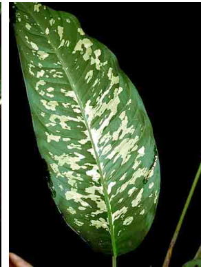
9 Dieffenbachia ARACEAE