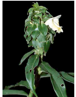
30 Costus COSTACEAE