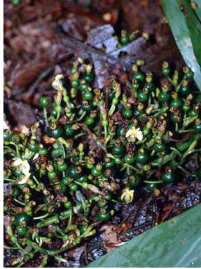
102 Renealmia floribunda ZINGIBERACEAE