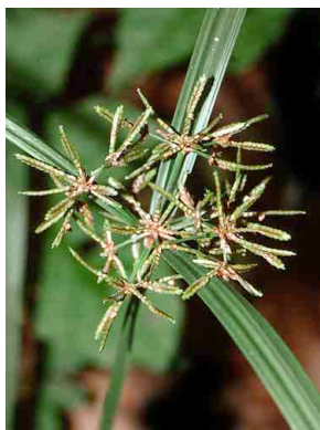
38 Cyperus CYPERACEAE