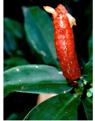
25 Costus scaber COSTACEAE