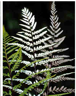
115 Pityrogramma calomelanos PTERIDOPHYTA