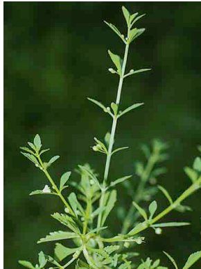
92 Scoparia dulcis SCROPHULARIACEAE