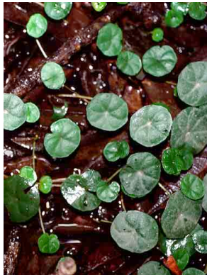
7 Hydrocotyle APIACEAE