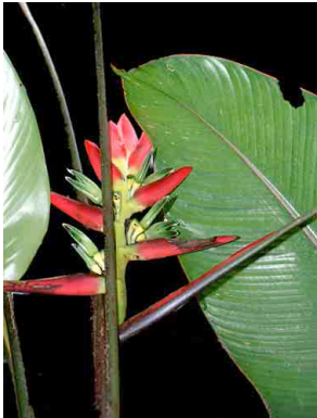
52 Heliconia lasiorachis HELICONIACEAE