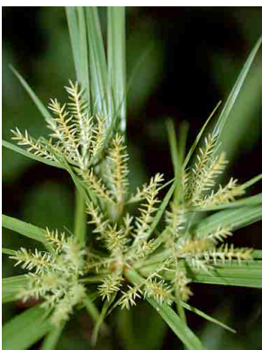
36 Cyperus odoratus CYPERACEAE