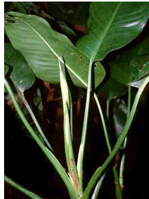
8 Dieffenbachia ARACEAE