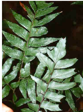
108 Adiantum PTERIDOPHYTA