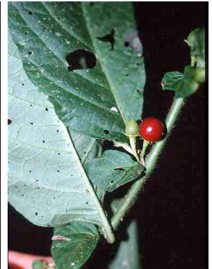
95 Lycianthes SOLANACEAE