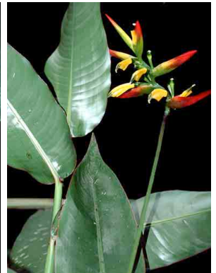
50 Heliconia hirsuta HELICONIACEAE