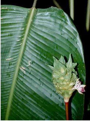
61 Calathea capitata MARANTACEAE

Photos by R. Foster & H. Betz, & a few by T. Plowman, M. Metz, T. Wachter. Produced by: R. Foster, H. Betz, M. Metz. Support from ACCA and the Andrew Mellon Foundation. © Environmental & Conservation Programs, The Field Museum, Chicago, IL 60605 USA. [RRC@fmnh.org] Rapid Color Guide # 82 version 1.0