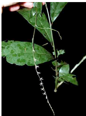
77 Petiveria alliacea PHYTOLACCACEAE