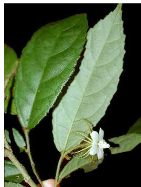
59 Pavonia oxyphyllaria MALVACEAE