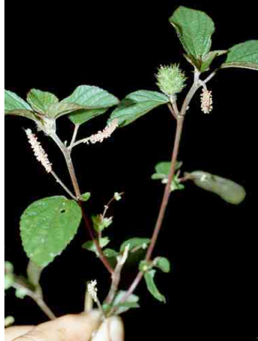
43 Acalypha arvensis EUPHORBIACEAE