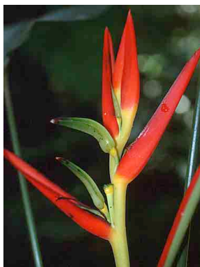
58 Heliconia velutina HELICONIACEAE