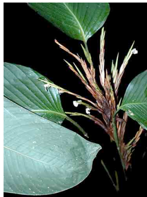
73 Monotagma MARANTACEAE