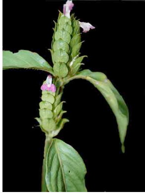
2 Justicia ACANTHACEAE