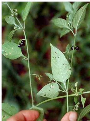
97 Solanum SOLANACEAE