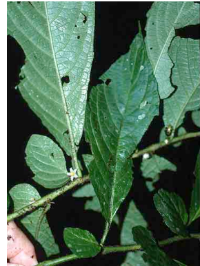
94 Lycianthes SOLANACEAE