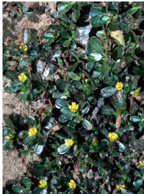
88 Portulaca PORTULACACEAE