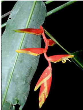
53 Heliconia marginata HELICONIACEAE