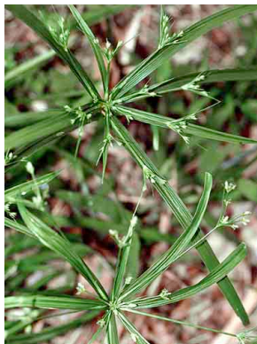
33 Cyperus laxus CYPERACEAE