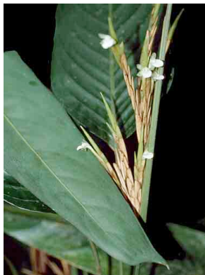
72 Monotagma MARANTACEAE