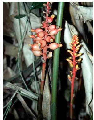
100 Renealmia thyrsoides ZINGIBERACEAE