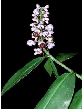
22 Dichorisandra ulei COMMELINACEAE