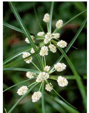
35 Cyperus luzulae CYPERACEAE