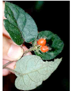
90 Geophila cordifolia RUBIACEAE