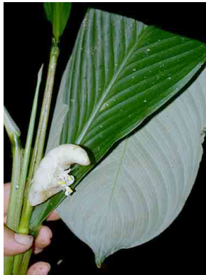
67 Hylaeante unilateralis MARANTACEAE