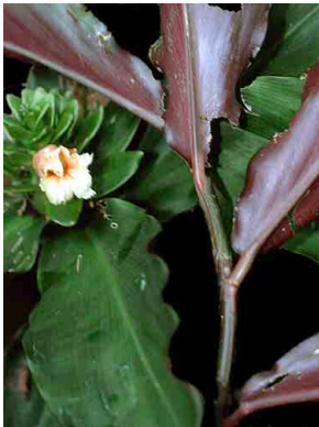
27 Costus COSTACEAE