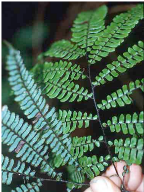
106 Adiantum PTERIDOPHYTA