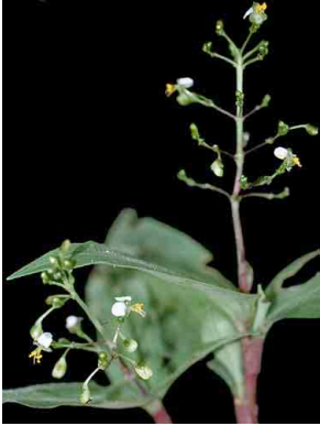
21 Aneilema umbrosum COMMELINACEAE