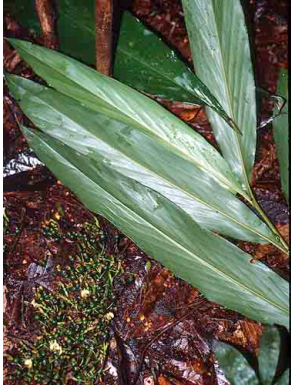
101 Renealmia floribunda ZINGIBERACEAE