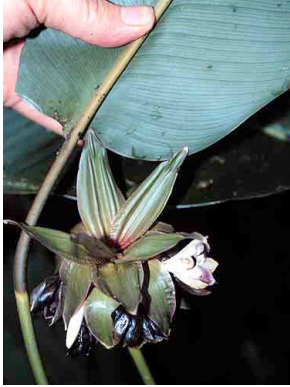
62 Calathea capitata MARANTACEAE