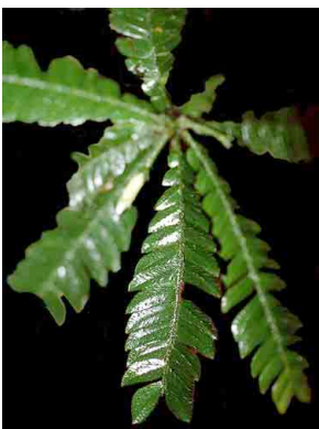
76 Biophytum OXALIDACEAE