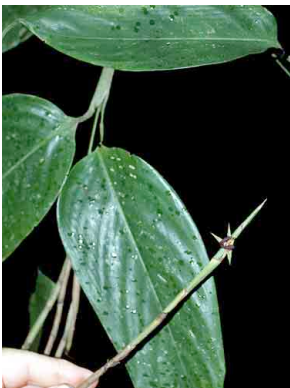
71 Ischnosiphon MARANTACEAE