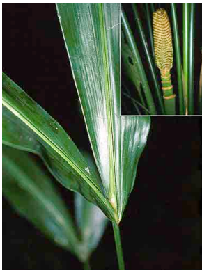
32 Cyclanthus bipartitus CYCLANTHACEAE