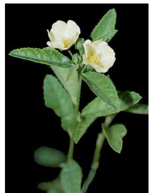
60 Sida MALVACEAE