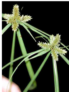
34 Cyperus ligularis CYPERACEAE