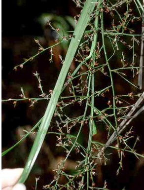
42 Scleria CYPERACEAE