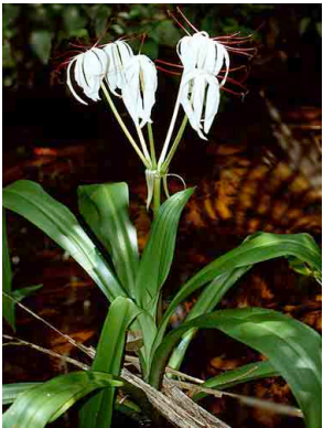
6 Crinum erubescens AMARYLLIDACEAE