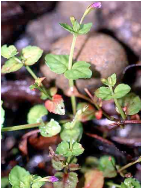
91 Lindernia SCROPHULARIACEAE