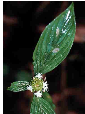
89 Borreria RUBIACEAE