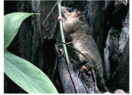
Micoureus demerarae El Refugio, Bolivia