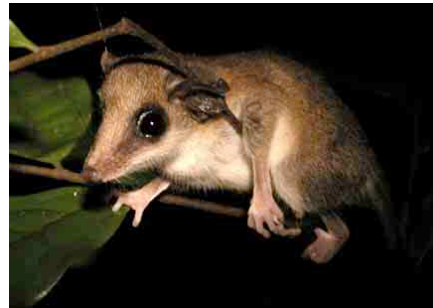
Marmosops cf parvidens Nouragues, French Guiana