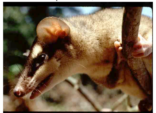
Metachirus nudicaudatus Rio Xingu, Brazil