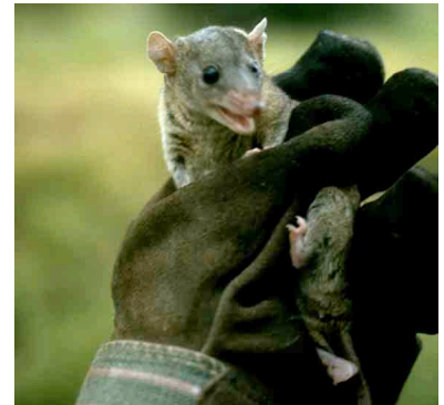
Monodelphis domestica Dept. Amambay, Paraguay (P. Myers)