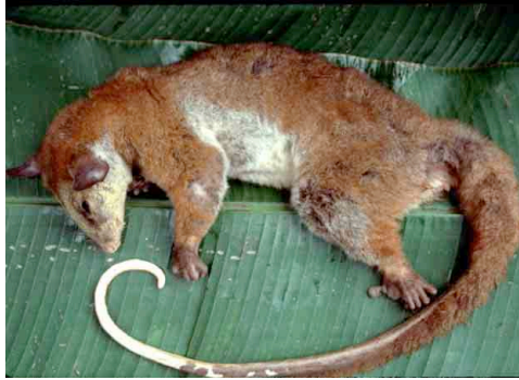
Caluromys lanatus pollen on head Rio Yasuni, Ecuador