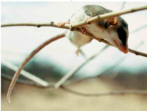
Thylamys pusilla Perforacion, Bolivia