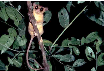
Micoureus cf regina Cocha Cashu, Peru