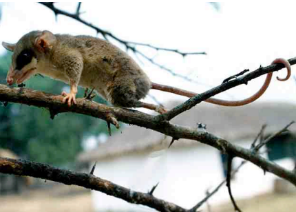
Marmosops dorothea El Refugio, Bolivia