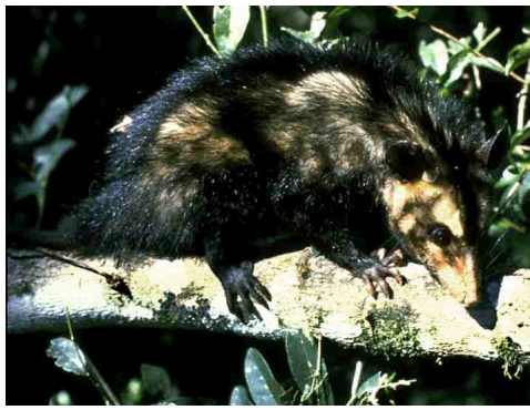
Didelphis aurita Curuguaty, Dept. Canindeyu, Paraguay (P. Myers)