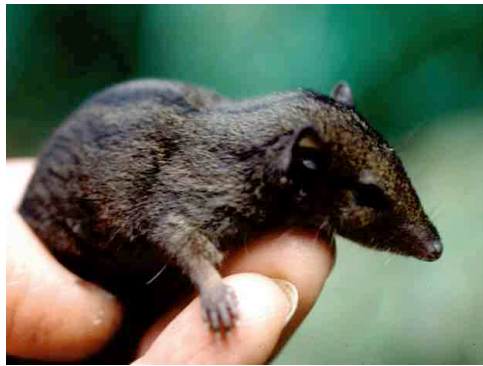
Monodelphis sp. Vilcabamba, Peru