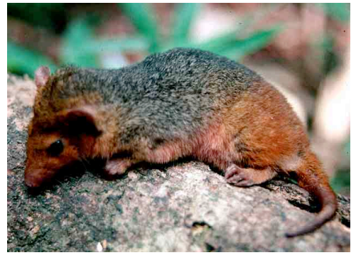
Monodelphis emiliae Pando, Bolivia