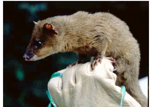
Lutreolina crassicaudata subadult Pampas del Heath, P eru