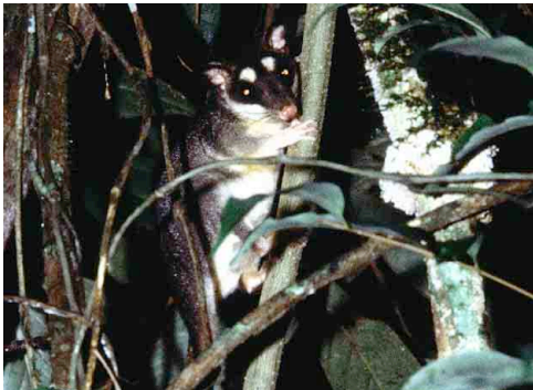
Philander opossum Cocha Cashu, Peru