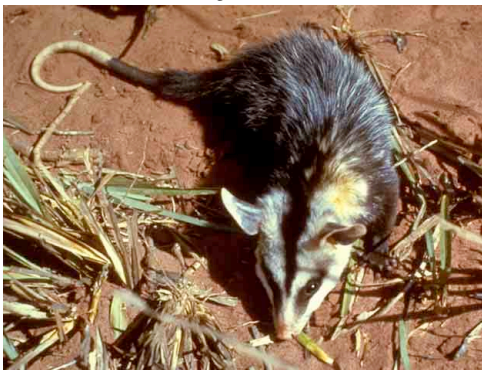
Didelphis albiventris Tobati, Dept. Cordillera, Paraguay