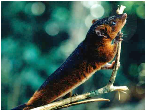
Monodelphis cf brevicaudata Rio Xingu, Brazil