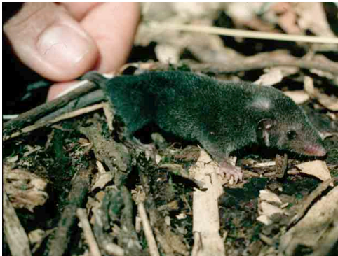
Monodelphis osgoodi Vilcabamba Peru