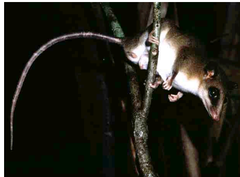
Marmosops noctivagus Cocha Cashu, Peru