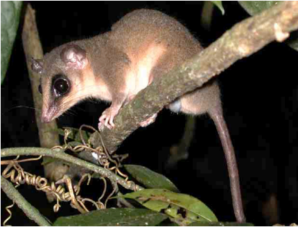
Marmosa murina Nouragues, French Guiana

Rapid Color Guide #76 version 1.1