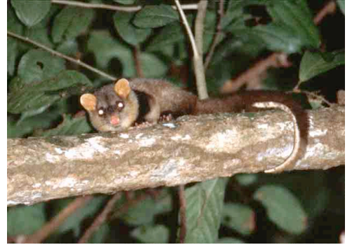
Caluromysiops irrupta Cocha Cashu, Peru