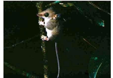
Marmosops bishopi Cocha Cashu, Peru