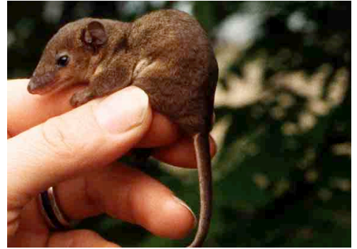
Monodelphis kunsi Flor de Oro, Bolivia