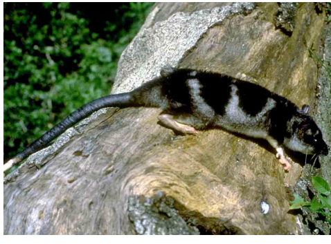
Chironectes minimus Ybycui, Dept. Paraguari, Paraguay (P. Myers)