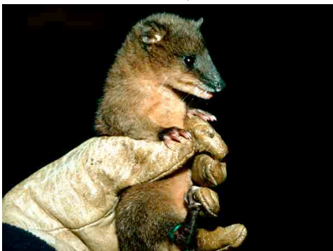
Lutreolina sp. juvenile Cerro Bufete, Bolivia