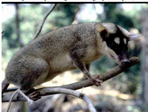
Metachirus nudicaudatus Rio Xingu, Brazil