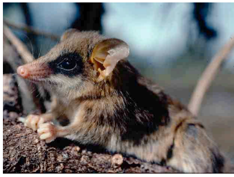
Gracilinanus aceramarcae Vilcabamba, Peru