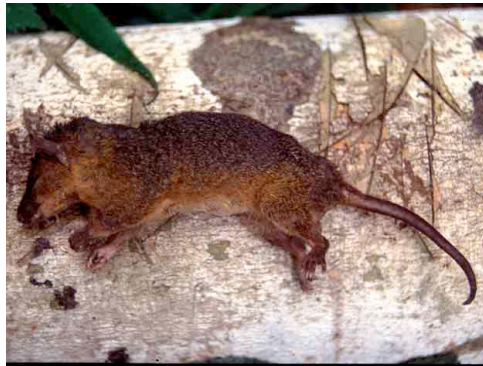
Monodelphis glirina Pando, Bolivia