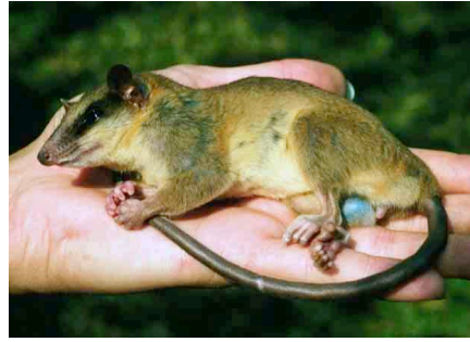
Marmosa robinsoni Cayos Cochinos, Honduras