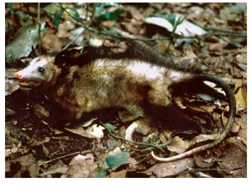
Didelphis marsupialis Cocha Cashu, Peru