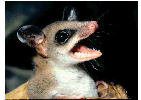
Marmosops noctivagus Cocha Cashu, Peru