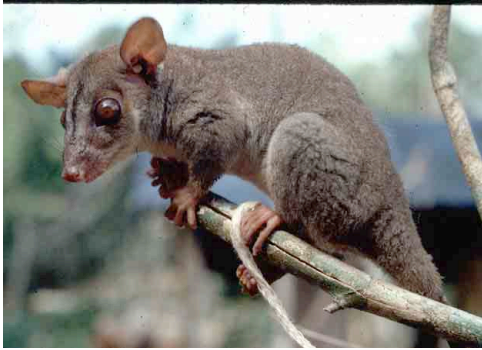
Caluromys philander Xingu, Brazil

© L. H. Emmons, P. Myers, y Environmental & Conservation Programs, The Field Museum, Chicago, IL 60605 [RRC@fmnh.org] USA. Rapid Color Guide #76 version 1.1