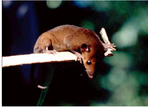
Monodelphis adusta Pampas del Heath, Peru