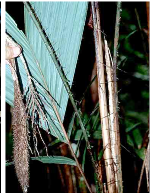
10 Bactris corossilla