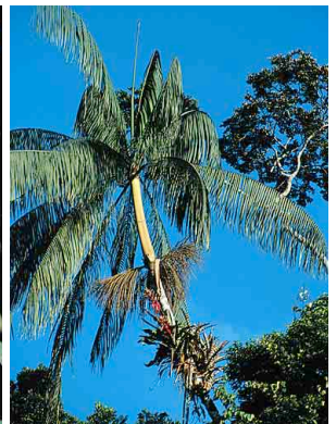
20 Euterpe precatória