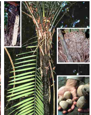
35 Phytelephas tenuicaulis