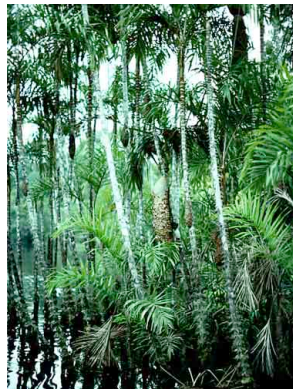
13 Bactris riparia