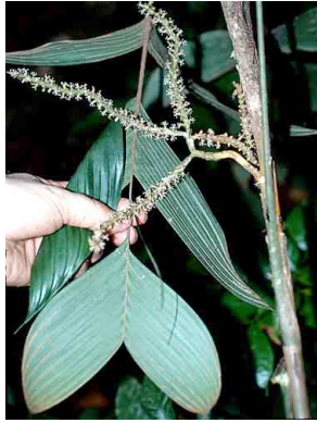
22 Geonoma aspidifolia cf.