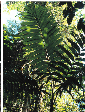
39 Wettinia maynensis