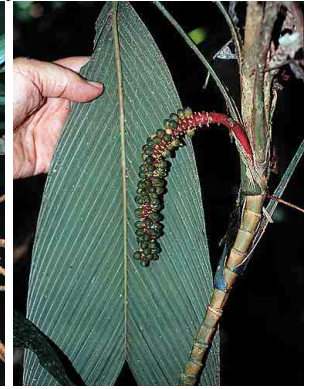
25 Geonoma (stricta) var. piscicauda