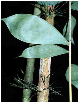
11 Bactris maraja