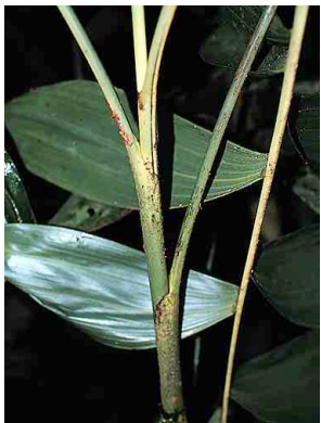
16 Chamaedorea pinnatifrons