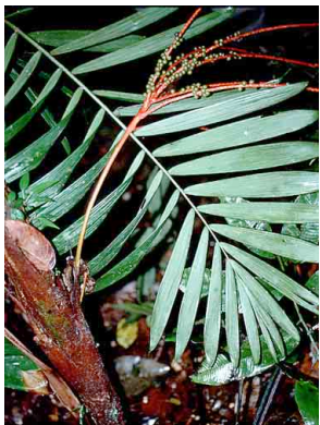
36 Prestoea schultzeana