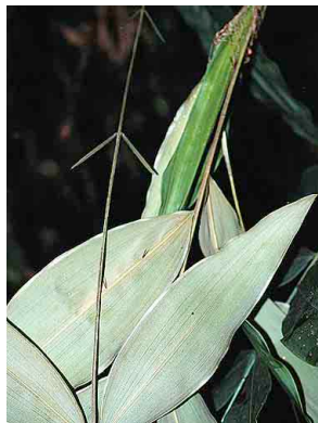
18 Desmoncus giganteus