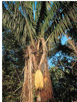
33 Oenocarpus bataua