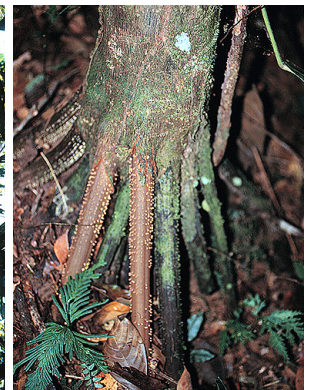
40 Wettinia maynensis