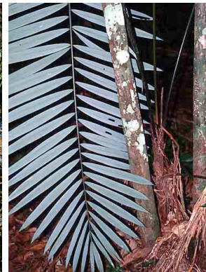
34 Oenocarpus mapora