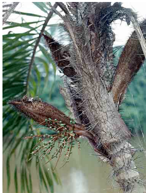
12 Bactris riparia