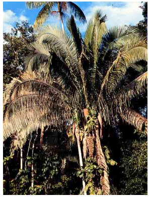
6 Attalea butyracea