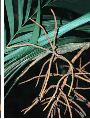
24 Geonoma maxima