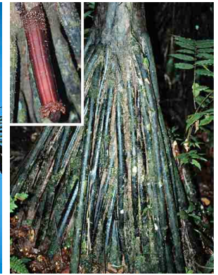
30 Iriartea deltoidea