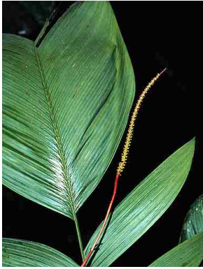
21 Geonoma brongniartii