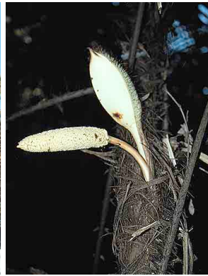
9 Bactris concinna