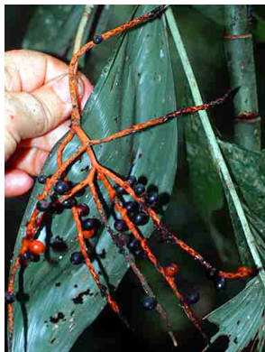
17 Chamaedorea pinnatifrons