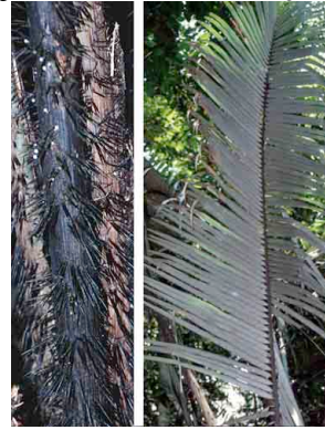
4 Astrocaryum (murumuru)