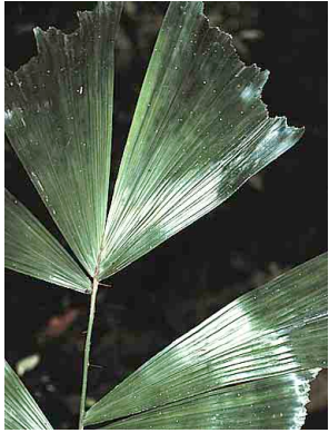
1 Aiphanes ulei

©Botanical Institute, Univ. Aarhus, Denmark and Environmental & Conservation Programs, The Field Museum, Chicago, IL 60605 USA. [RRC@fnnh.org] Rapid Color Guide # 57 version 1.1