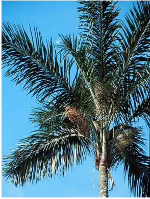
2 Astrocaryum chambira