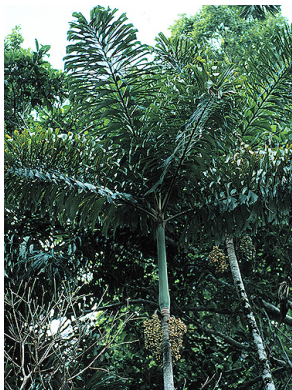
37 Socratea exorrhiza