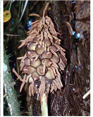
5 Astrocaryum (murumuru)