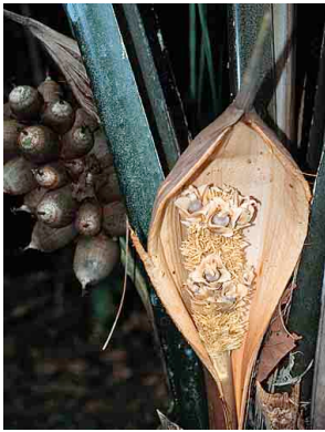
7 Attalea insignis