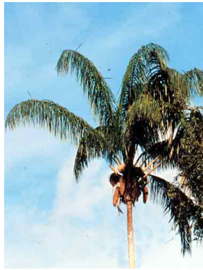
8 Attalea maripa