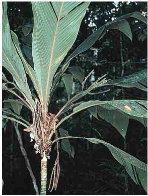
26 Geonoma triglochis