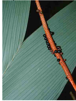
23 Geonoma macrostachys