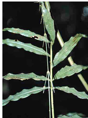
19 Desmoncus mitis