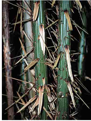
3 Astrocaryum chambira