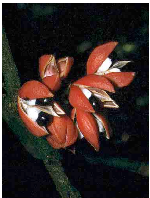
36 Paullinia turbacensis SAPINDACEAE