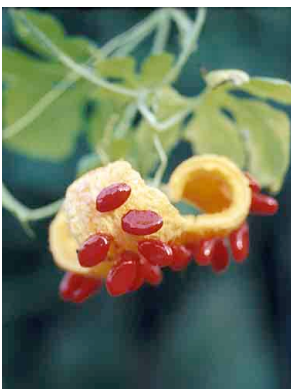
16 Momordica charantia CUCURBITACEAE