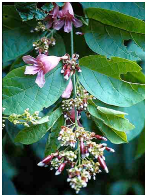
7 Arrabidaea patellifera BIGNONIACEAE