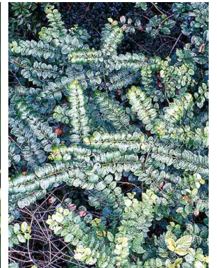
35 Uncaria tomentosa RUBIACEAE