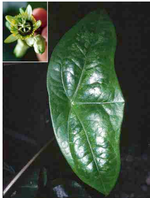
32 Passiflora coriacea PASSIFLORACEAE