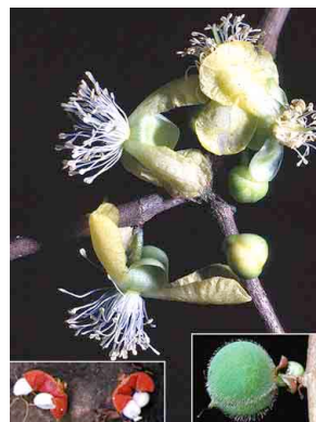
18 Doliocarpus olivaceus DILLENIACEAE