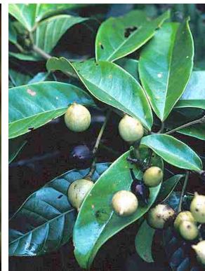
14 Maripa panamensis CONVOLVULACEAE