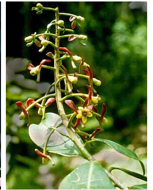
30 Souroubea sympetala MARCGRAVIACEAE