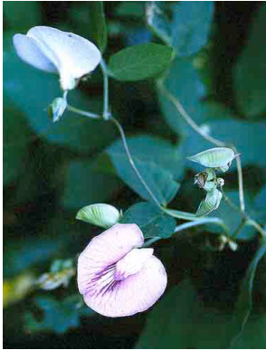
21 Centrosema molle FABACEAE

[www.fmn.org/plantguides] [RRC@fmn.org] Rapid Color Guide # 25 version 1.2