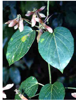
29 Stigmaphyllon MALPIGHACEAE