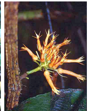
15 Gurania tubulosa CUCURBITACEAE