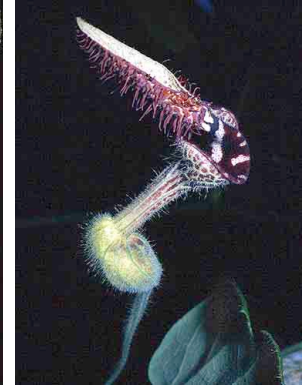
5 Aristolochia pilosa ARISTOLOCHIACEAE