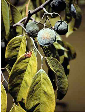
22 Dalbergia monetaria FABACEAE