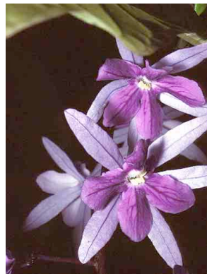
38 Petrea volubilis VERBENACEAE