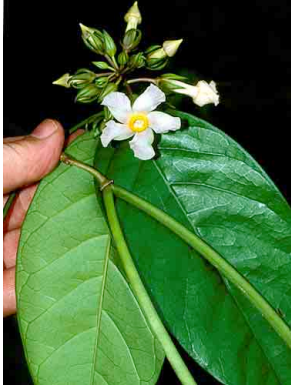
1 Prestonia portobellensis APOCYNACEAE

[www.fmnh.org/plantguides] [RRC@fmnh.org] Rapid Color Guide # 25 version 1.2