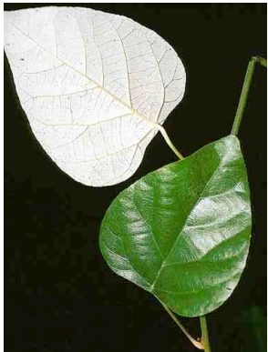
31 Chondrodendron tomentosum MENISPERMACEAE