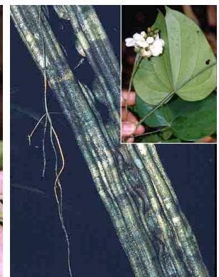
20 Bauhinia guianensis FABACEAE