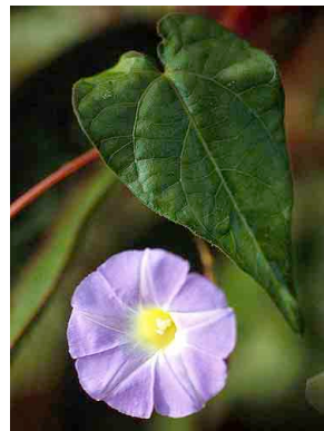
13 Ipomoea CONVOLVULACEAE