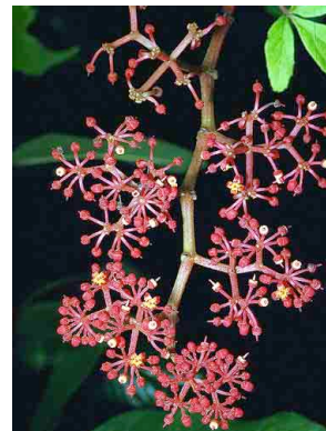
39 Cissus erosa VITACEAE