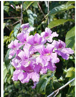
10 Phryganocydia corymbosa BIGNONIACEAE