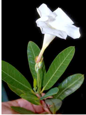
2 Rhabdadenia biflora APOCYNACEAE