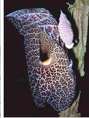
4 Aristolochia cordiflora ARISTOLOCHIACEAE