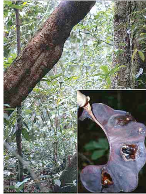
23 Entada monostachya FABACEAE