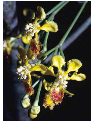
28 Mascagnia hippocrateoides MALPIGHACEAE