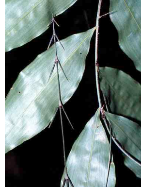
3 Desmoncus orthacanthos ARECACEAE