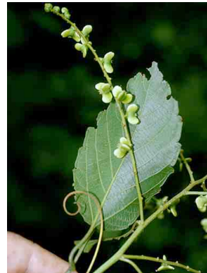
34 Gouania polygama RHAMNACEAE