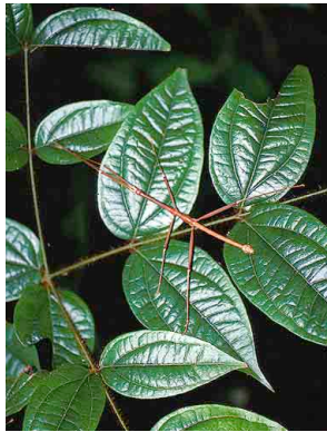
27 Strychnos toxifera LOGANIACEAE