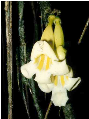
6 Anemopaegma chrysoleucum BIGNONIACEAE