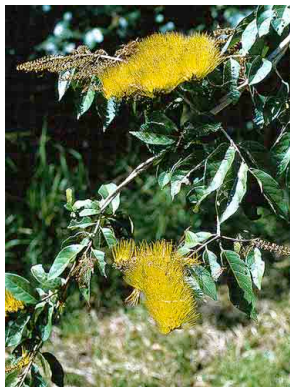
12 Combretum fruticosum COMBRETACEAE