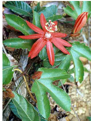
33 Passiflora vitifolia PASSIFLORACEAE