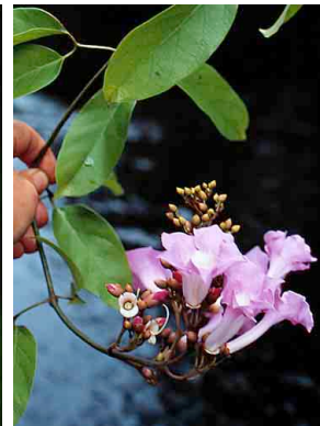
9 Paragonia pyramidata BIGNONIACEAE