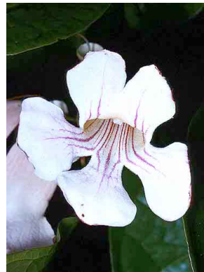
8 Cydista aequinoctialis BIGNONIACEAE