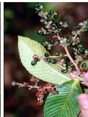
19 Tetracera portobellensis DILLENIACEAE