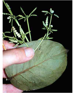
25 Gnetum leyboldii GNETACEAE