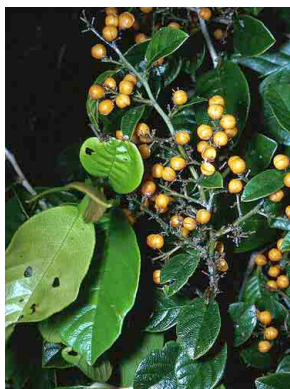
17 Davilla nitida DILLENIACEAE