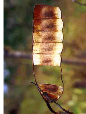
24 Entada polystachya FABACEAE