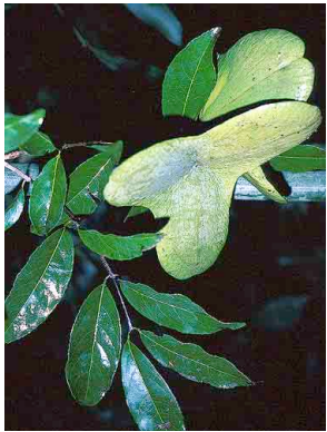
26 Anthodon panamense HIPPOCRATAEAE