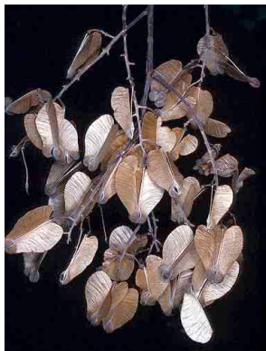
37 Serjania SAPINDACEAE