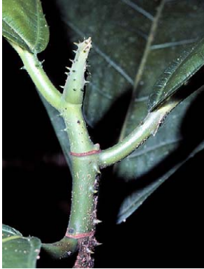
22 Poulsenia armata MORACEAE