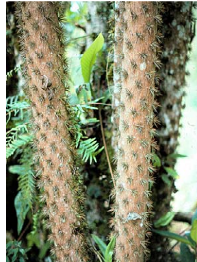
8 Barnadesia parviflora ASTERACEAE