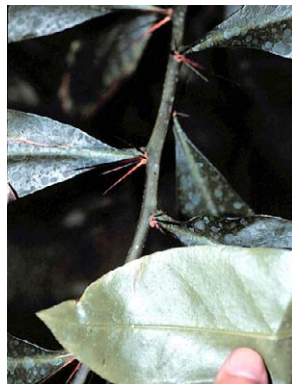
12 Pereskiaopsis aquosa CACTACEAE