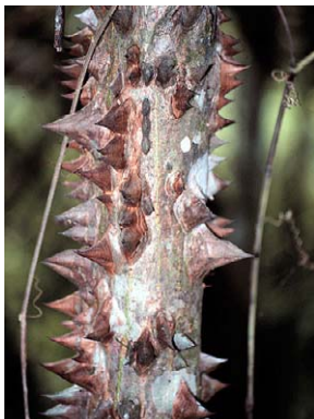
11 Pachira quinata (juv.) BOMBACACEAE