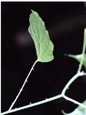
36 Byttneria aculeata STERCULIACEAE