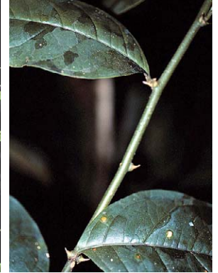
25 Seguiera PHYTOLACCACEAE