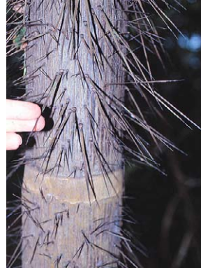
3 Astrocaryum standleyanum ARECACEAE