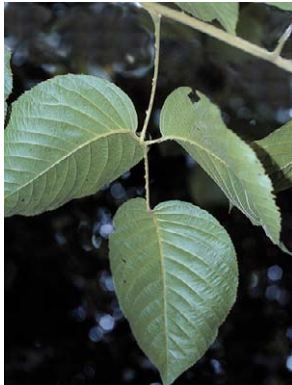
27 Rubus ROSACEAE