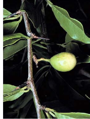
24 Ximenea americana OLACACEAE