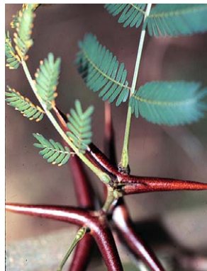
17 Acacia collinsii FABACEAE