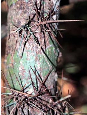
21 Xylosma chlorantha FLACOURTIACEAE

© Environmental & Conservation Programs, The Field Museum, Chicago, IL 60605 USA. [RRC@fmnh.org] Rapid Color Guide # 23 version 1.4