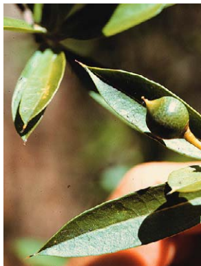
37 Jacquinia macrocarpa THEOPHRASTACEAE