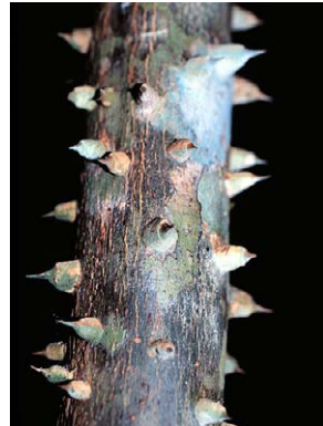
33 Zanthoxylum (juv.) RUTACEAE