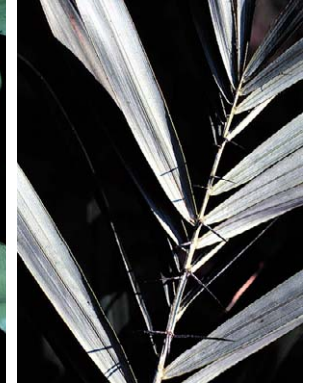
5 Bactris glaucescens ARECACEAE