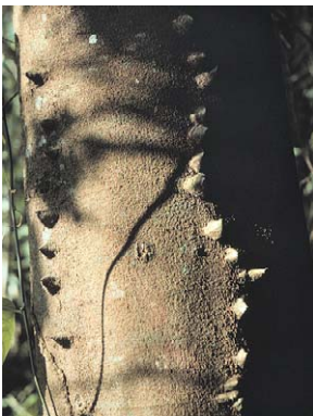
16 Acacia FABACEAE