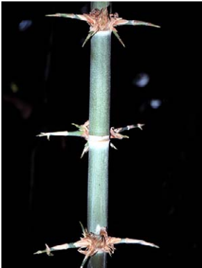
26 Guadua POACEAE