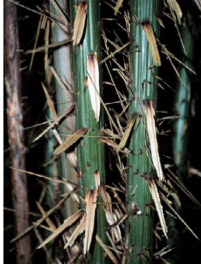
2 Astrocaryum chambira ARECACEAE