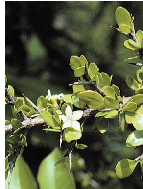
29 Randia aculeata RUBIACEAE