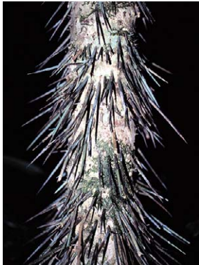
6 Cryosophila stauracantha ARECACEAE