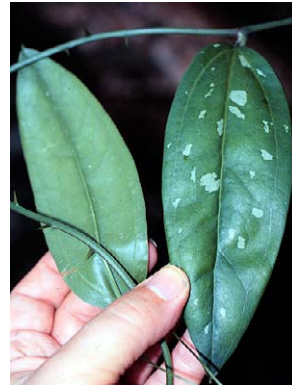
34 Smilax SMILACACEAE