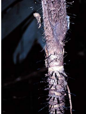
1 Aiphanes ARECACEAE

© Environmental & Conservation Programs, The Field Museum, Chicago, IL 60605 USA. [RRC@fmnh.org] Rapid Color Guide # 23 versión 1.4