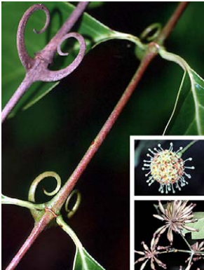
31 Uncaria guianensis RUBIACEAE