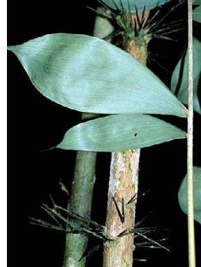
4 Bactris maraja ARECACEAE