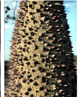
10 Chorisia speciosa BOMBACACEAE