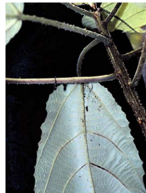
39 Urera baccifera URTICACEAE