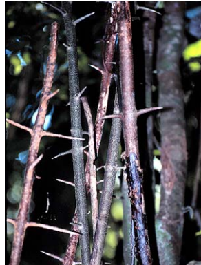
28 Guettarda foliacea RUBIACEAE