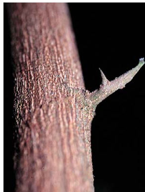
38 Celtis iguanaea ULMACEAE