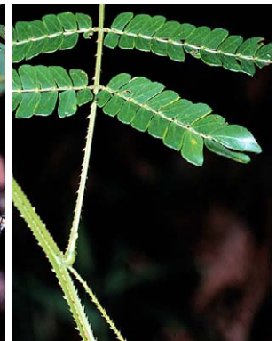
20 Piptadenia anolidermis FABACEAE