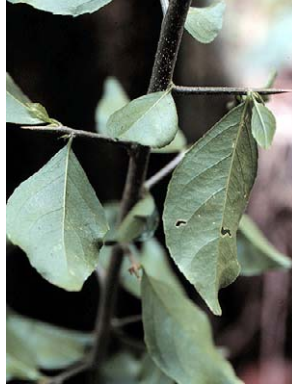
23 Pisonia aculeata NYCTAGINACEAE