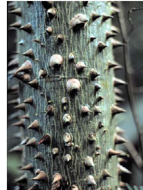
9 Ceiba pentandra (juv.) BOMBACACEAE