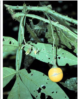
35 Solanum viridipes SOLANACEAE