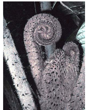
40 (helecho arboreo) PTERIDOPHYTA