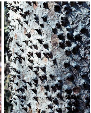
15 Hura crepitans EUPHORBIACEAE