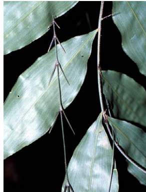
7 Desmoncus orthacanthos ARECACEAE