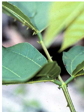
18 Erythrina FABACEAE