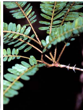
19 Machaerium cirriferrum FABACEAE