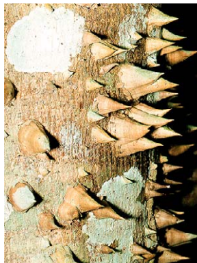
13 Jacaratia digitata CARICACEAE