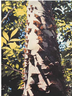
32 Zanthoxylum ekmanii RUTACEAE