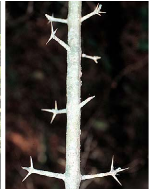
30 Randia armata RUBIACEAE