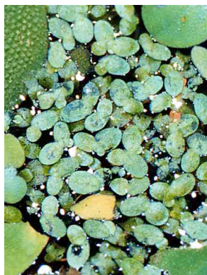
17 Lemna aequinoctialis LEMNACEAE