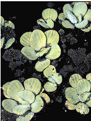
6 Pistia stratiotes ARACEAE