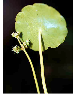
5 Hydrocotyle ranunculoides APIACEAE