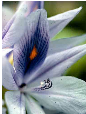
33 Eichhornia crassipes PONTEDERIACEAE