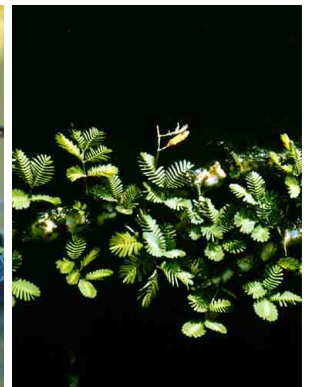
15 Neptunia natans FABACEAE