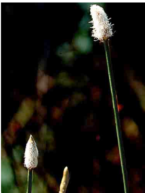
11 Eleocharis CYPERACEAE