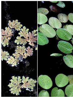
37 Azolla Salvinia PTERIDOPHYTA