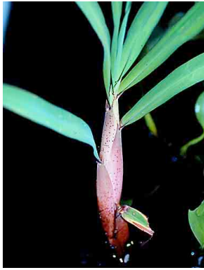
27 Paspalum repens POACEAE