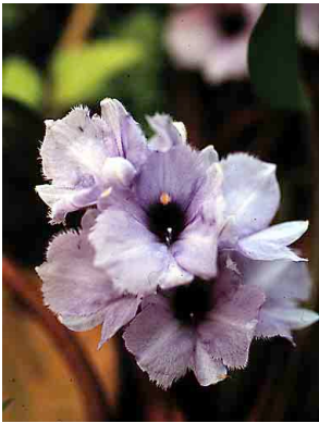
31 Eichhornia azurea PONTEDERIACEAE