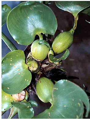
32 Eichhornia crassipes PONTEDERIACEAE