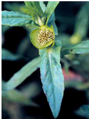
7 Enydra anagallis ASTERACEAE