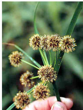
13 Scirpus cubensis CYPERACEAE