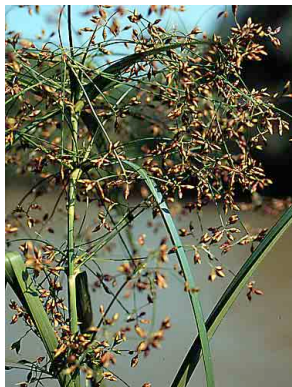
12 Rhynchospora corymbosa CYPERACEAE