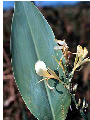
9 Canna glauca CANNACEAE