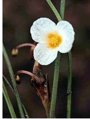
3 Sagittaria rhombifolia ALISMATACEAE