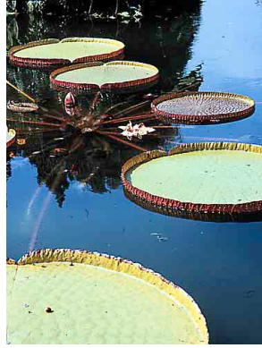
23 Victoria amazonica NYMPHAEACEAE