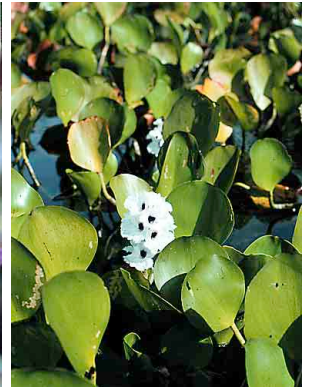
30 Eichhornia azurea PONTEDERIACEAE