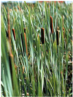
36 Typha domingensis TYPHACEAE