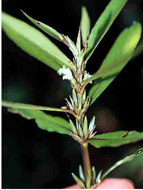
1 Hygrophila guianensis ACANTHACEAE

con el apoyo del Andrew Mellon Foundation. [www.fmnh.org/plantguides] ; y Environmental & Conservation Programs, The Field Museum, Chicago, IL 60605 USA. [RRC@fmnh.org] Rapid Color Guide #9 version 1.7