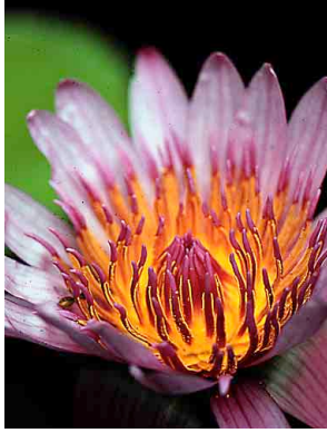
22 Nymphaea NYMPHAEACEAE