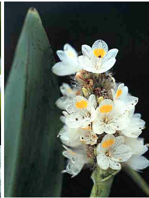
34 Pontederia parviflora PONTEDERIACEAE