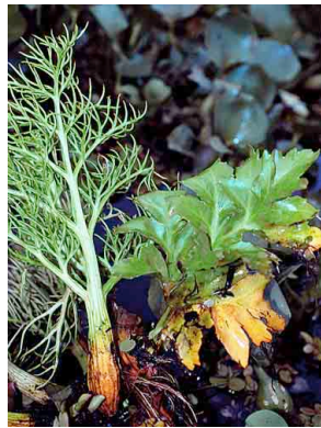
38 Ceratopteris pteridoides PTERIDOPHYTA