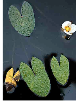
4 Sagittaria guayanensis ALISMATACEAE