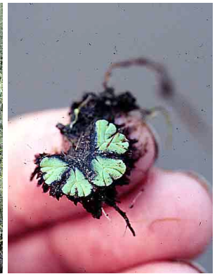
40 Ricciocarpus natans BRYOPHYTA