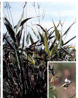
20 Thalia geniculata MARANTACEAE