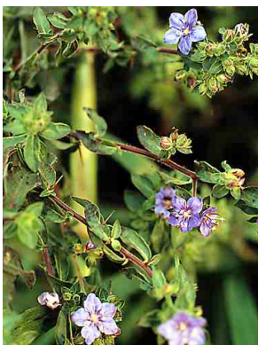
16 Hydrolea spinosa HYDROPHYLLACEAE