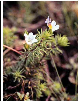
35 Bacopa myriophylloides SCROPHULARIACEAE