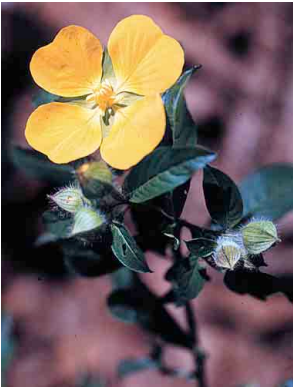
26 Ludwigia lagunae cf. ONAGRACEAE