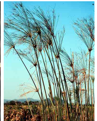
10 Cyperus giganteus CYPERACEAE