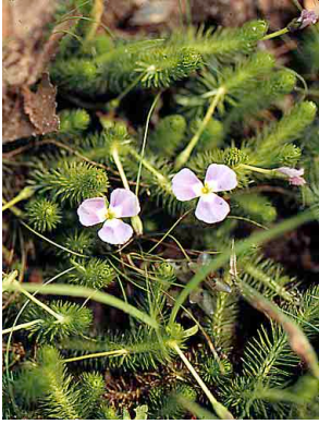
21 Mayaca fluviatilis MAYACEAE