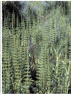
39 Equisetum giganteum PTERIDOPHYTA