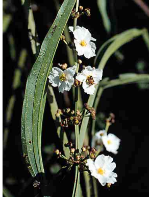
2 Echinodorus paniculatus ALISMATACEAE