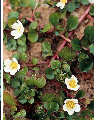
25 Ludwigia helminthorrhiza ONAGRACEAE