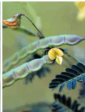
14 Aeschynomene FABACEAE