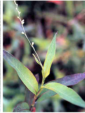
29 Polygonum punctatum POLYGONACEAE