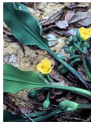
19 Limnocharis flava LIMNOCHARITACEAE