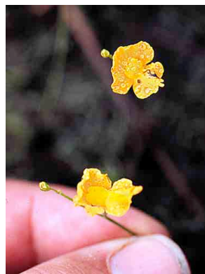
18 Utricularia gibba LENTIBULARIACEAE